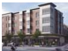
Affordable Homeowner- ship Pages 3