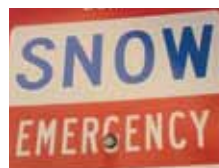
Winter Tips and Reminders Pages 4-5