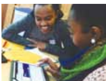
Find It Cambridge Page 2