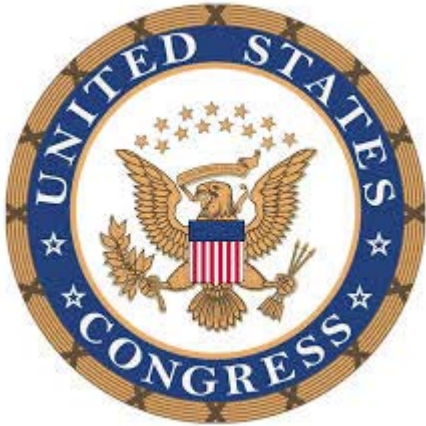
Congressional Budget Authority