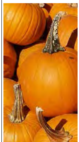
Charles Square Farmers Market

Charles Hotel Courtyard, 1 Bennett Street