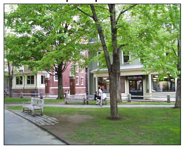
Winthrop Square Park