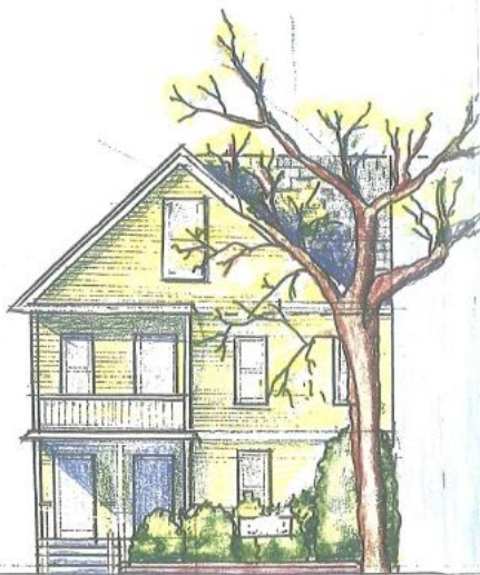
2557 MASS. AVE.