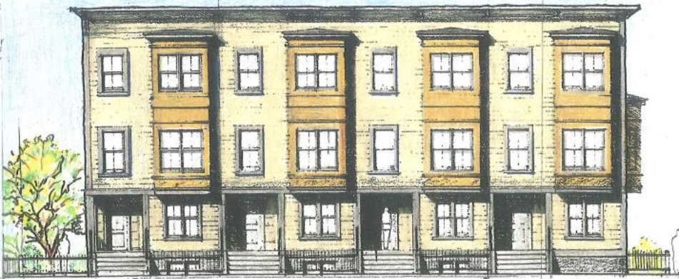
2551 MASS. AVE. - VERSION 2