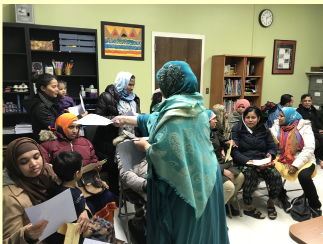
CPS Workshop Part I :Cultural Differences in Bangla at The Fletcher Maynard Academy

CET partnered with Cambridge Public Schools to host a 2-part workshop for immigrant families in the elementary schools. The first workshop focused on cultural differences between schools in a parent's home country and the United States. Part 2 of the workshop focused on how Cambridge elementary schools work. The workshops were offered in 5 different languages and hosted across the elementary schools. We had many families attend and participate in the workshops this year!