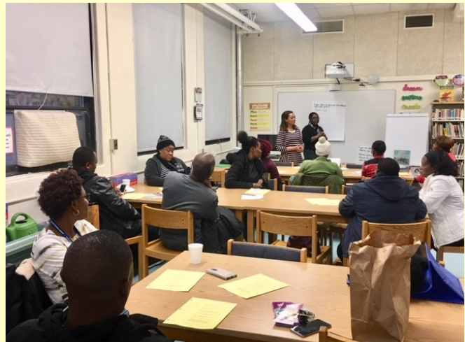
CPS Workshop Part I :Cultural Differences in Creole at The Fletcher Maynard Academy