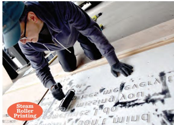
Steam Roller Printing

Join the Puppeteers Cooperative to make colorful swimming fish puppets that you can march with in The Mermaid Promenade. There will also be the opportunity to learn about and try on professionally made puppets that you can wear in the parade while marching with The Puppeteers Cooperative. puppetco-op.org