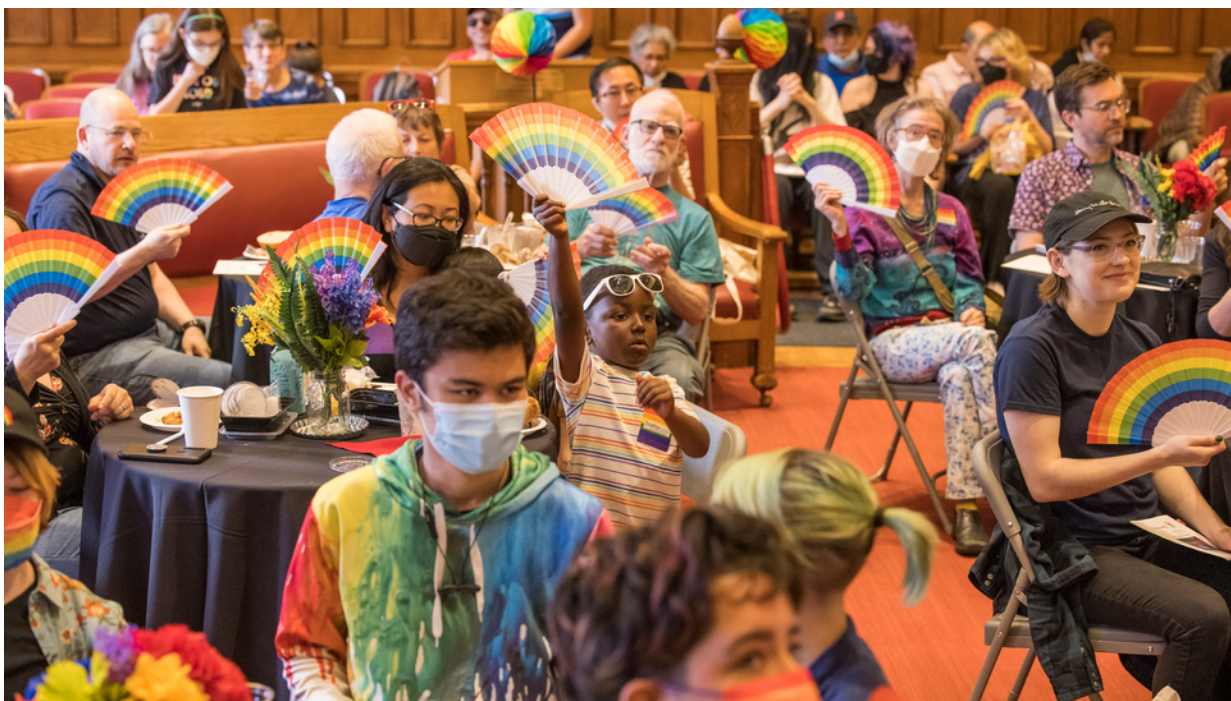
Pride Brunch in June, 2022