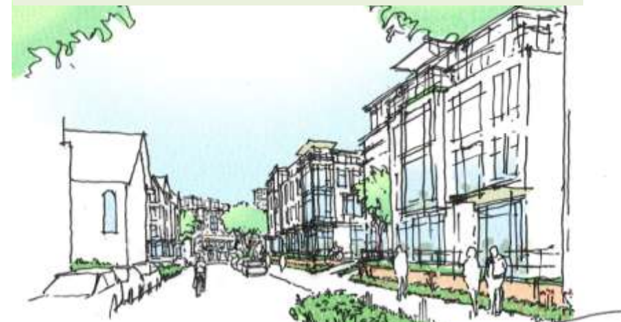
Bishop Allen Drive: Green infrastructure and neighborhood-scale housing and small business spaces enhancing walkability along

Enrich neighborhood walkability and livability with safe, green streets and improved access choices