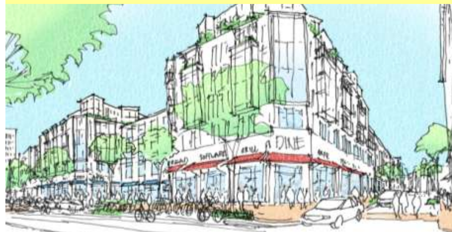
Massachusetts Ave: Housing framing a public plaza and additional retail

Increase housing stock and support community diversity through more varied housing choices