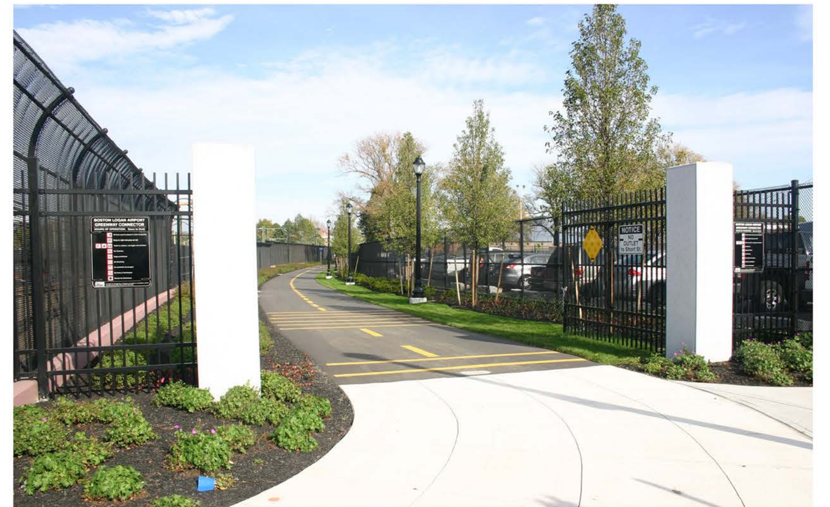
East Boston Greenway, Boston, MA