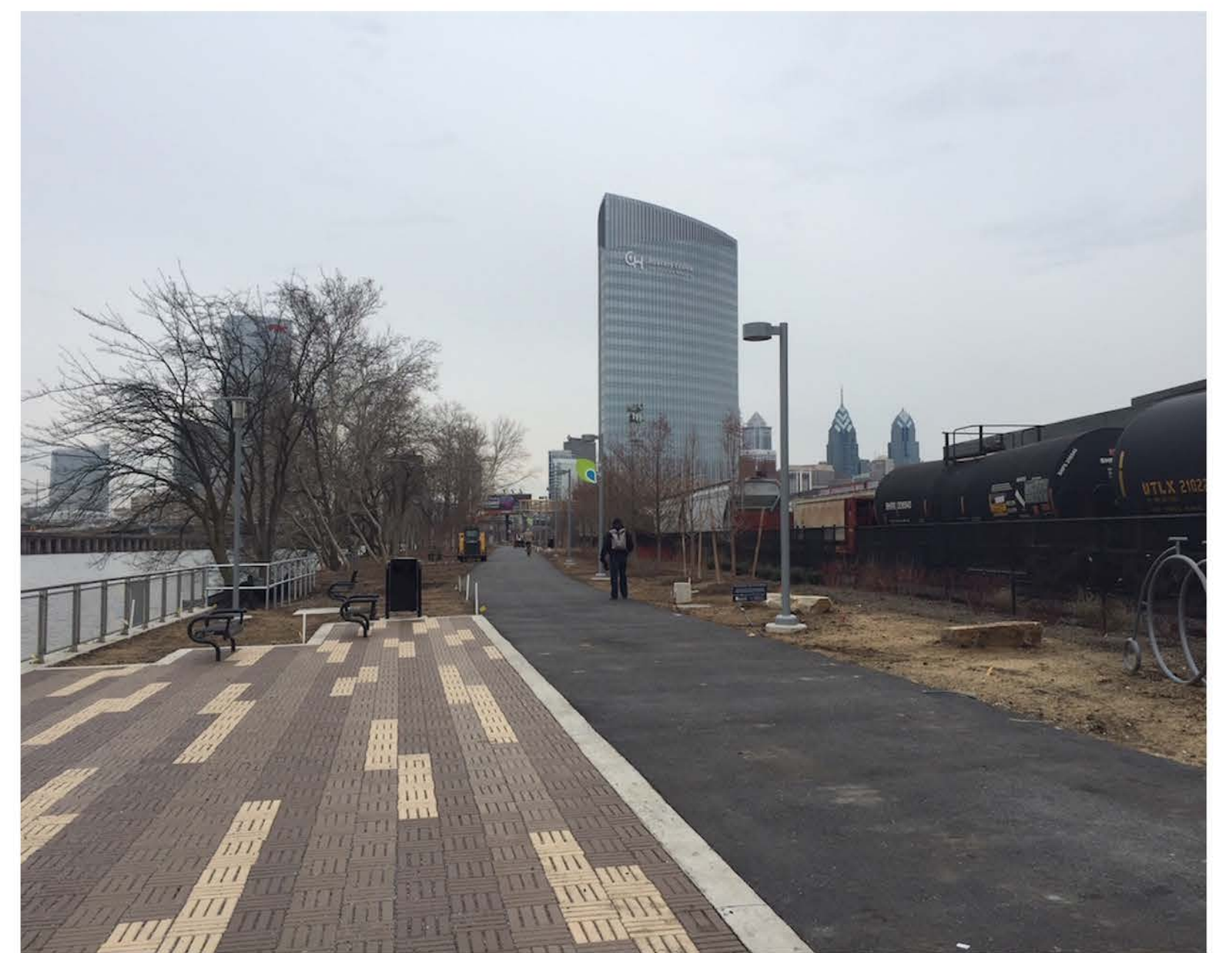
Schuylkill River Valley Trail, Philadelphia, PA