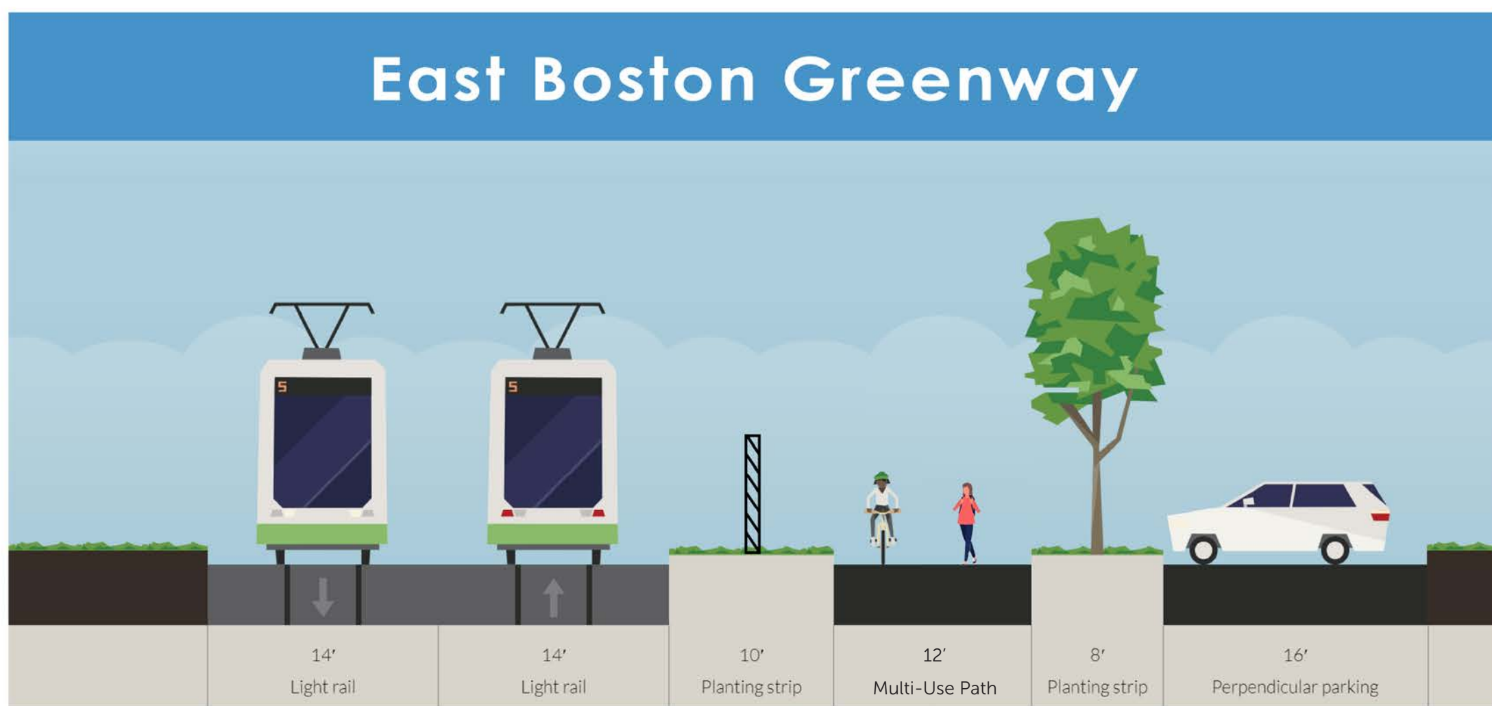
Typical cross-section of East Boston Greenway