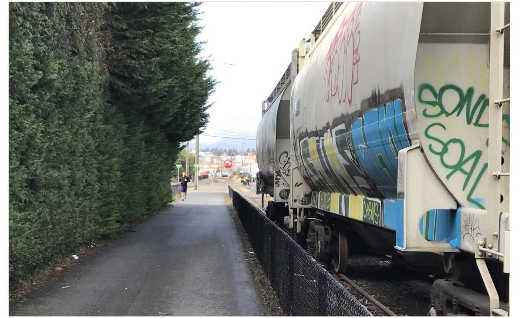
Burke-Gilman's rail element, Seattle, WA