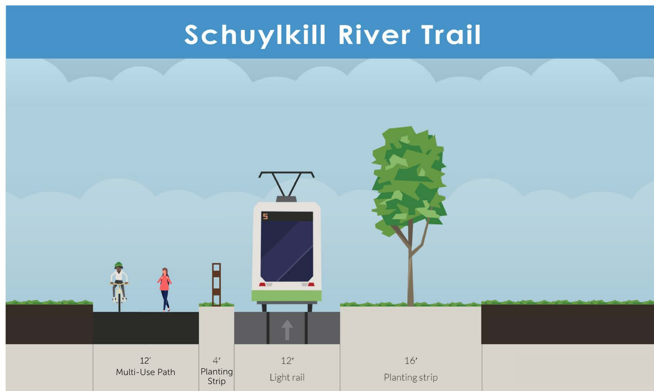
Typical cross-section of Schuylkill River Trail