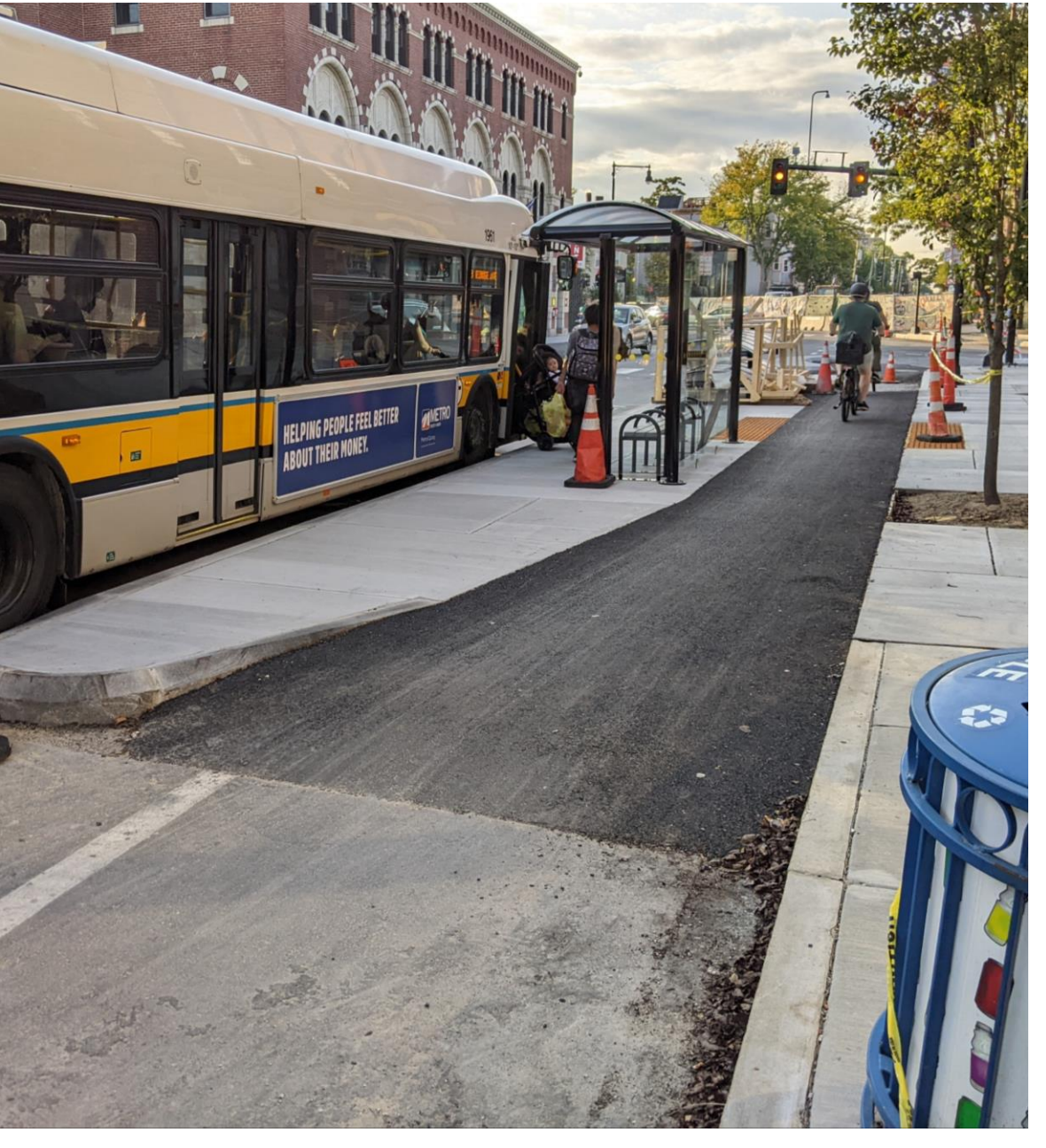
City of Cambridge - Community Development Department