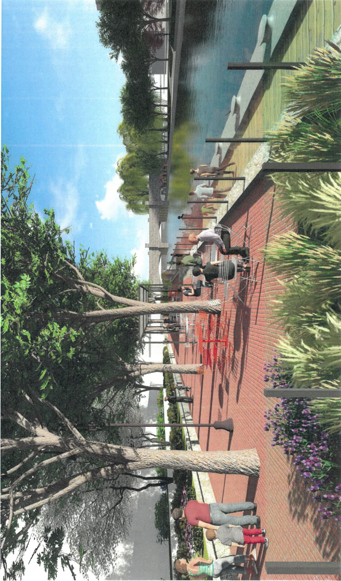
CANAL PARK AFTER APRIL 29, 2019