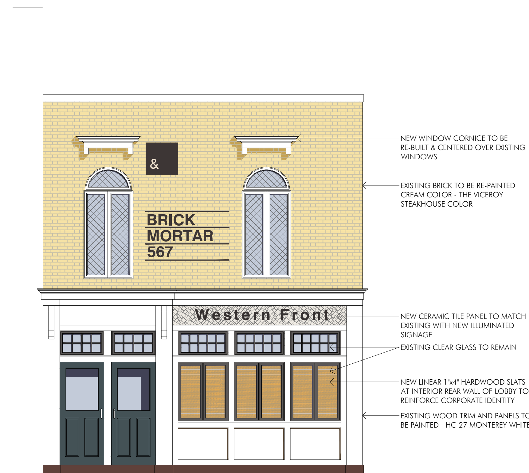
BM HC-4 HAWTHORNE YELLOW, BRICK BM HC-27 MONTEREY WHITE, TRIM BM HC-157 NARRAGANSET GREEN DOOR