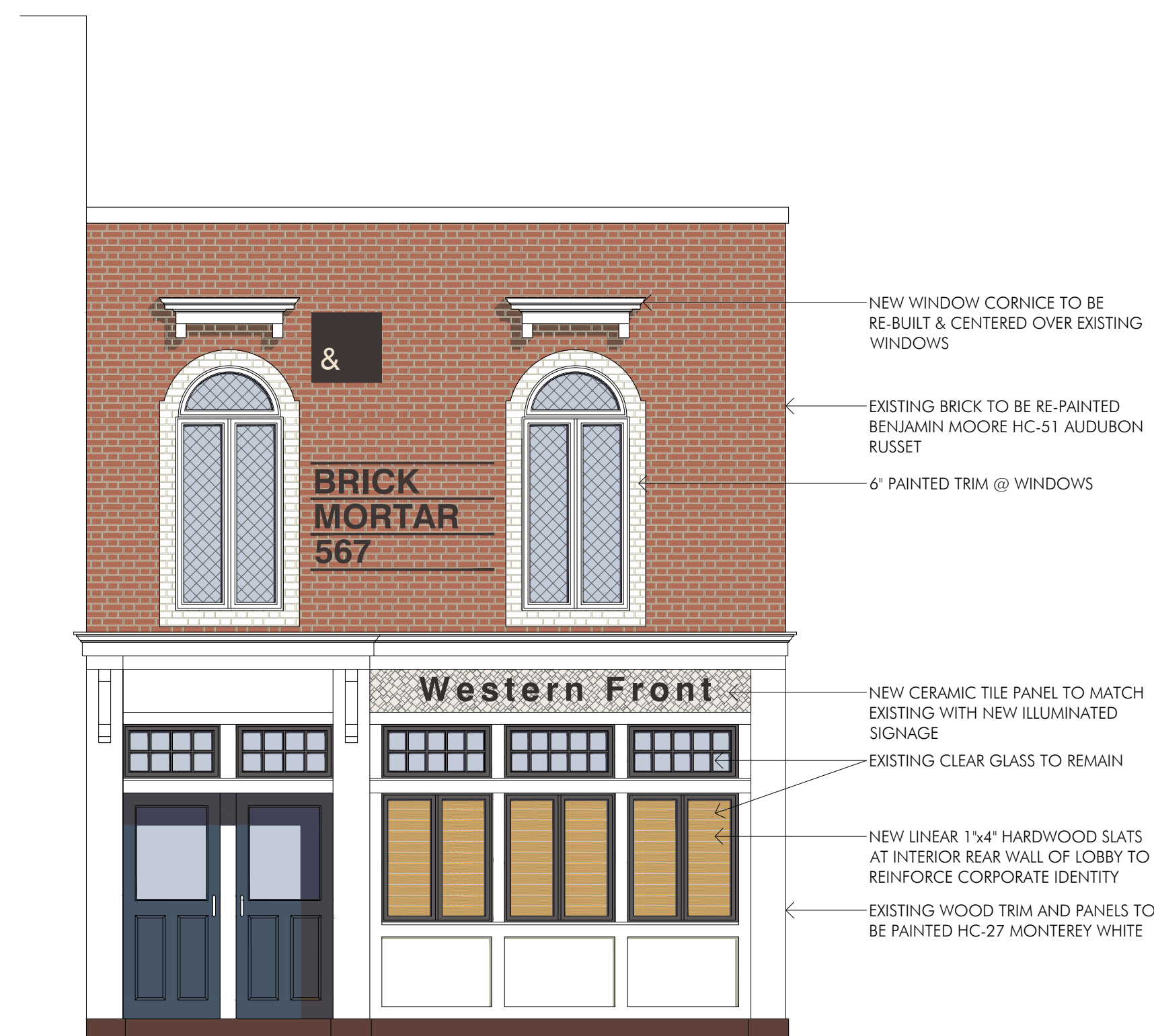
BM HC-51 AUDUBON RUSSET, BRICK BM HC-27 MONTEREY WHITE, TRIM BM HC-157 NARRAGANSET GREEN DOOR