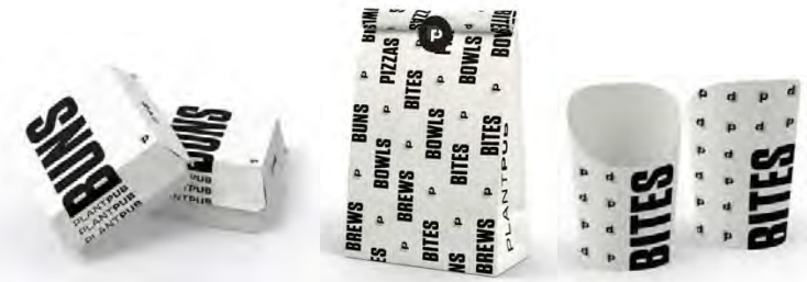
On a mission to make eating better for yourself and better for the world, approachable and fun for all.