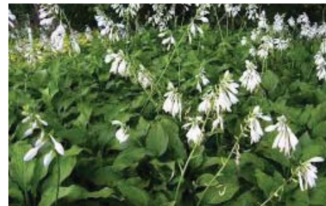
Hosta 'Royal Standard' Royal Standard Plantain Lily