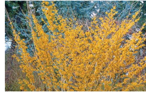
Hamamelis x intermedia 'Arnold Promise' Witch Hazel