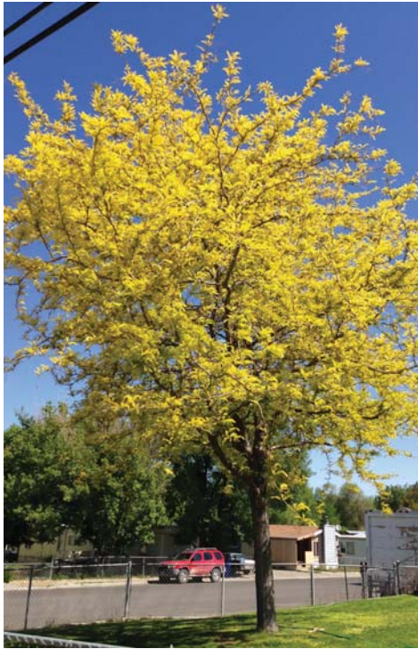
Gleditsia triacanthos "Skyline" Skyline Honeylocust