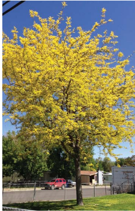
Cladastris kentukea Kentucky Yellowwood