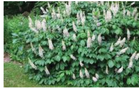
Dryopteris erythrosora Autumn Fern