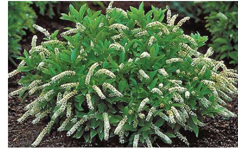
Itea virginica Virginia Sweetspire