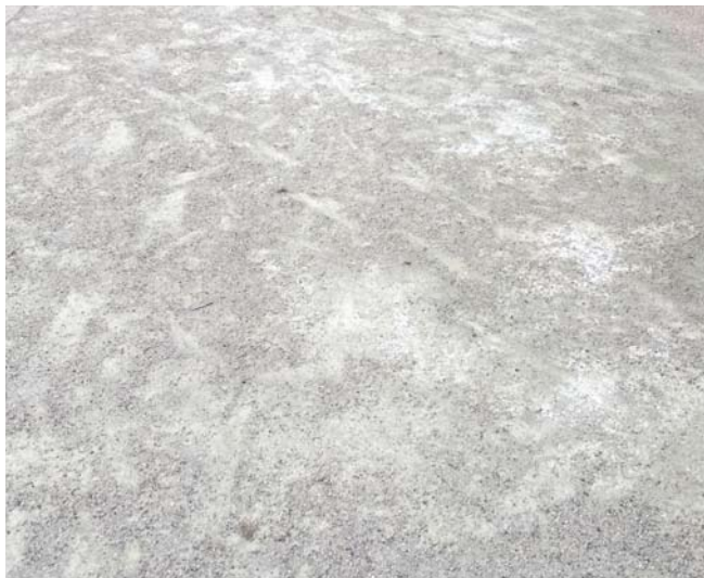
Decomposed Granite Pavement