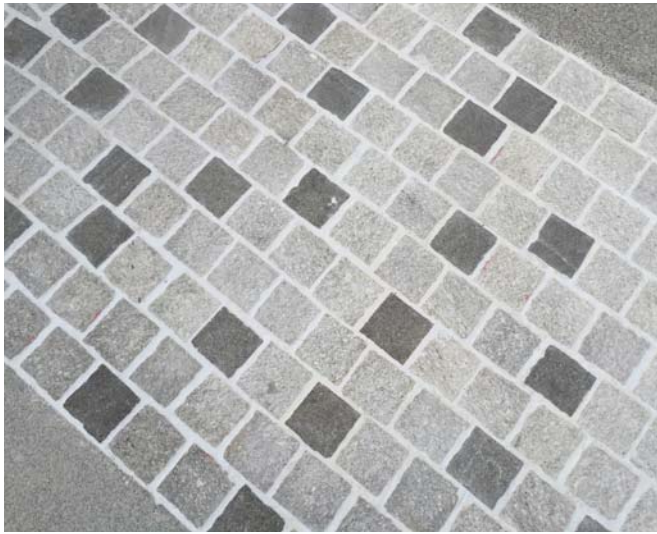
Stone Setts Pavement