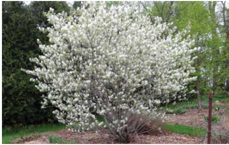
Amelanchier arborea Shadbush