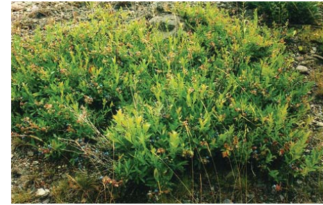
Vaccinium angustifolium Lowbush Blueberry