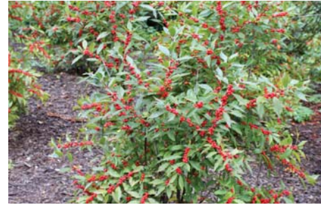
Ilex verticillata Winterberry Holly