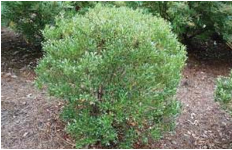
Ilex glabra Inkberry