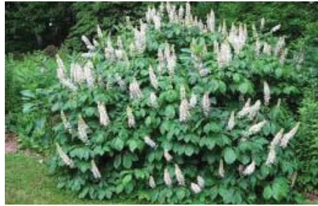
Aesculus parviflora Bottlebrush Buckeye