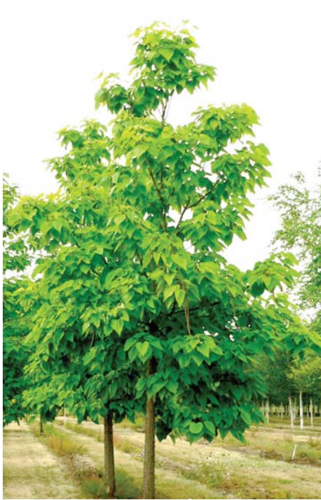
Catalpa speciosa Catalpa