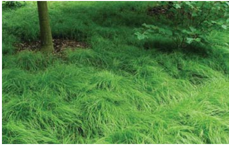
Carex pensylvanica Pennsylvania sedge