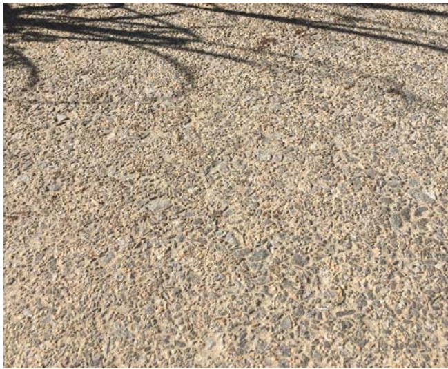
Exposed Aggregate Concrete Pavement