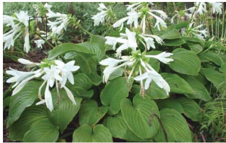
Hosta plantaginifolia Plantain Lily