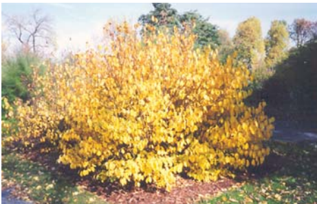
Lindera benzoin Common Spicebush