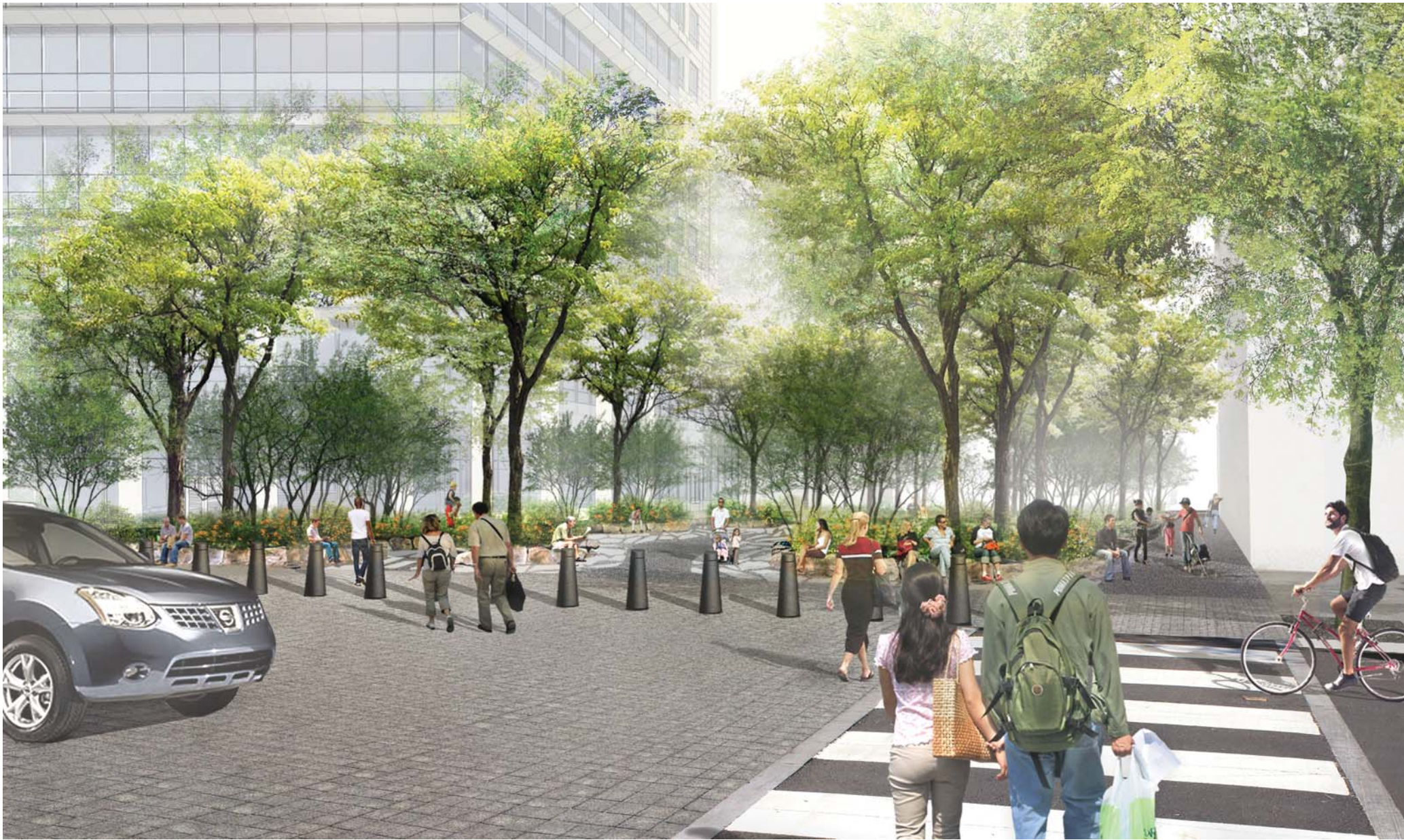
Proposed View Towards Baldwin Park