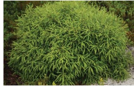
Comptonia peregrina Sweet fern