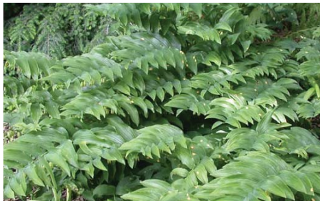
Polygonatum biflorum Solomon's Seal