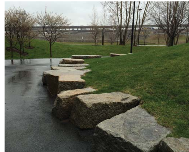
Reclaimed Granite Block Seatwalls