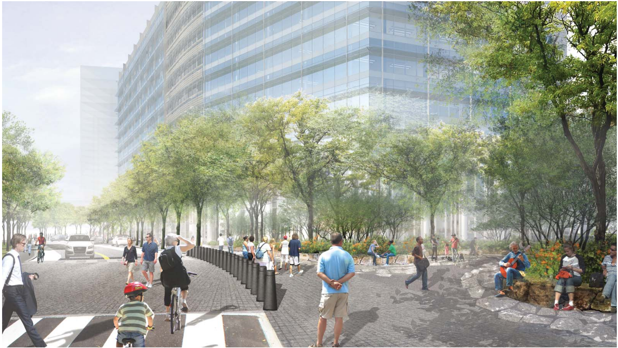
Proposed View Towards Building JK Entrance