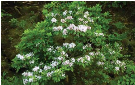
Kalmia latifolia Mountain Laurel