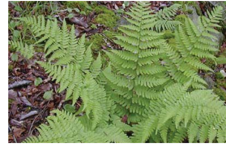
Dryopteris marginalis Leatherwood Fern