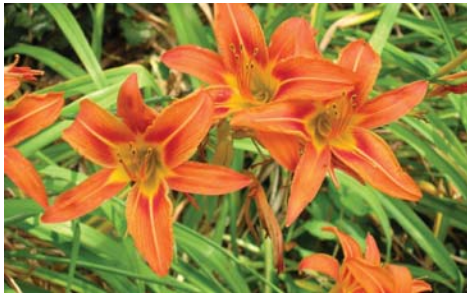
Hemerocallis fulva Tiger Daylily