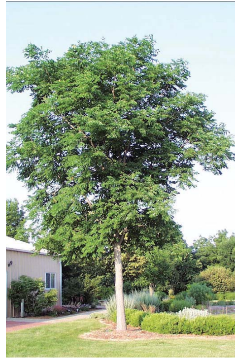
Gymnocladus dioica Kentucky Coffee Tree