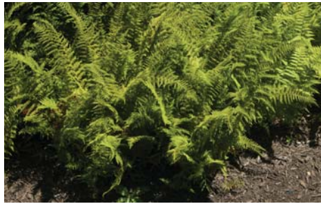
Dennstaedtia punctilobula Hay-Scented Fern