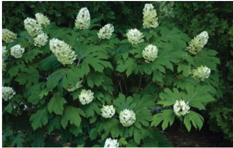
Hydrangea quercifolia Oakleaf Hydrangea