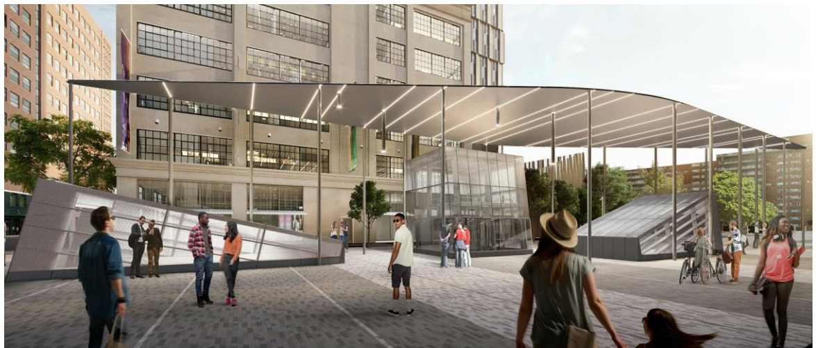
Image 1: Rendering of Updated MBTA Station / Headhouse (Information Received January 20, 2020)

Image 1 shows a rendering of the updated MBTA station / headhouse while Image 2 shows a plan view of the MBTA headhouse in relation to Buildings 4 and 5 for reference.