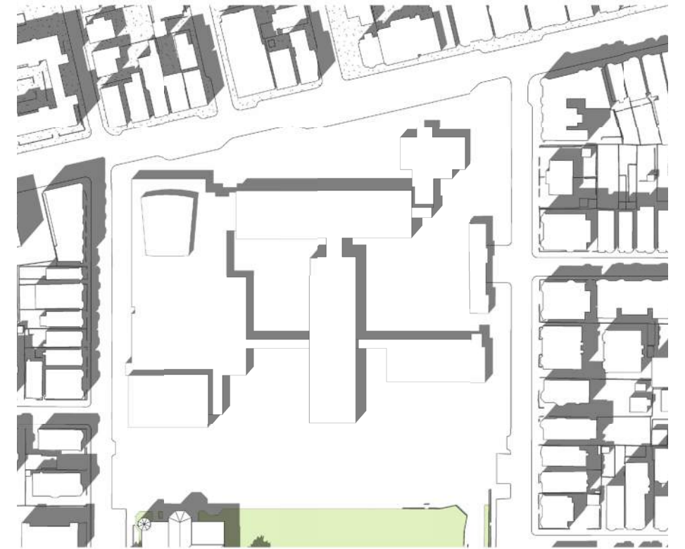
EXISTING BUILDING 3PM 6/21