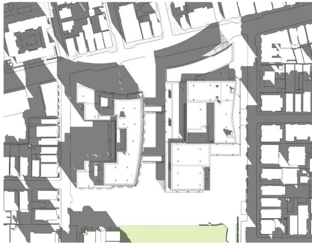
PROPOSED DESIGN 12PM 12/20