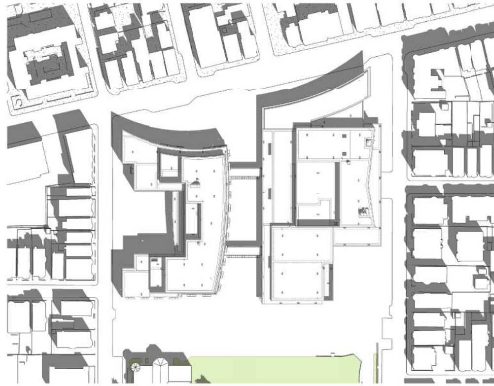
PROPOSED DESIGN 12PM 9/21