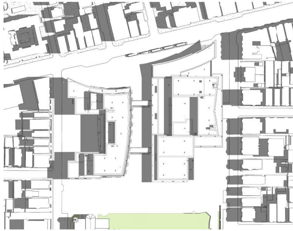
PROPOSED DESIGN 9AM 9/21