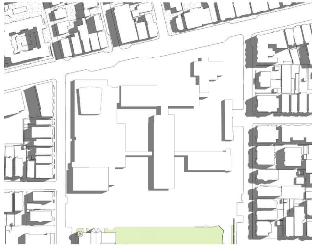
EXISTING BUILDING 9AM 6/21