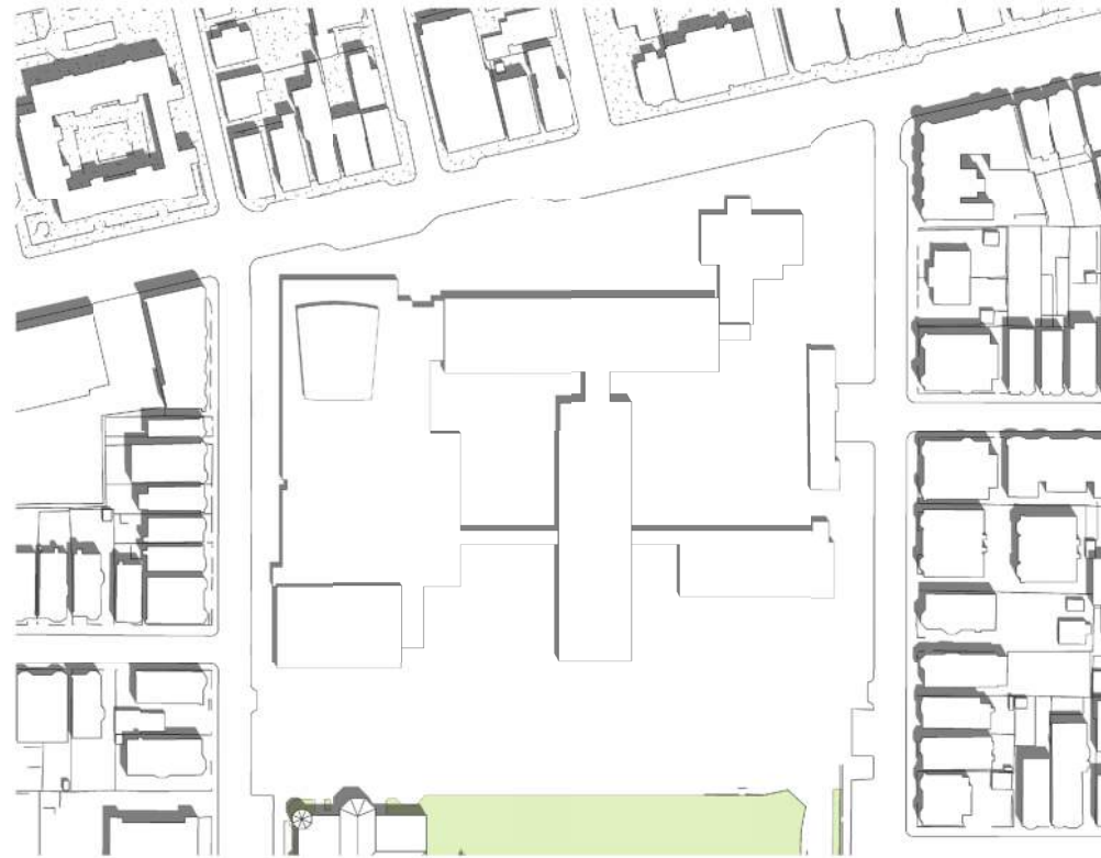
EXISTING BUILDING 12PM 6/21