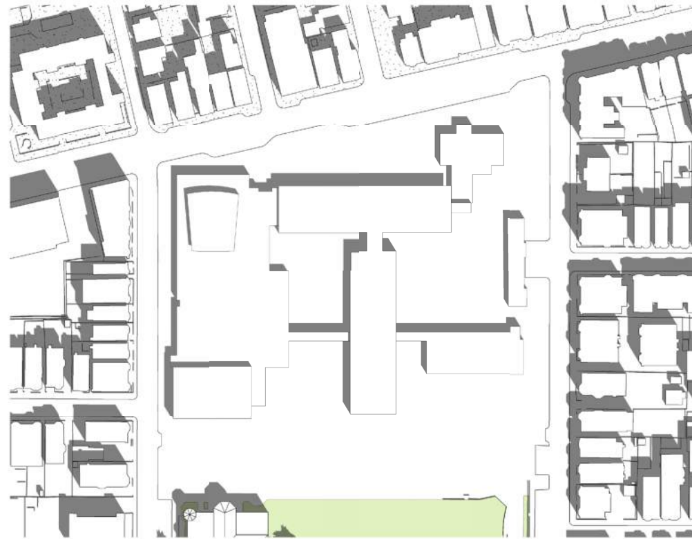
EXISTING BUILDING 12PM 9/21