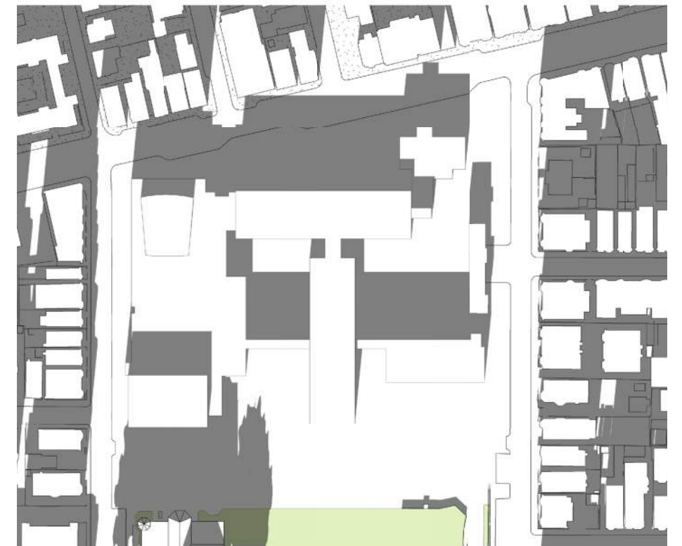
EXISTING BUILDING 3PM 12/20