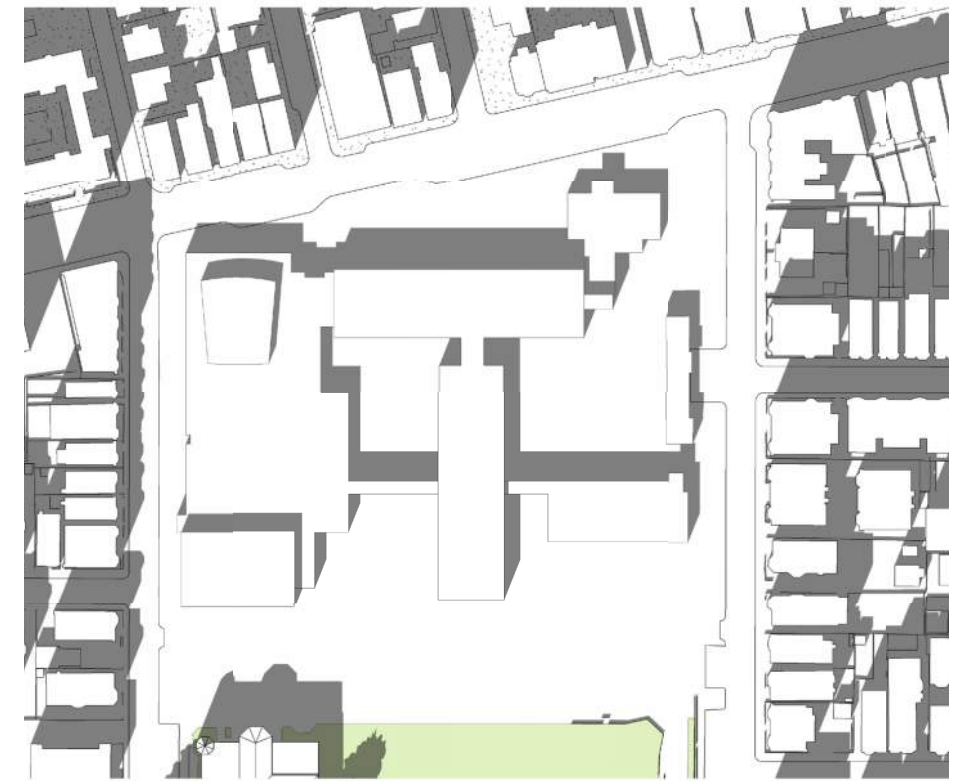
EXISTING BUILDING 3PM 9/21