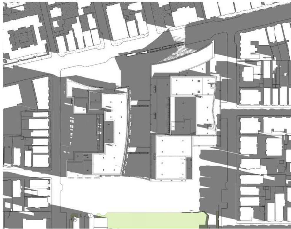
PROPOSED DESIGN 9AM 12/20