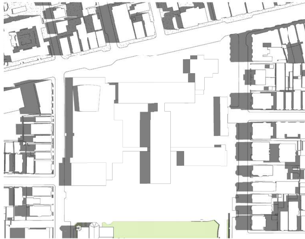
EXISTING BUILDING 9AM 9/21