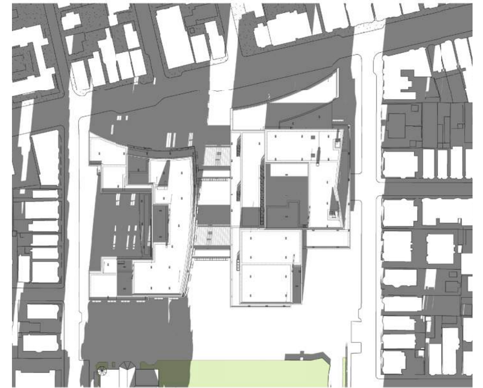
PROPOSED DESIGN 3PM 12/20