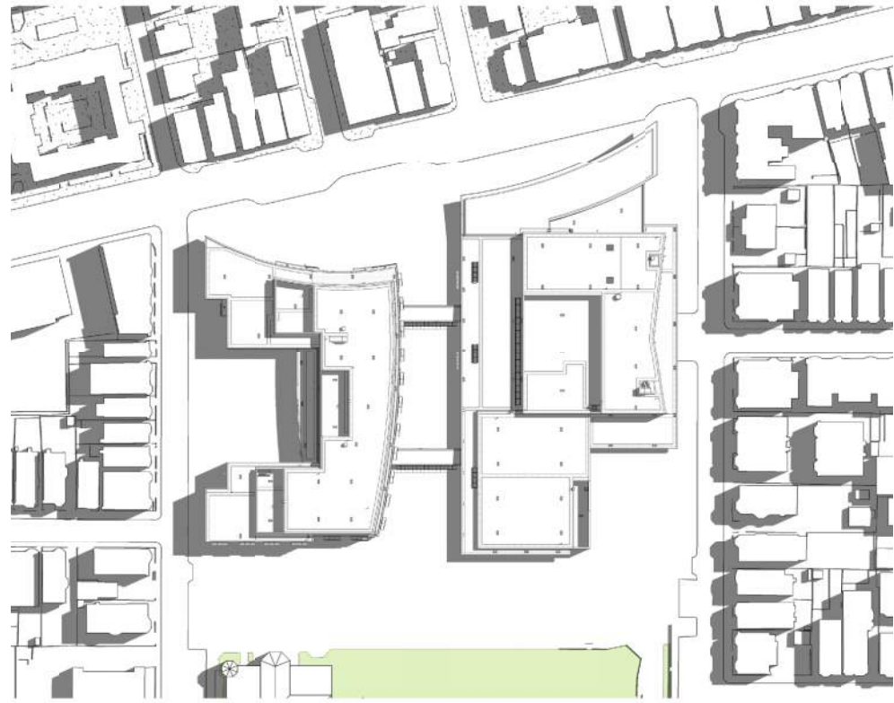
PROPOSED DESIGN 9AM 6/21