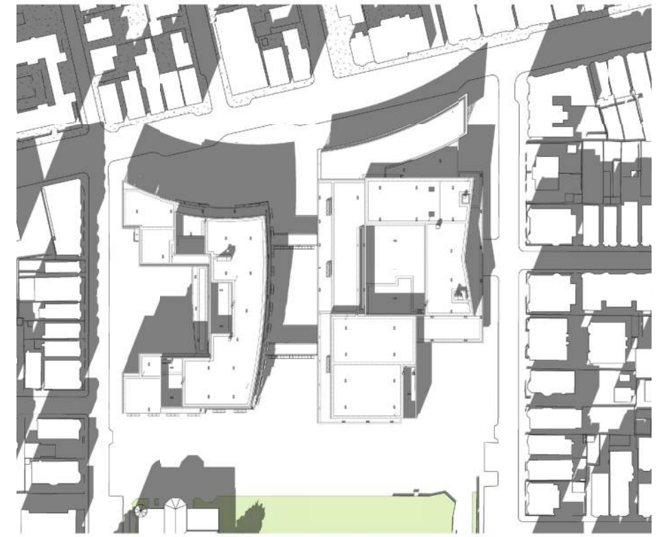
PROPOSED DESIGN 3PM 9/21