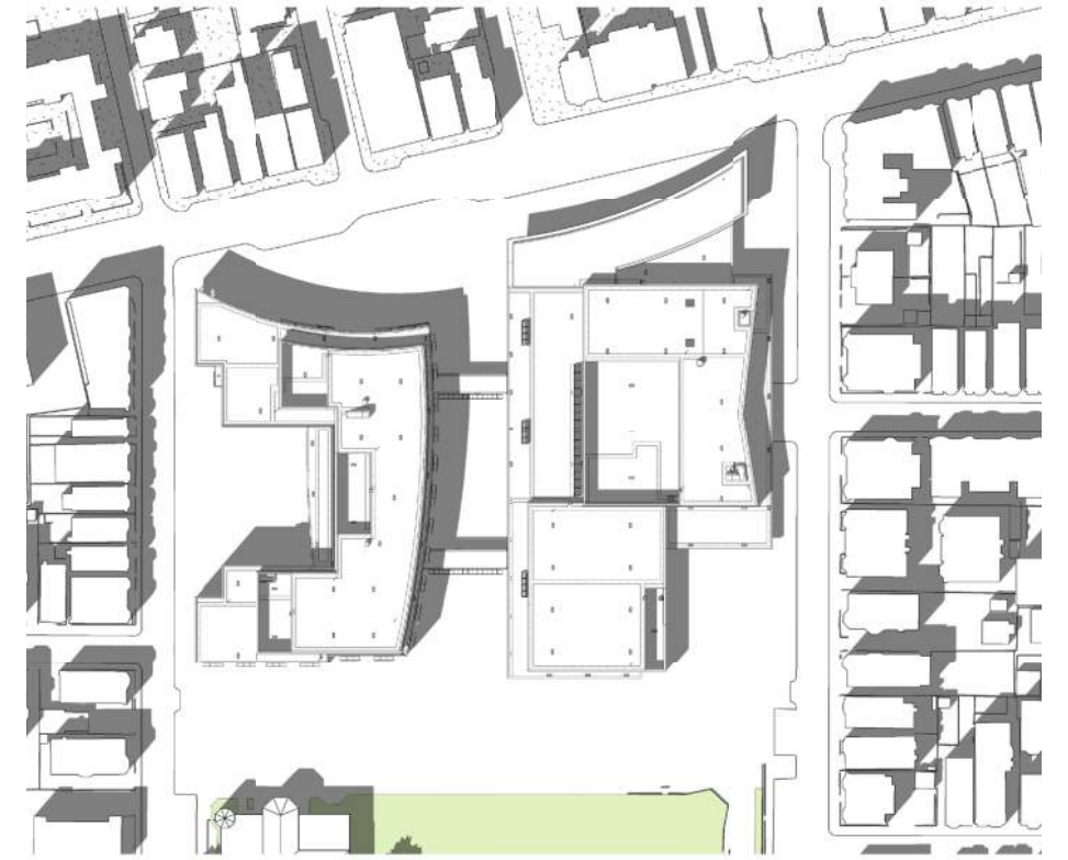
PROPOSED DESIGN 3PM 6/21