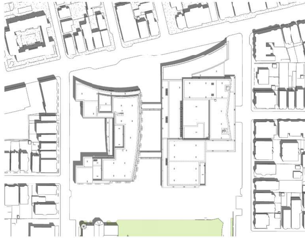
PROPOSED DESIGN 12PM 6/21