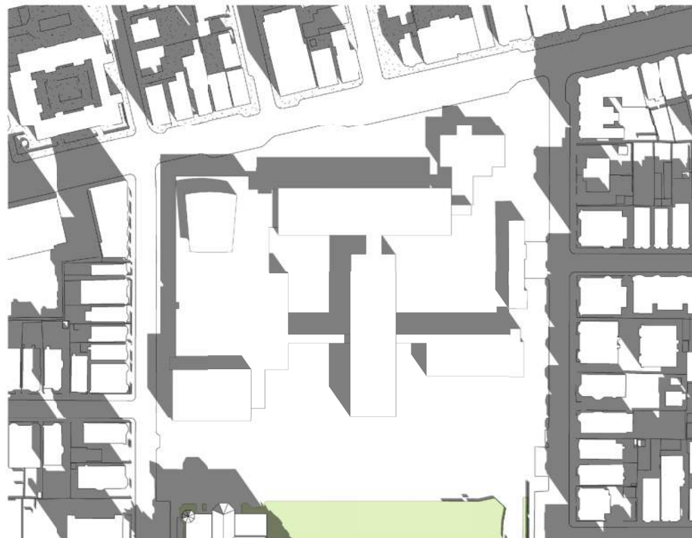
EXISTING BUILDING 12PM 12/20