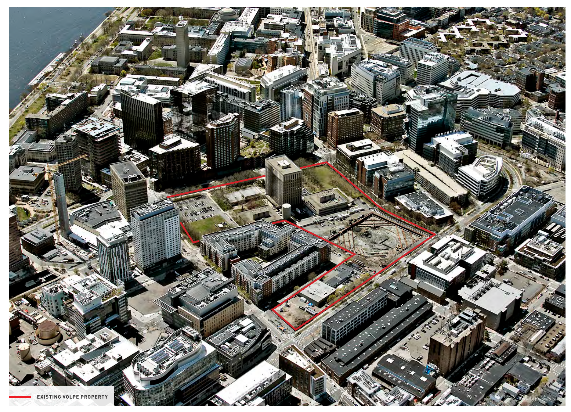
Figure 1: Locus