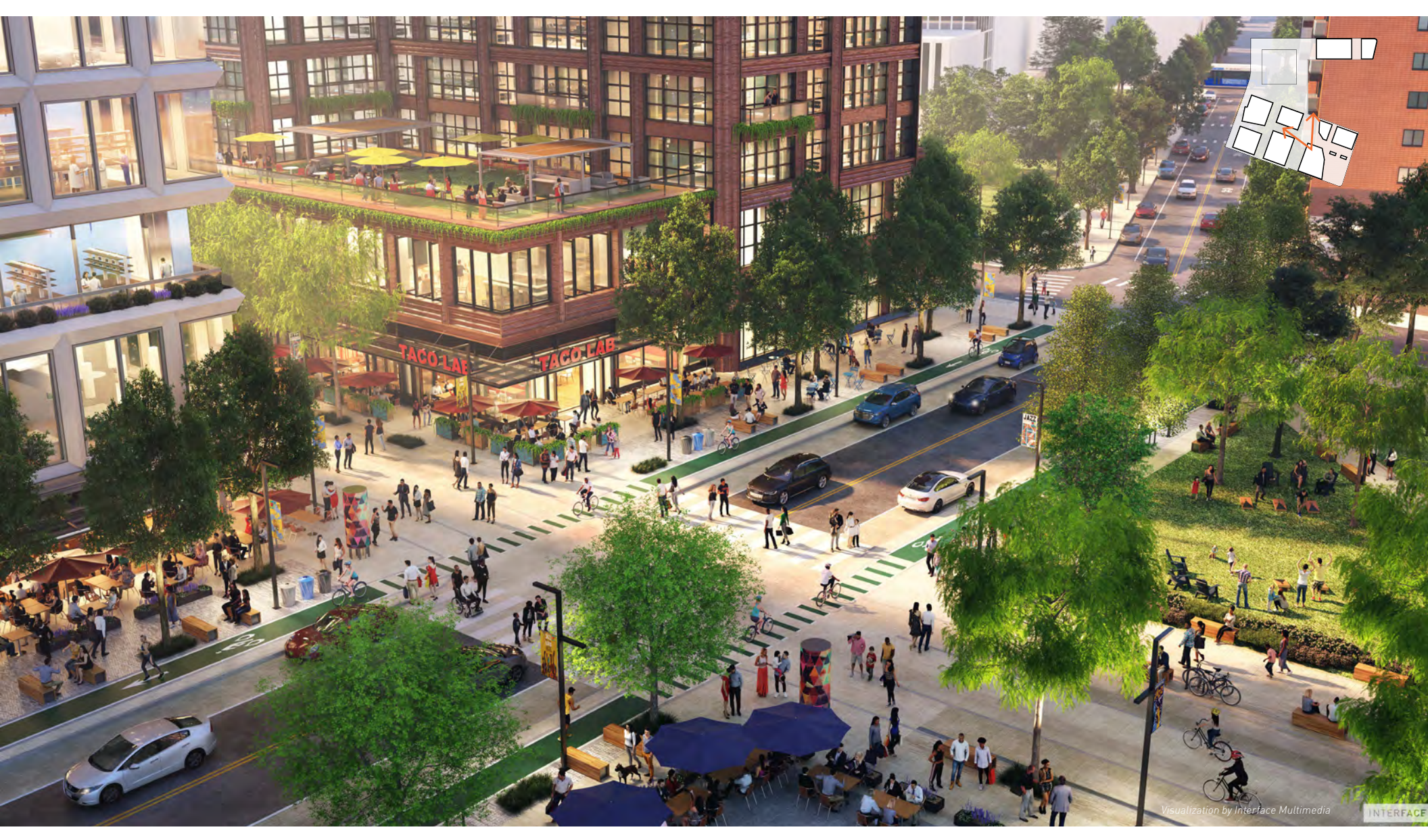
Figure 8: Fifth Street