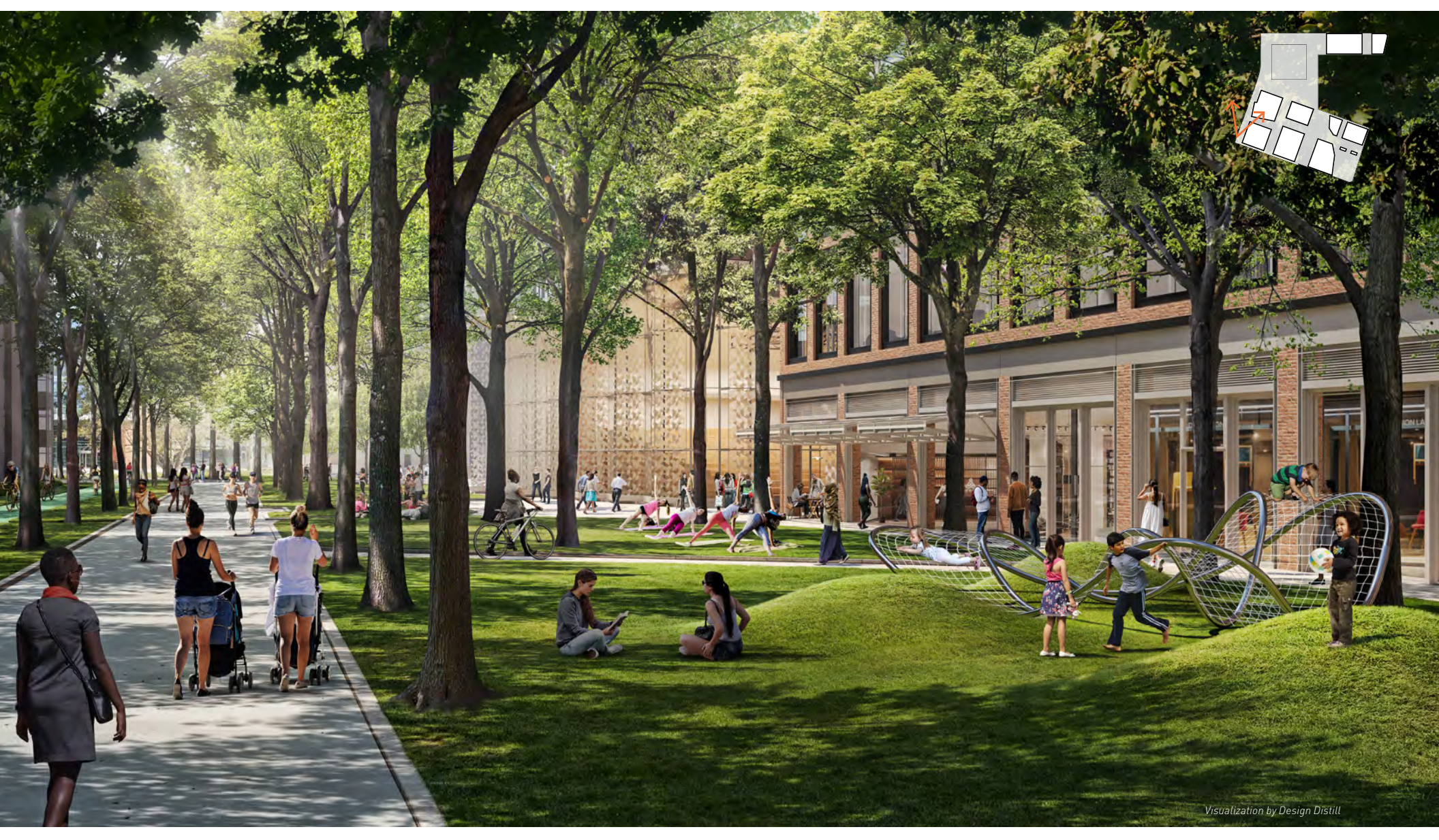
Figure 4: Sixth Street Park