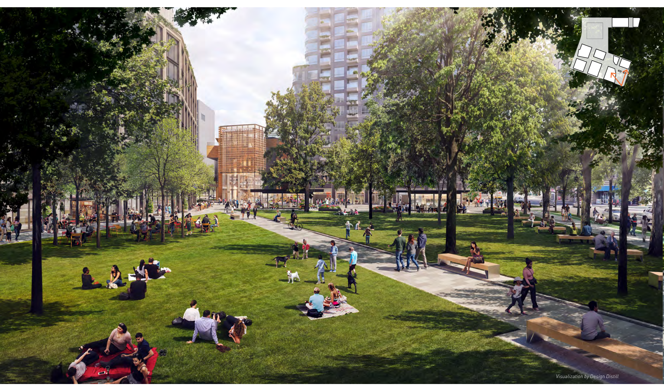
Figure 3: Third Street Park