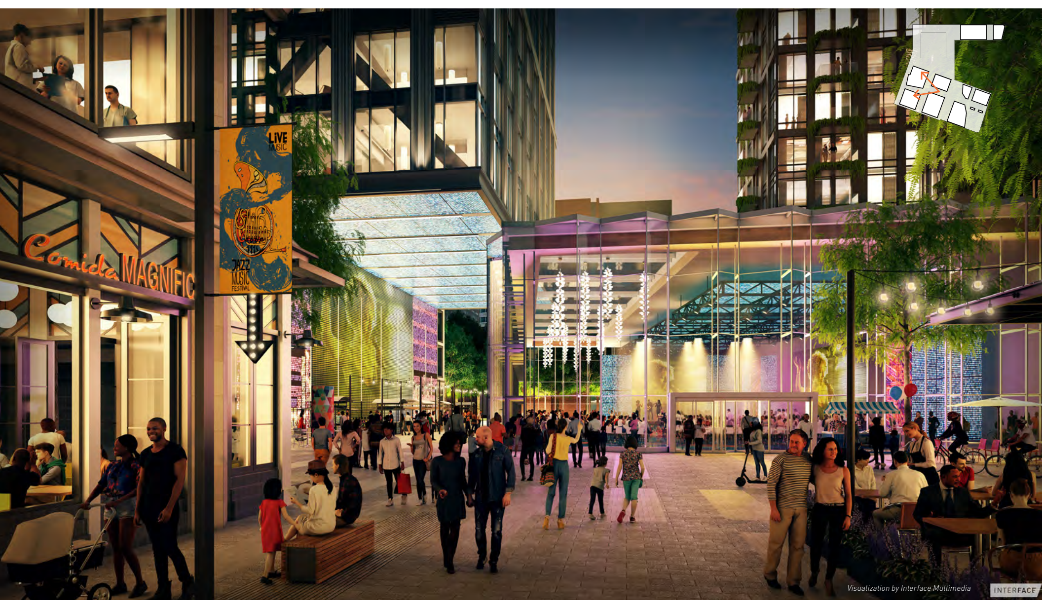
Figure 7: Entertainment Venue