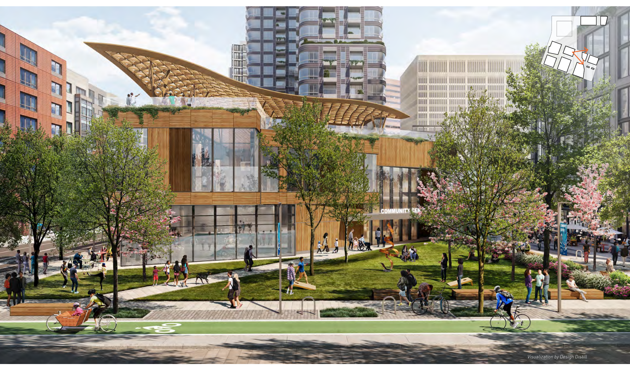
Figure 5: Community Center