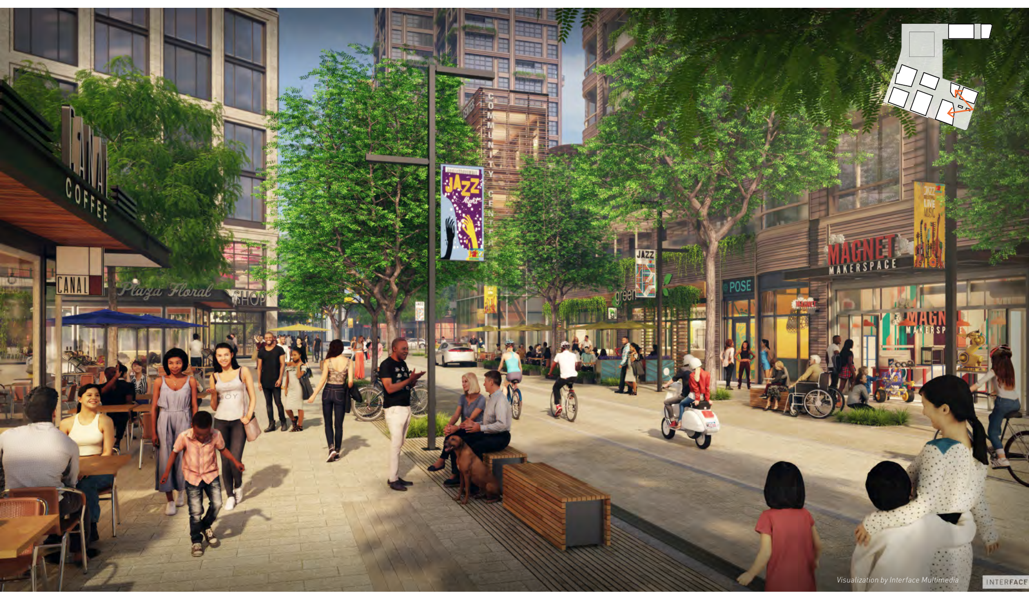
Figure 6: Broad Canal Way