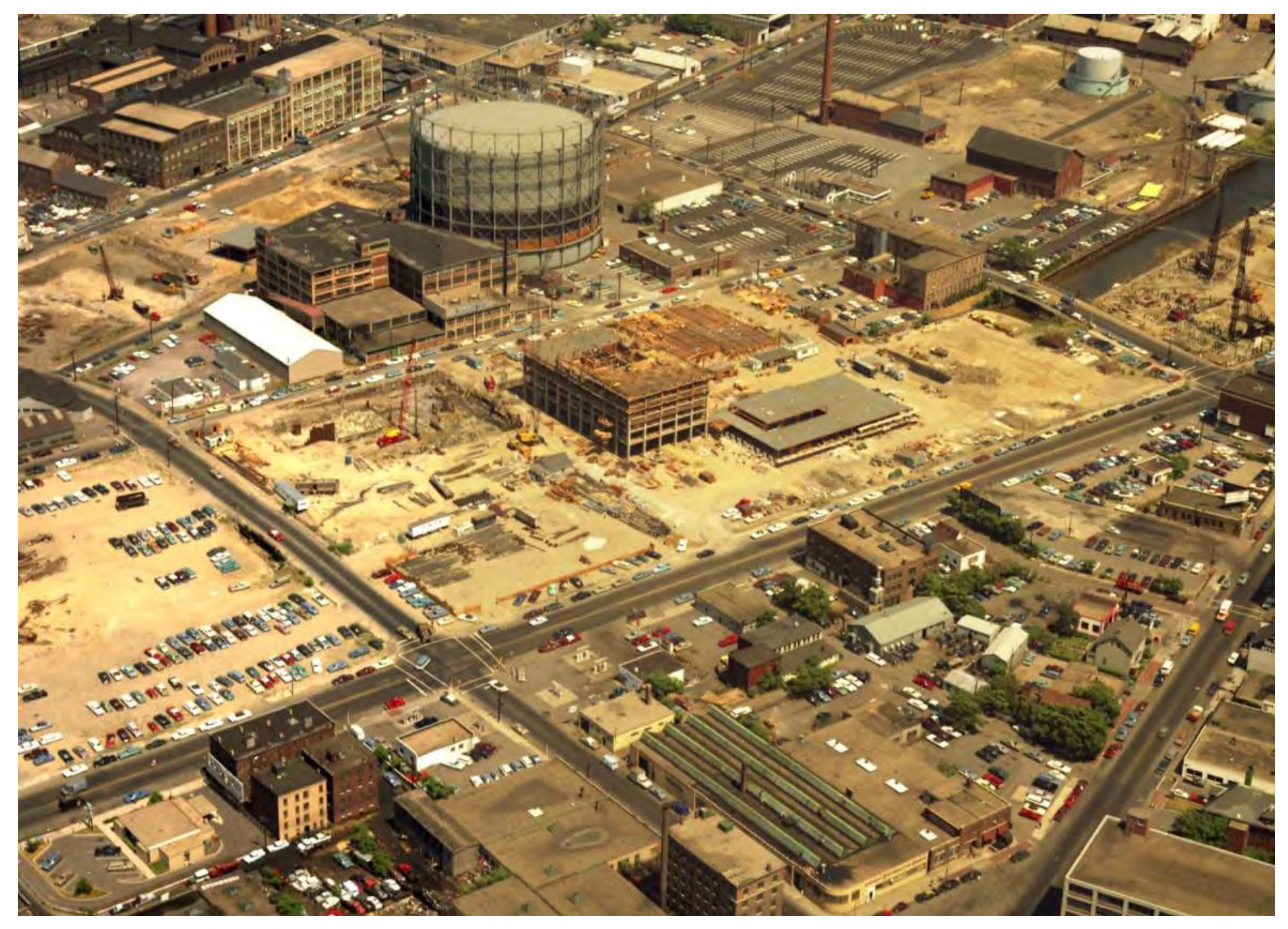
Figure 2: Historical Image of Site - 1960s Construction of Volpe National Transportation Systems Center