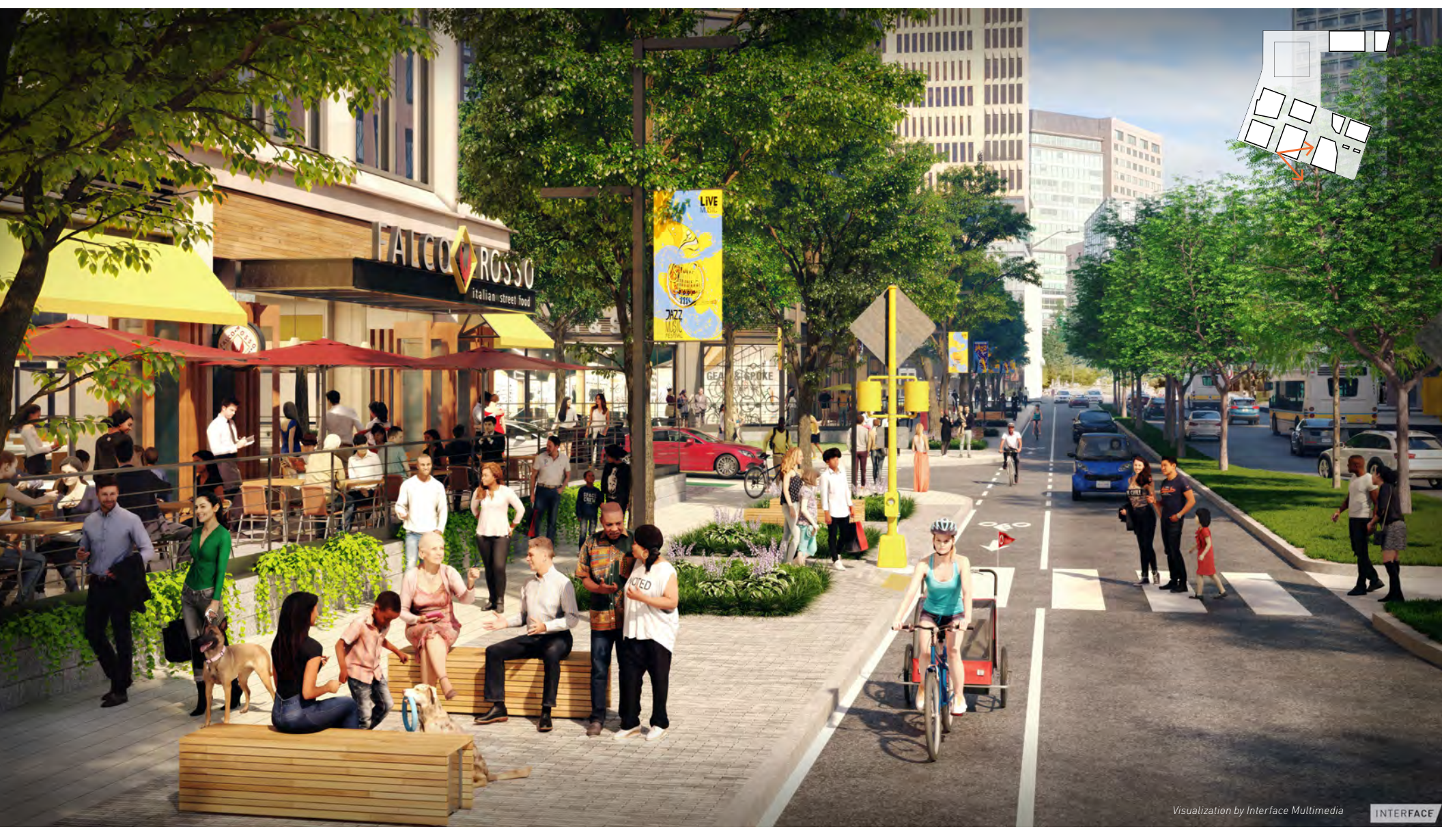
Figure 10: Broadway