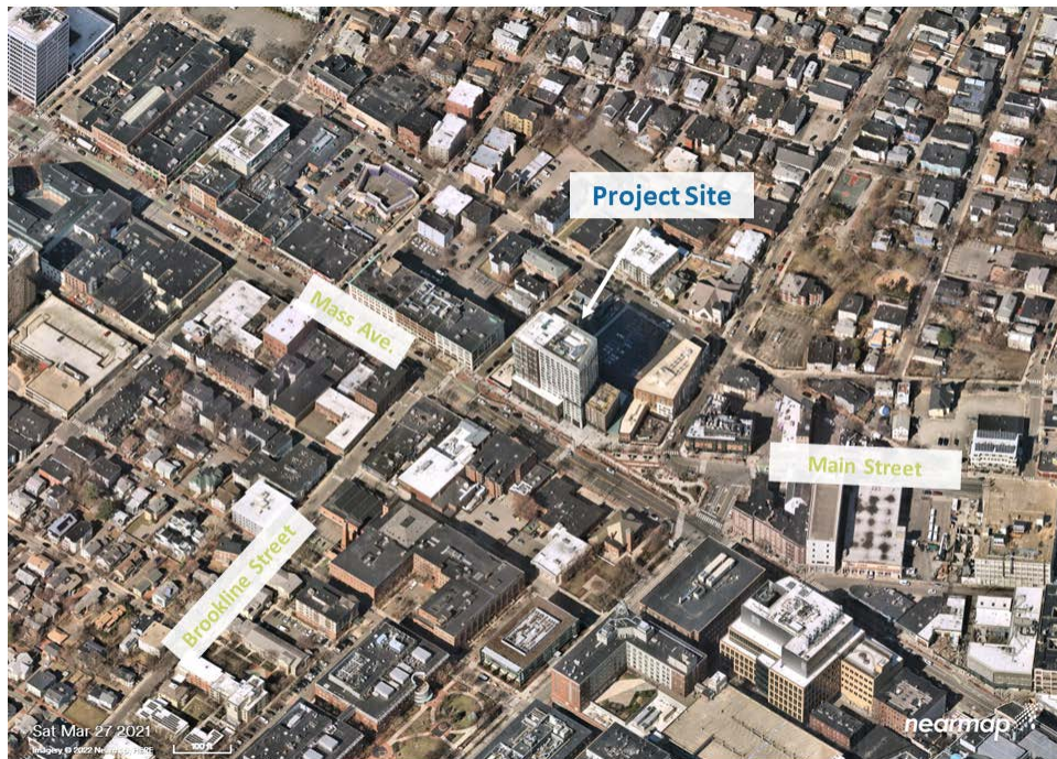
Site context for 425 Massachusetts Avenue.