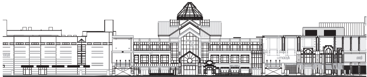
PROPOSED EXTERIOR TREATMENT