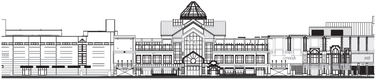
EXISTING EXTERIOR TREATMENT