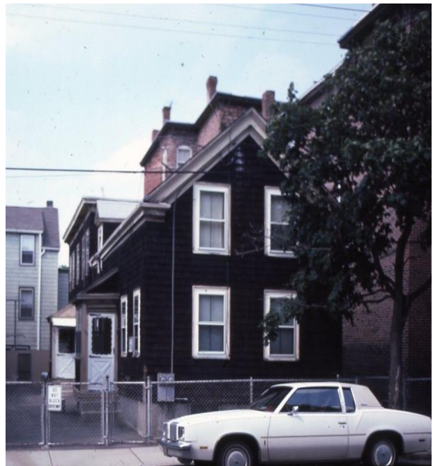
109 Gore Street in 1970 (top) and 1984 (bottom).

The proposed project calls for a complete demolition of the 1845 house, later ell and foundation. The replacement structure calls for a two-story, two-family structure with a side driveway.