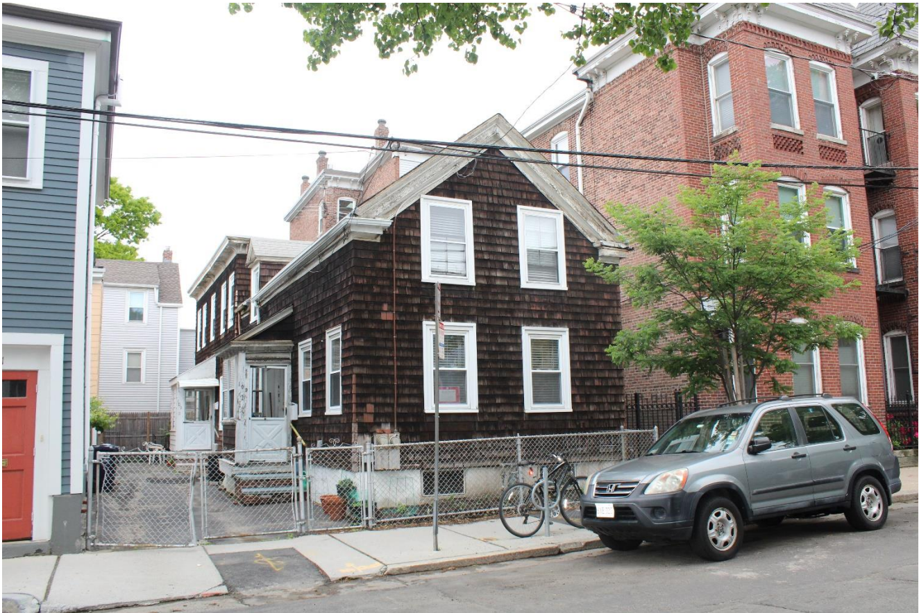
Staff photo of 109 Gore Street with 105-107 Gore Street (right) and 111 Gore Street (left). Photo taken 05/2019.

The neighboring properties on Gore and Fifth streets are a variety in age, style and form. The adjacent property to the east, the three-story brick building at 105-107 Gore Street (Hotel Richardson), was constructed in 1889 and is an example of a Victorian Gothic apartment/tenement house built for workers in East Cambridge. To the west, the properties at 111 Gore Street and 16 Fifth Street are two-story dwellings with flat roofs constructed in 1868. Across Gore Street, a two-story Post-War former social hall (108 Gore St., 1949) and a three-story brick double-house (110-112 Gore St., 1873) showcase the series of development and change in East Cambridge.