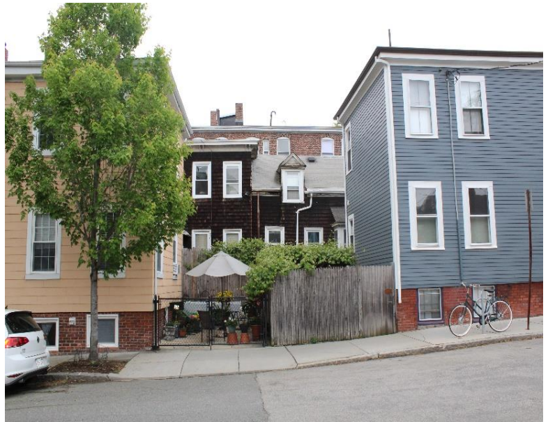
109 Gore Street, down driveway to rear ell (left) and view of property between 111 Gore Street and 16 Fifth Street (right).