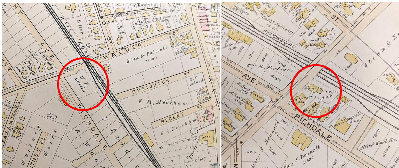
56-58 Walden Street site in 1886 (left) and 1894

This section of North Cambridge was among the last to be developed for residential purposes. While Massachusetts Avenue was laid out in the earliest years of settlement as a highway from Newtowne to the western settlements of the colony, the shady, poorly drained north slope of Avon Hill remained undeveloped well after the Charlestown Branch Railroad was constructed past it in 1842. The slope was occupied in part by the stockyards and pastures associated with the cattle market behind Porter's Hotel, but construction of the railroad isolated the area until Walden Street was laid out in 1857. A few houses were constructed on Walden close to Massachusetts Avenue and Mt. Pleasant Street in the 1870s, but the lots along the railroad saw no activity until the 1890s, and then only for such industrial activities as Hews Pottery, a lumber yard, and, in the early 20 th century, the Hathaway Bakery.