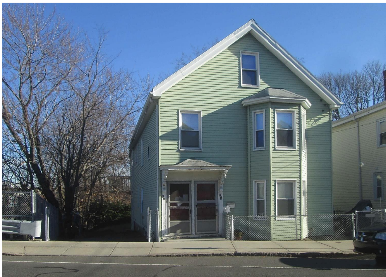
56-58 Walden Street