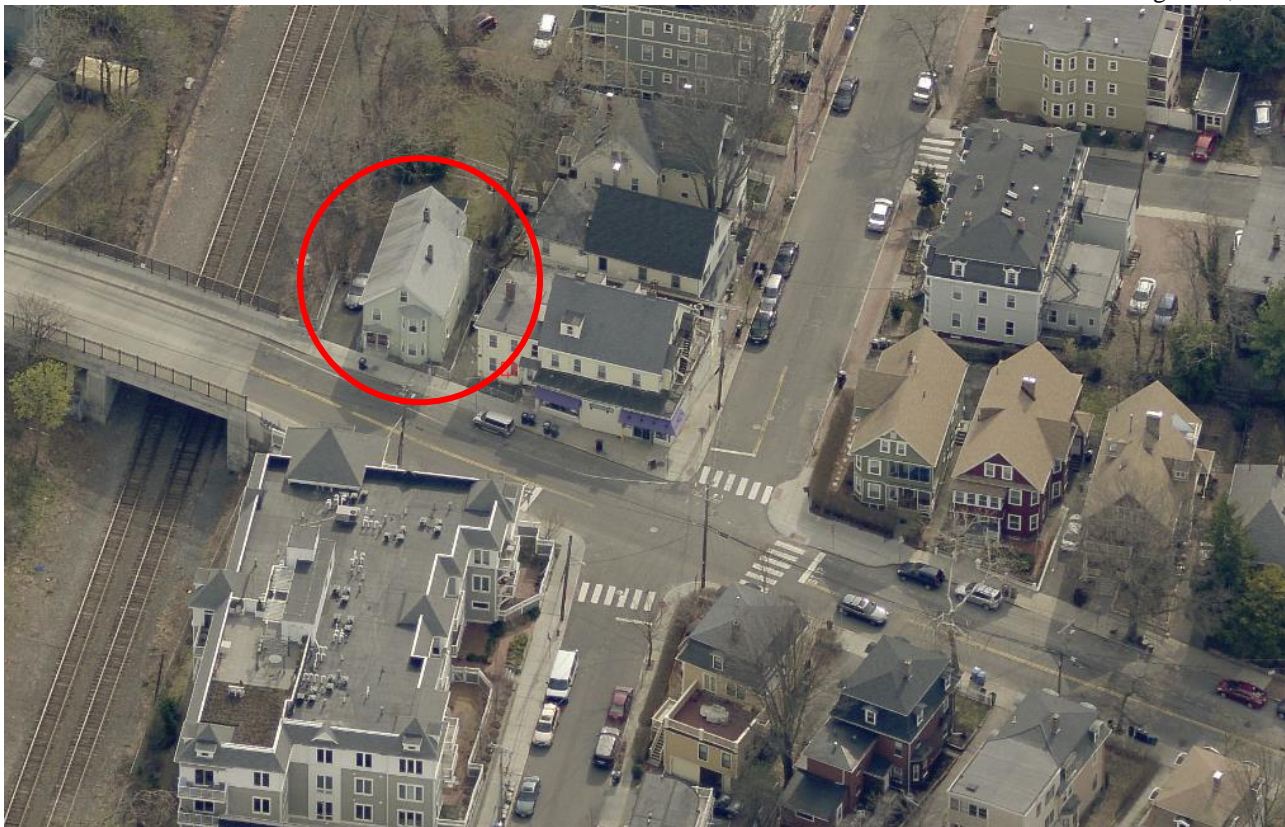
56-58 Walden Street as seen from the west