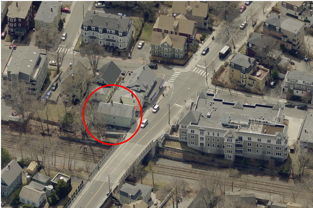
56-58 Walden Street as seen from the north