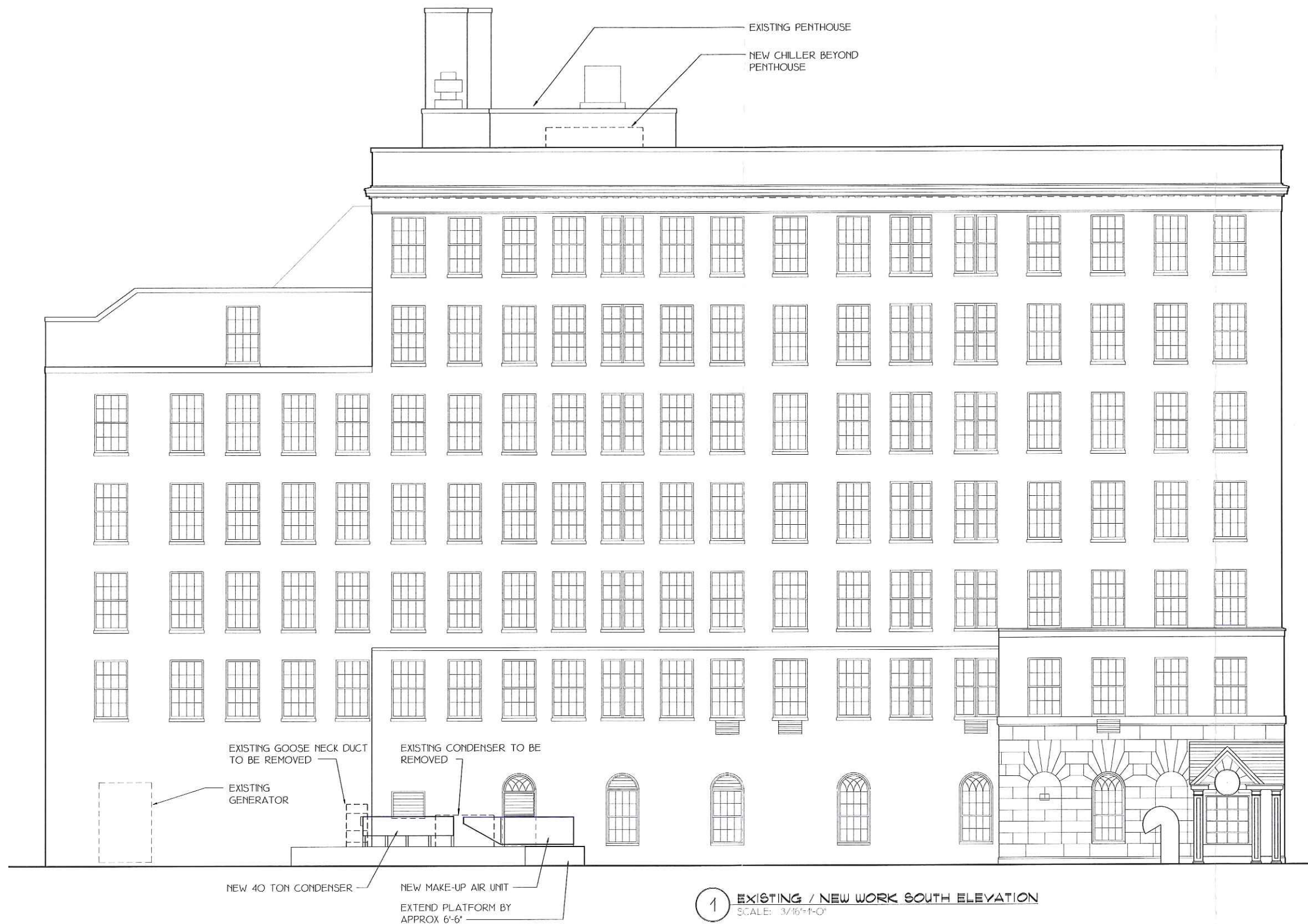
1 EXISTING / NEW WORK SOUTH ELEVATION SCALE: 3/16"=1'-0"

Project Name: MECHANICAL EQUIPMENT SHERATON COMMANDER HOTEL 16 GARDEN ST, CAMBRIDGE, MA