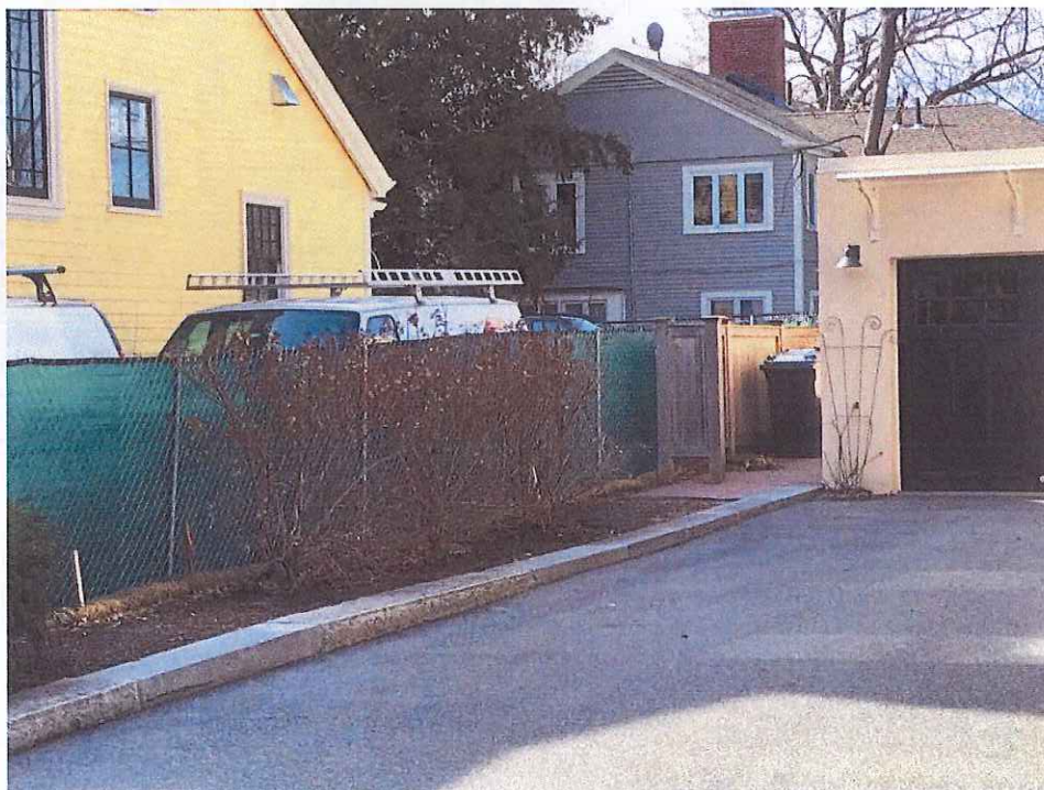
The proposed fence will extend 36 feet from the existing fence and will be 6 feet high. The material of the new fence will match the existing fence. Accompanying landscaping will include new hornbeam plantings adjacent to the fence and a new sugar maple tree near the front corner of the property.