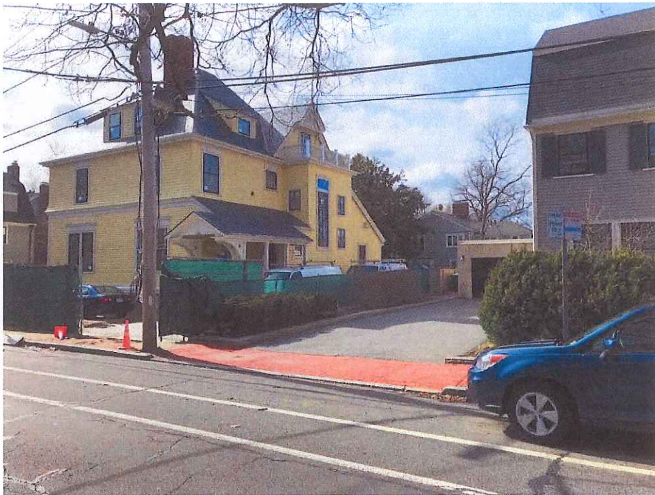
View of the site of the proposed fence in relation to 23 Hawthorn Street (left) and 15 Hawthorn Street (right).