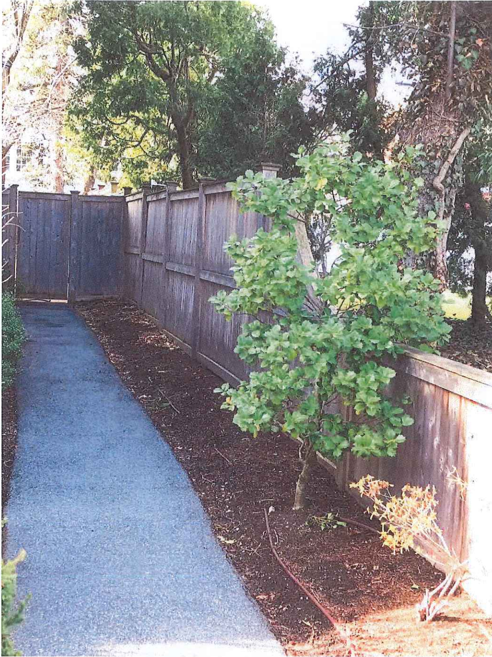
View of the existing fence from the opposite side yard.