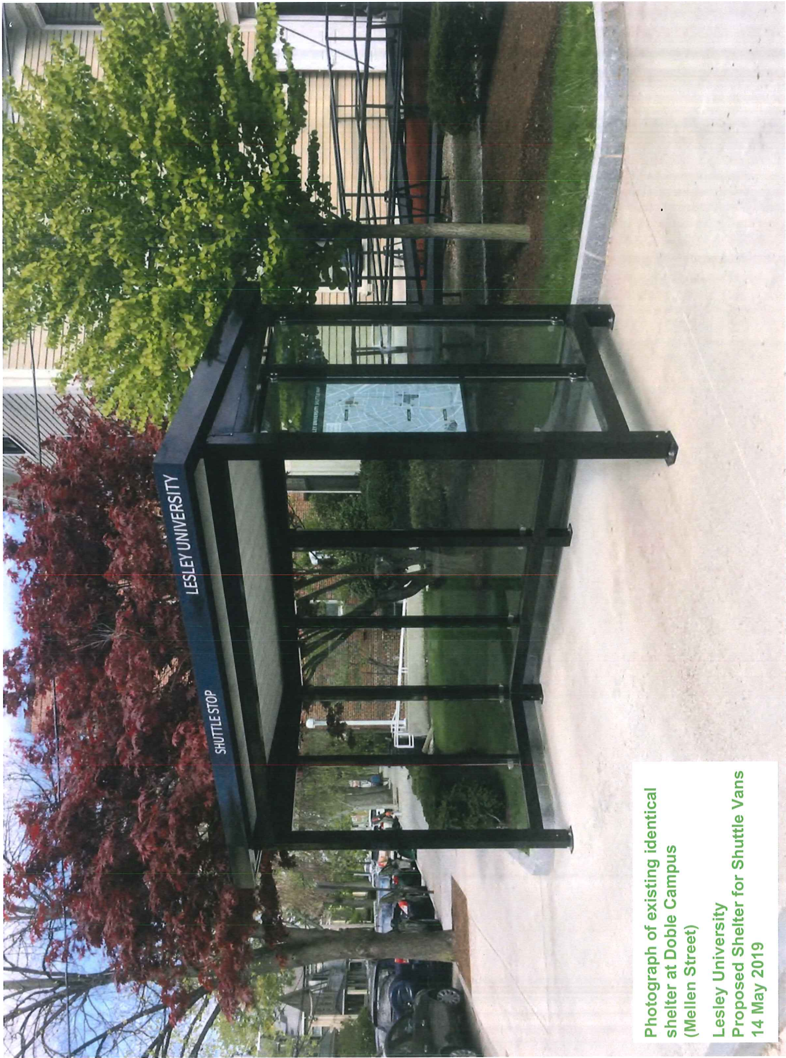
Photograph of existing identical shelter at Doble Campus (Mellen Street) Lesley University Proposed Shelter for Shuttle Vans 14 May 2019