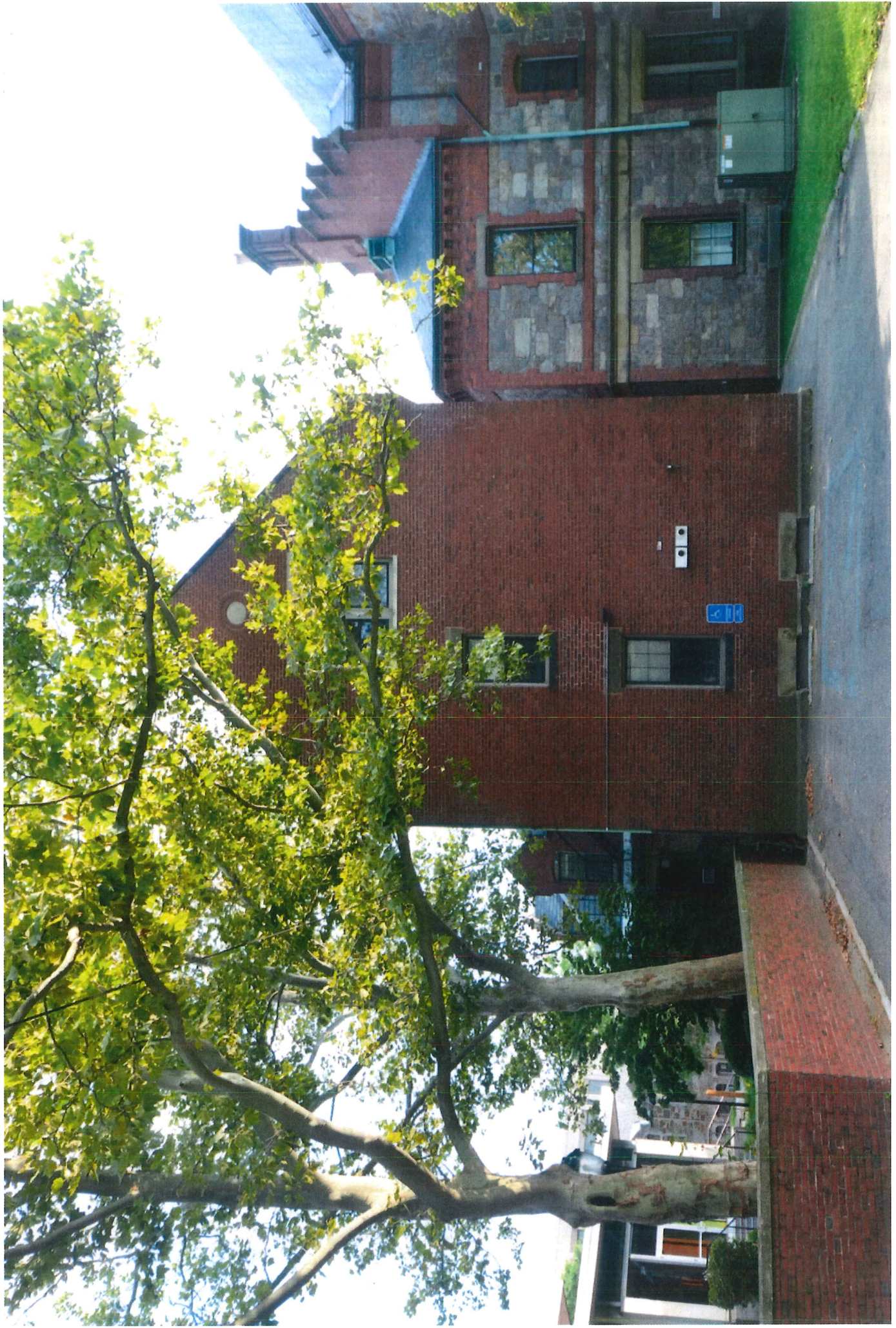
Lesley University Burnham Hall Existing North Elevation