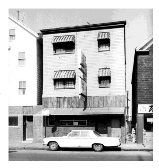
849-851 Cambridge St., 1965