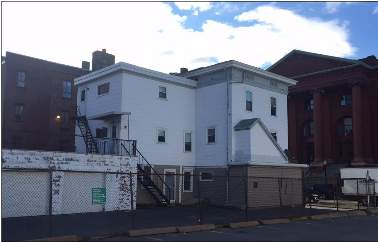
207 Cambridge Street rear and west side. 2016.