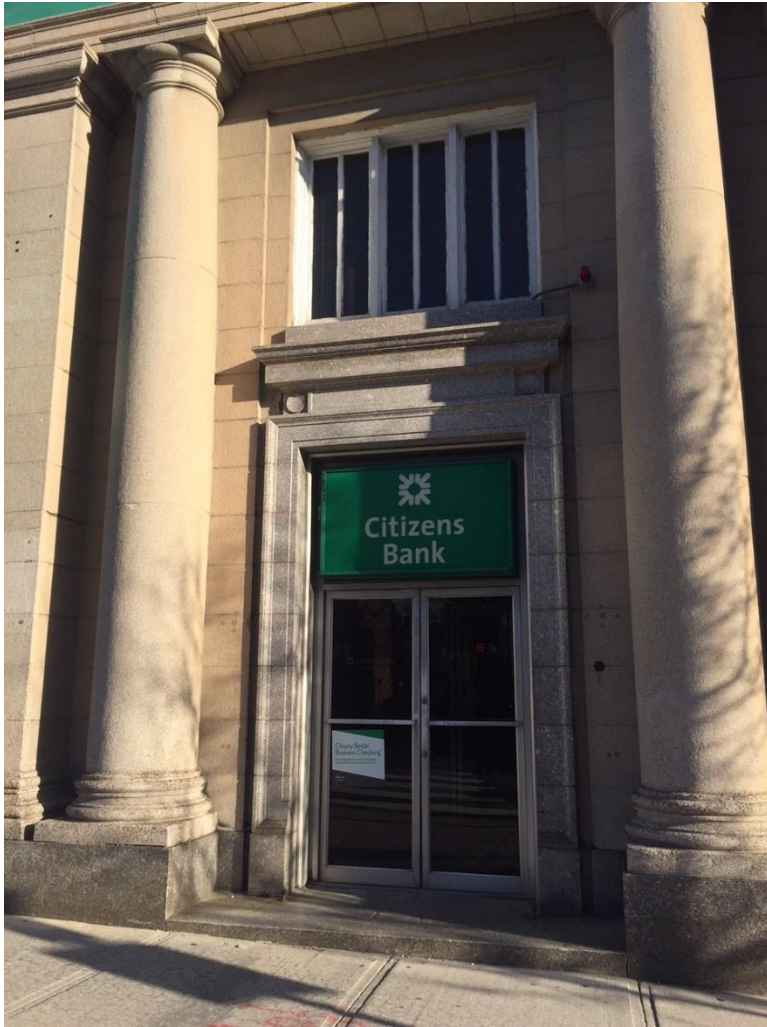
227 Cambridge St. entry on south front.