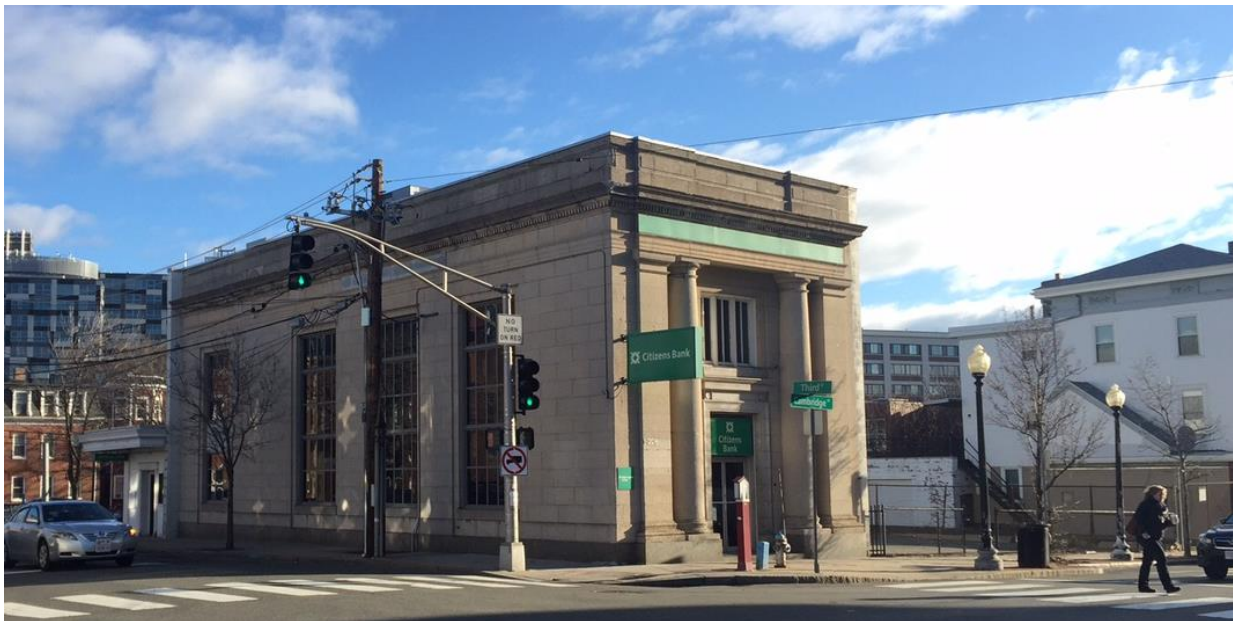
227 Cambridge Street, Lechmere National Bank (1917-18, by Thomas M. James, arch.) Most recently occupied by Citizens Bank.

The bank is in average condition but water damage is evident on the west side at the parapet and cornice. The cast stone, called composite granite in the contemporary newspaper descriptions, has weathered to show more of its aggregate than was probably evident when new.