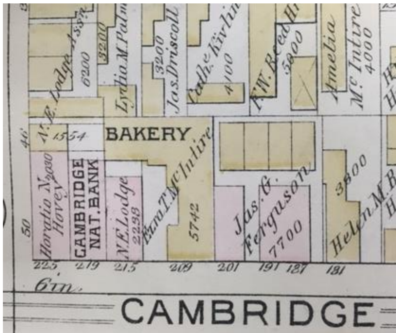
1873 Atlas detail showing bakery and residence at 209 Cambridge Street.

207 Cambridge Street was sided with asbestos shingles in 1943 and the eastern portion of the hipped roof was raised 1963 with zoning approval. The building is in average condition but its exterior character has been diluted by the white siding, replacement windows, and brick storefront. Because of the demolition of the buildings on either side it stands alone in a sea of pavement.