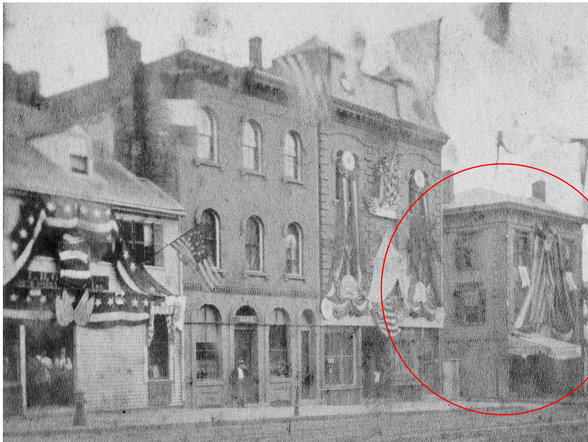
207 Cambridge St (circled), 217 Cambridge St., 221 Cambridge St., and 227 Cambridge St. (far left)