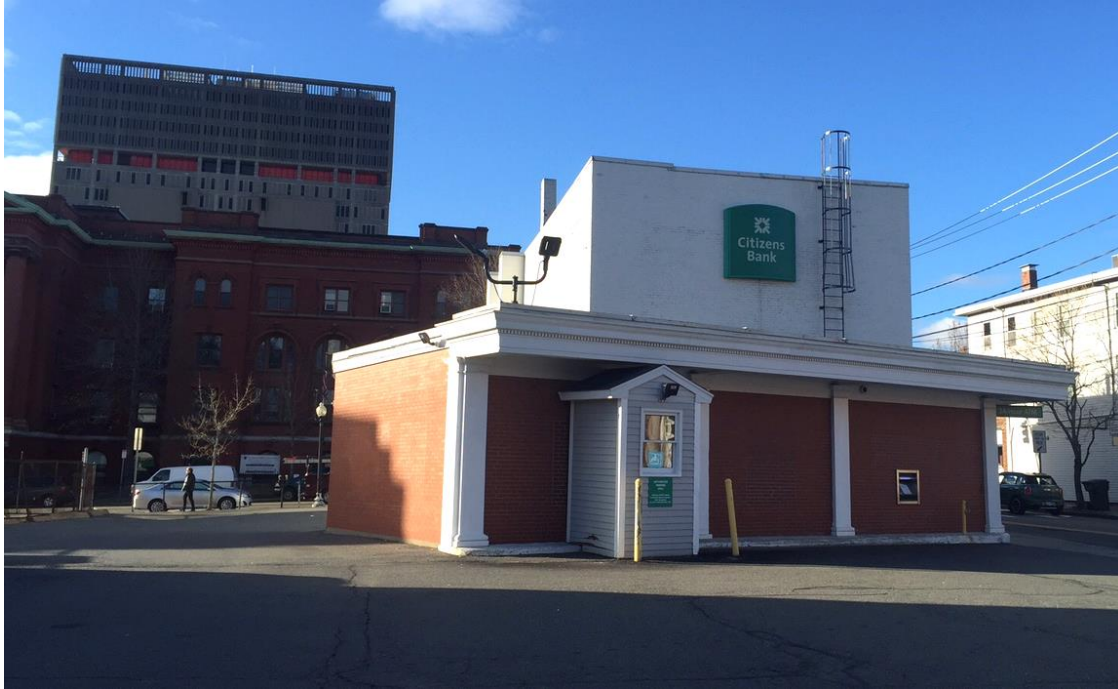
227 Cambridge St. north elevation from parking lot. Registry of Deeds and courthouse/jail in background.