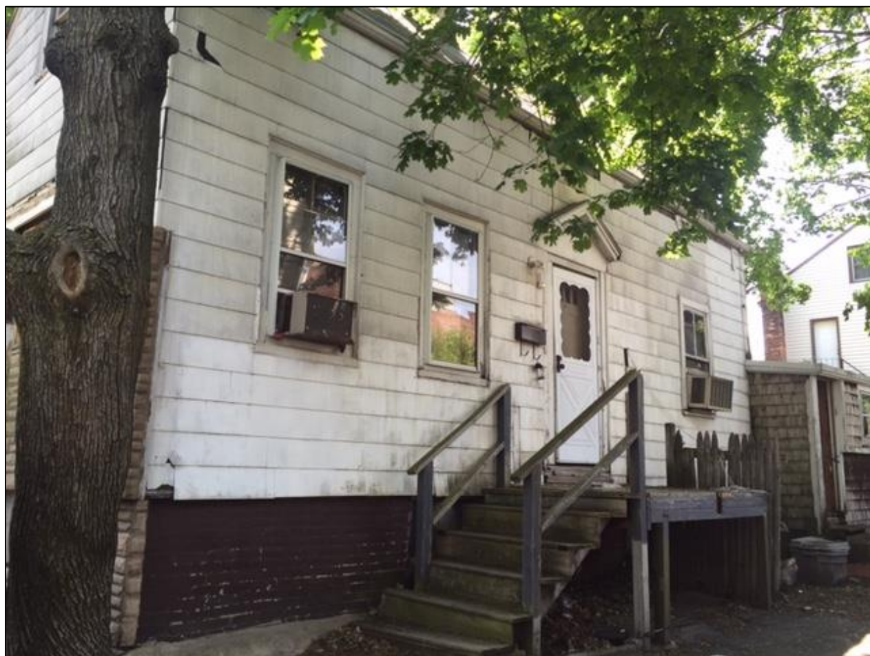
86 School Street, front (west) elevation with shingled 1-story shed addition visible at rear, 2016