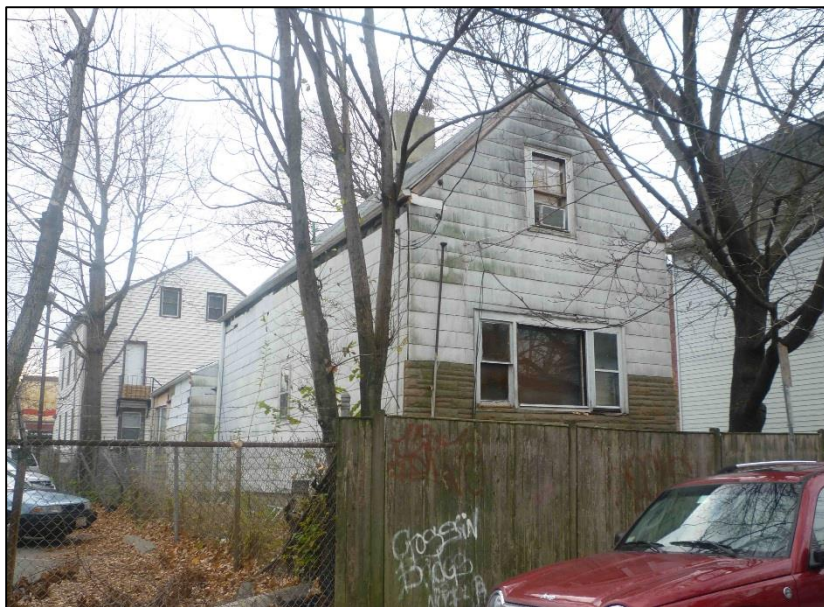
86 School St., 2016

The Binney house occupies a 1,995 square-foot lot (75/127) on the south side of School Street, opposite Pine Street. This small lot measures only 35' wide by 57' deep. The house is a 1 ½-story frame building with a front facing gable roof. The zoning is Residence C-1, a multi-family housing district that requires 1,500 square feet per dwelling unit. The FAR and height limits in this district are 0.75 and 35 feet. The assessed value of the land and building, according to the Assessors database, is $498,500 - $96,600 for the house, and $401,900 for the land. The property sold in August 2015 for $510,000.