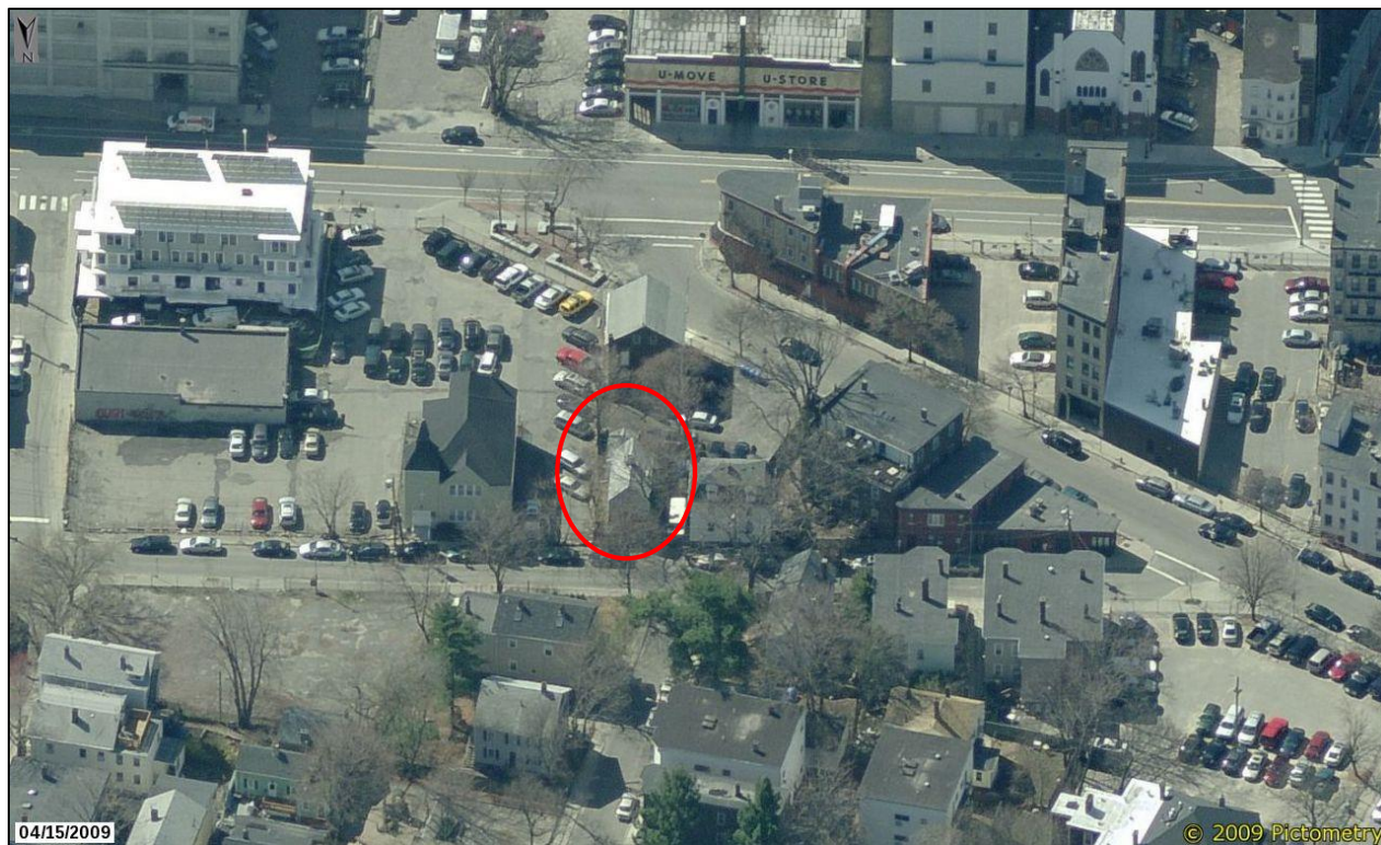
86 School Street and environs