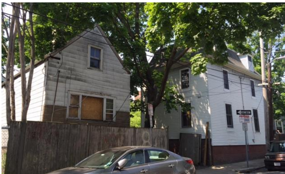
86 (left) and 88 (right) School Street, 2016