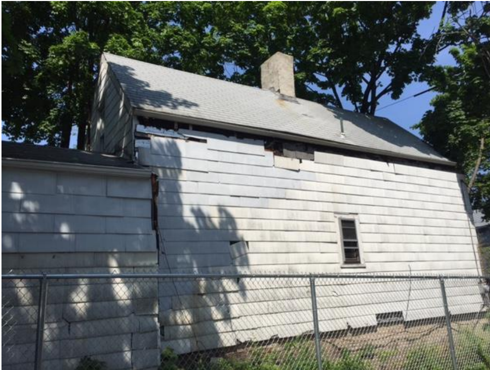
86 School Street, east (rear) side, 2016