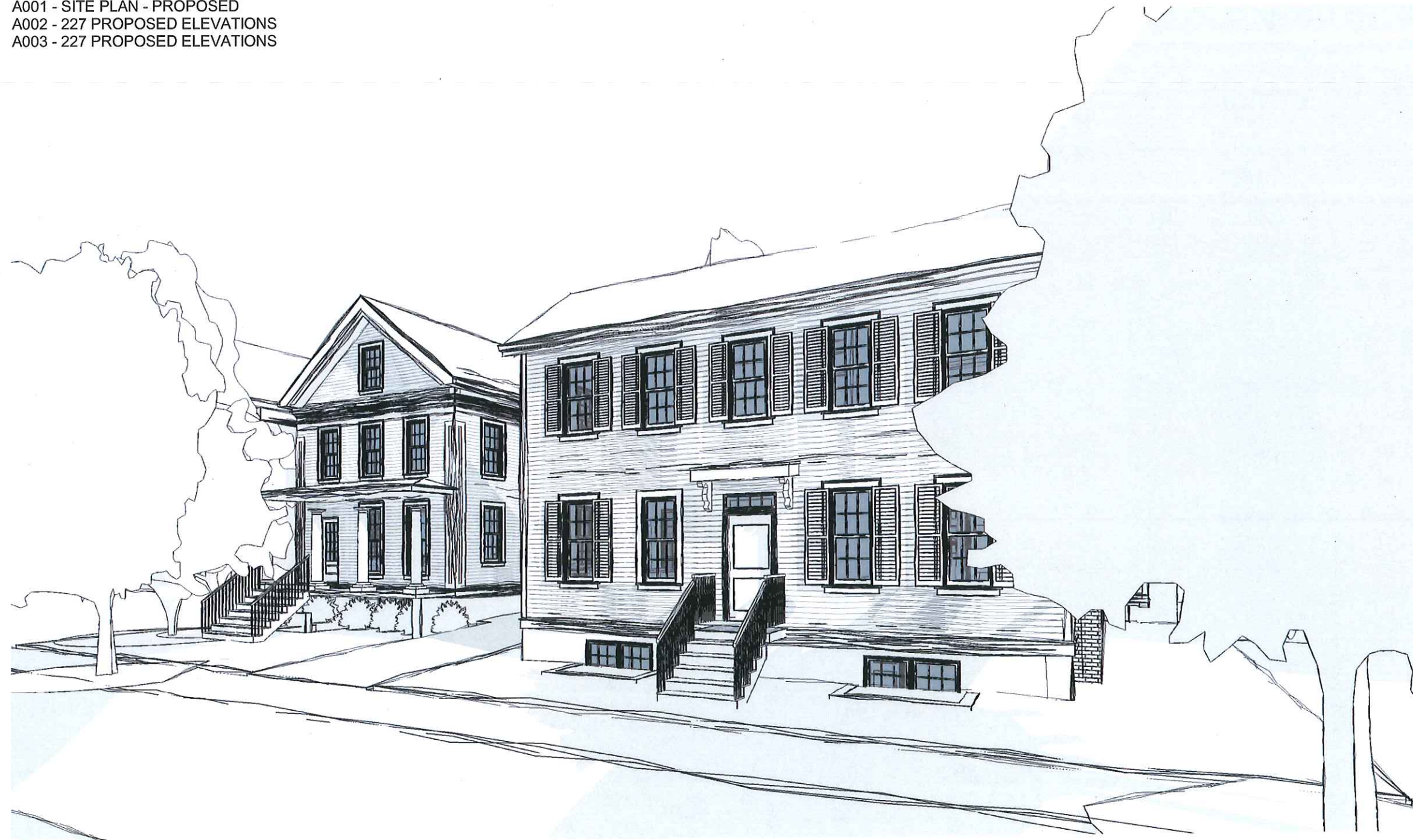
1 STREET PERSPECTIVE - LOOKING WEST

client 227 CONCORD NOMINEE TRUST CAMBRIDGE, MA