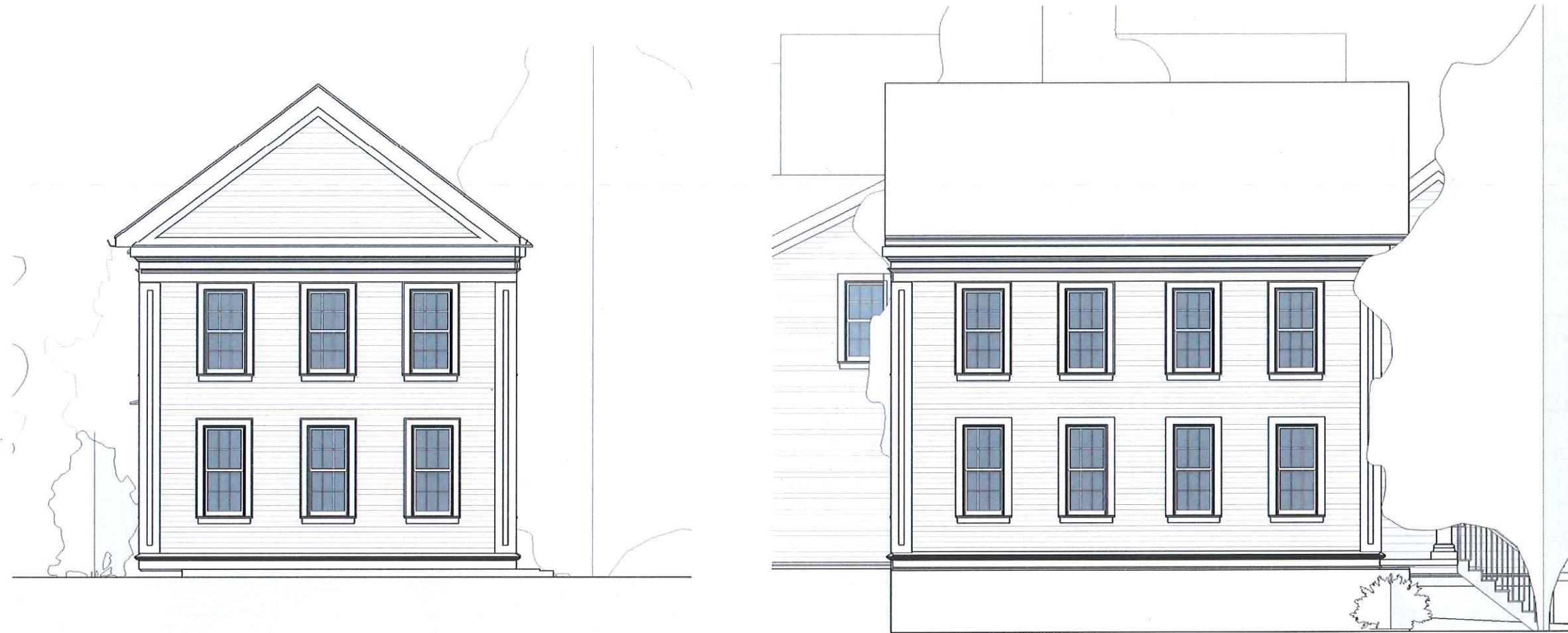
1 227 NORTH ELEVATION 1/8" = 1'-0"