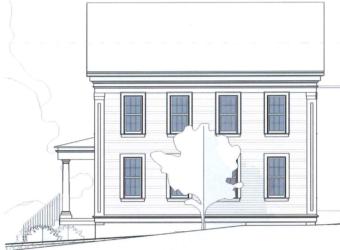
② 227 EAST ELEVATION 1/8" = 1'-0"