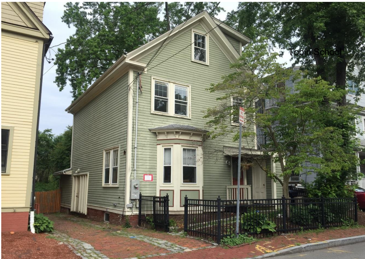
29 Bellis Circle, south and east elevations