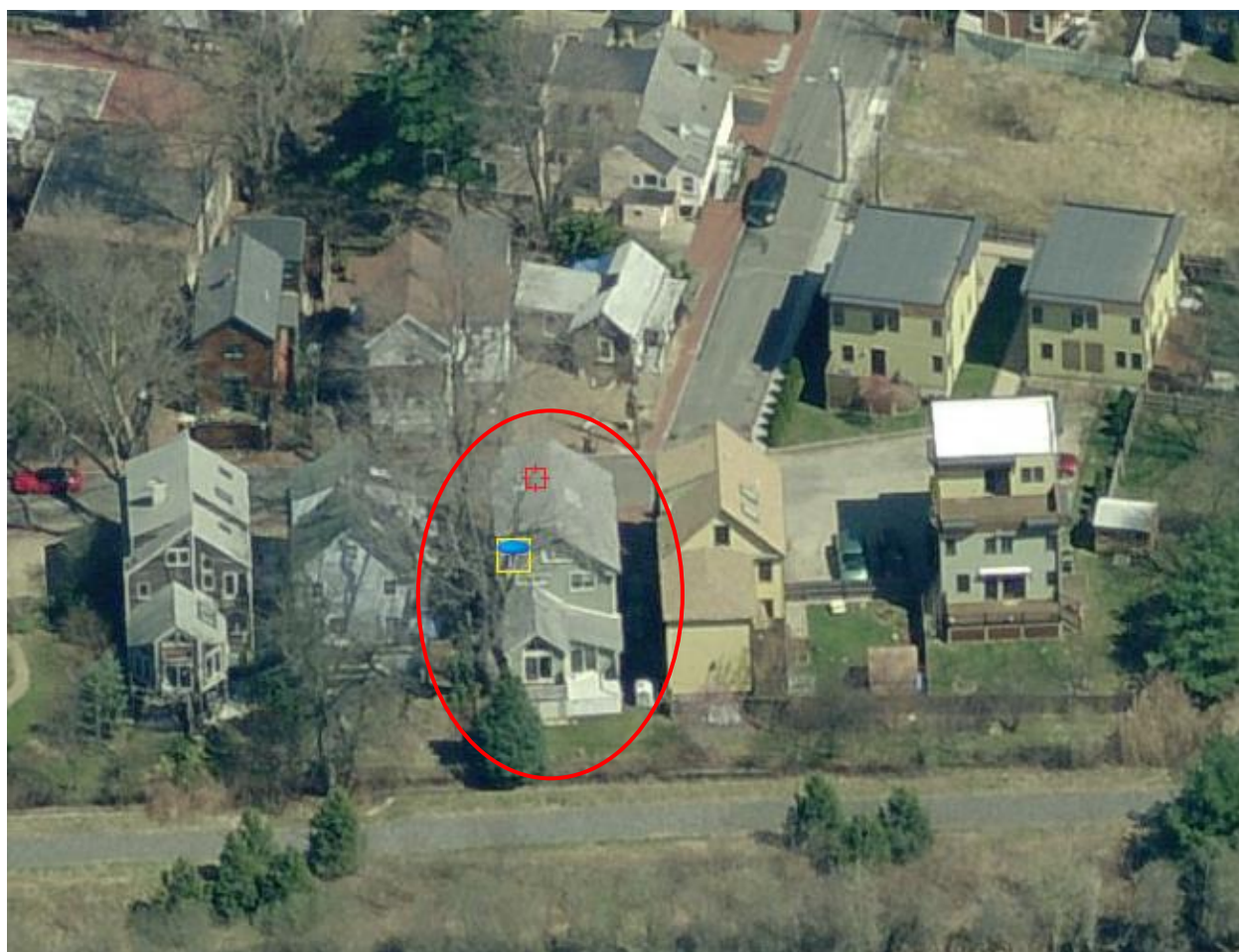
Aerial view of Bellis Cir.; west (rear) elevation of #29 circled. CONNECTExplorer image, downloaded June 2017