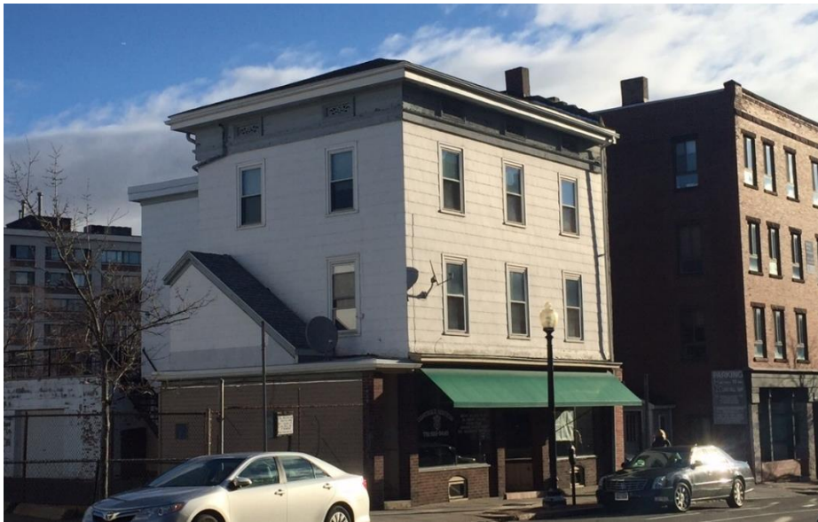
207 Cambridge Street front and west side. CHC staff photo, 2016.

This 3-story mixed use building sits directly opposite the Middlesex County South Registry of Deeds. It has a low hip roof, large frieze band, and wide eaves. The fenestration is divided into three symmetrical bays on the upper two floors and the ground floor is finished with a modern brick storefront. An enclosed stair tower was added along the west elevation. The main block of the building is 36' wide and 22' deep. At the rear is a 3-story ell measuring 20' square. The building is covered with asbestos shingle siding, but an 1875 stereopticon photo depicts the original Italianate detailing including quoins, flanking chimneys, shutters, window trim, and possibly window hoods. The masonry wall on the east side served as a fire wall for this building and the former building at 203 Cambridge Street (a 4-story brick commercial building built in 1889 and demolished 1976).