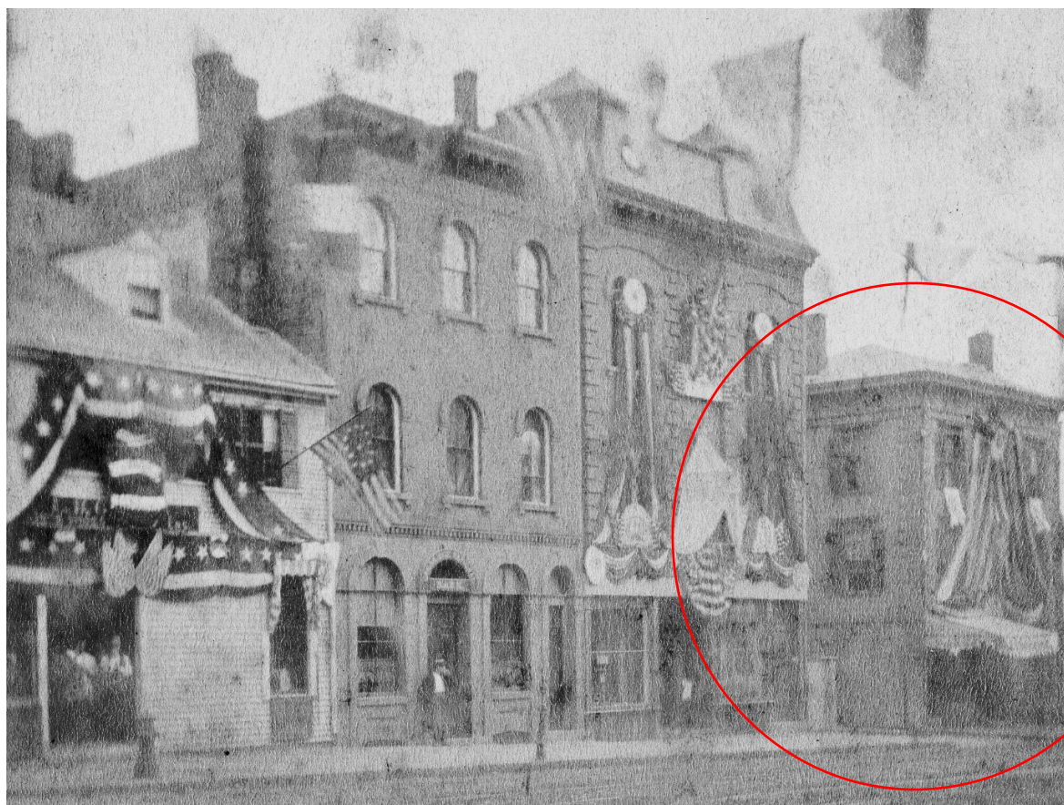
207 Cambridge St (circled), 217 Cambridge St., 221 Cambridge St., and 227 Cambridge St. (far left)