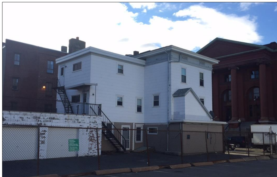
207 Cambridge Street rear and west side. 2016.