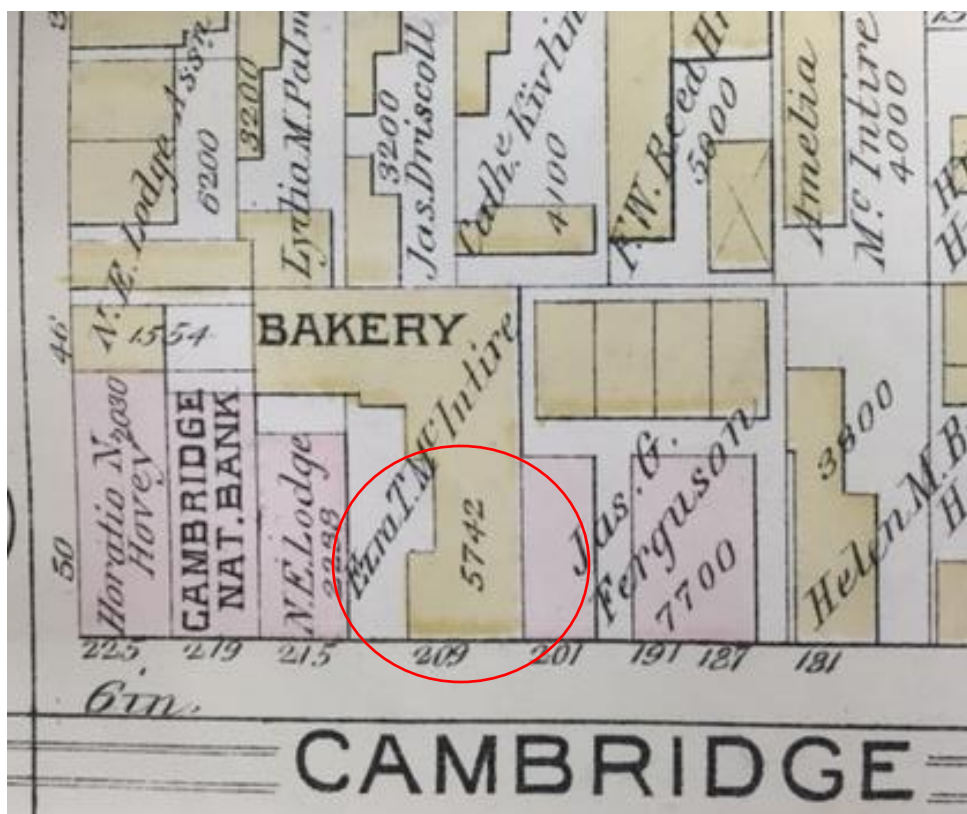
1873 Atlas detail showing bakery and residence at 209 Cambridge Street.