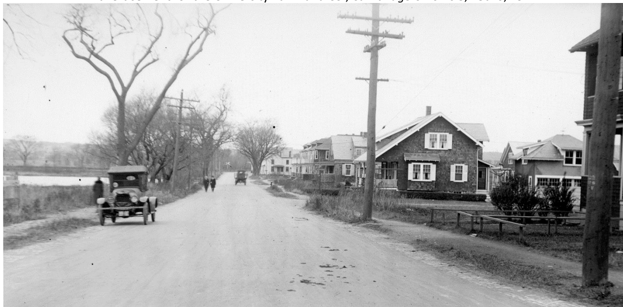
Concord Avenue at Chilton Street, looking west, in 1920. A clay pit can be seen in the distance on the left.