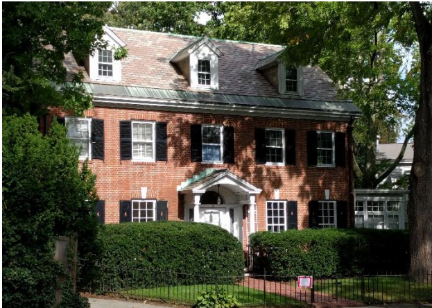
5 Fresh Pone Lane (1922)