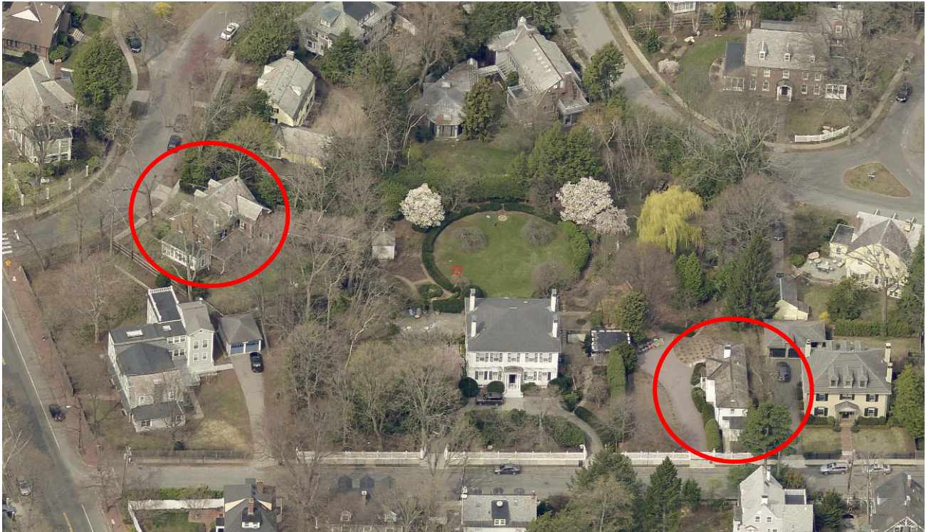
5 Fresh Pond Lane (circled, left) and 36 Larch Road (right)

vision is best demonstrated on Fresh Pond Parkway, where the houses are still desirable in spite of the constant high-speed traffic.