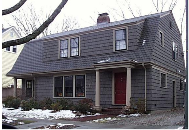
74 Larchwood Drive (1923)