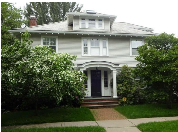
28 Meadow Way (1920; BP #20387)

Whitten’s four other commissions in Larchwood provide a context for evaluating the significance of 5 Fresh Pond Lane. Three of them – 28 Meadow Way, 43 Larchwood Drive, and 74 Fresh Pond Parkway – were built on spec for the Fresh Pond Parkway Realty Co.; all three were valued at $15,000. They were issued consecutively numbered building permits, meaning that all three had been on the boards in Whitten’s office at the same time.