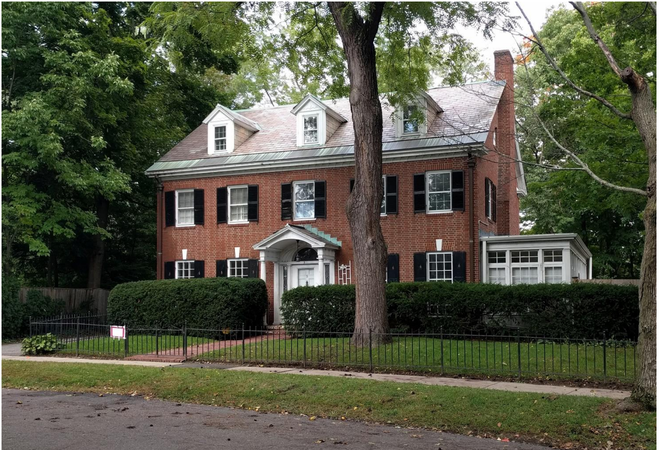
5 Fresh Pond Lane. Photo 2018

The house at 5 Fresh Pond Lane was built in 1922 for Sophia P. Moshier. It is a 2½-story red brick house with a slate roof designed in the Georgian Revival Style by Boston architect Roscoe B. Whitten. The five-bay design features a center entrance with a delicately-detailed portico. The trumpet-supported cornice, the wood frame of the sunporch, the three dormers, the keystones of the flat arches, and the trim are painted white, in contrast with the rare and distinctive Monk Bond pattern of the brick masonry. 2 The windows have what appears to be the original 6+6 sash, while the shutters on the first floor exhibit a pine tree cutout. The front door is flanked by leaded glass sidelights and a fanlight, while the portico is supported by slender Doric columns. All these features appear to be original and in good condition, if somewhat in need of paint. The brick two-car garage was built at the same time as the house.