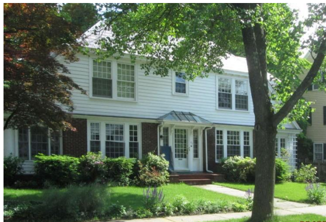
43 Larchwood Drive (1920; BP #20388)