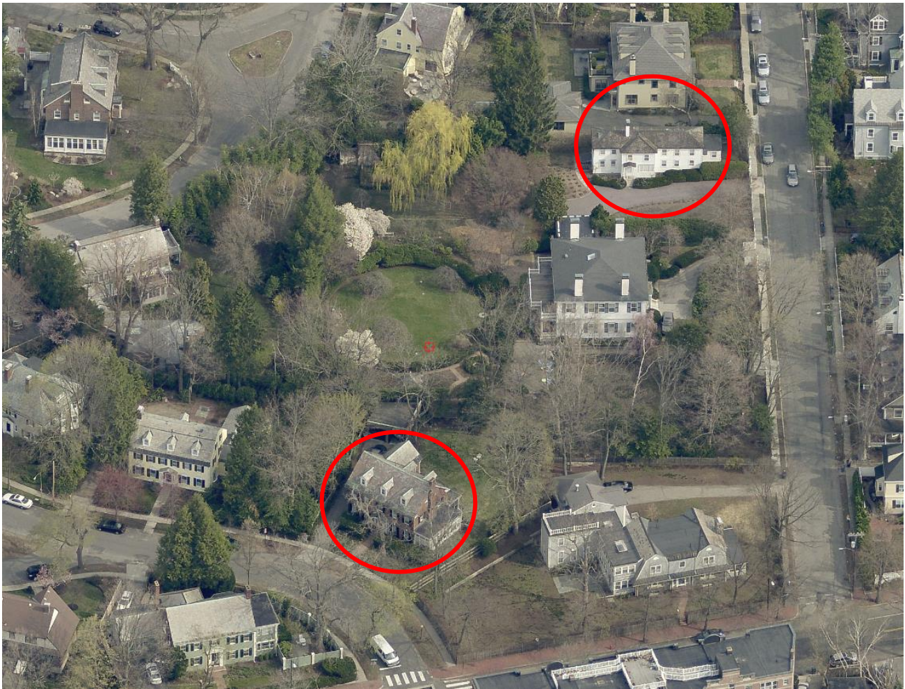
5 Fresh Pond Lane (circled, bottom) and 36 Larch Road (top)