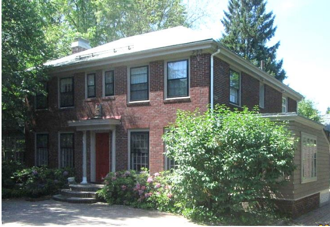
74 Fresh Pond Parkway (1920; BP #20389)