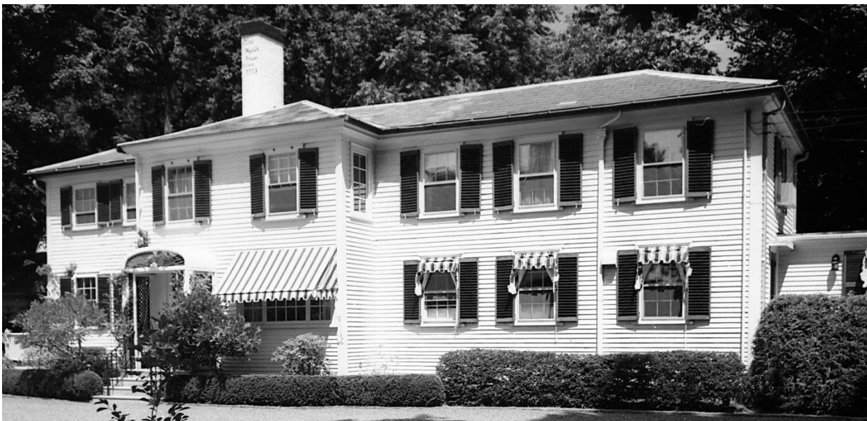
36 Larch Road. Photo 1969.