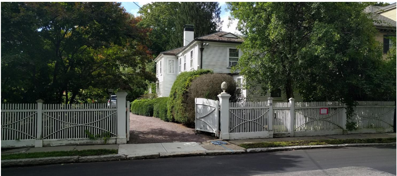
36 Larch Road. Photo 2018.

The house at 36 Larch Road is a two-story frame structure with a hip roof built in 1751 and altered many times since. The footprint of the original part of the house measures 38' long and 16' deep. A hip-roofed cross gable added in 1934 contains the entrance, while a one-story addition of 1960 is attached to the east and north elevations. The fenestration pattern is irregular; windows have 6+6 sash throughout, except for the picture window by the front door.