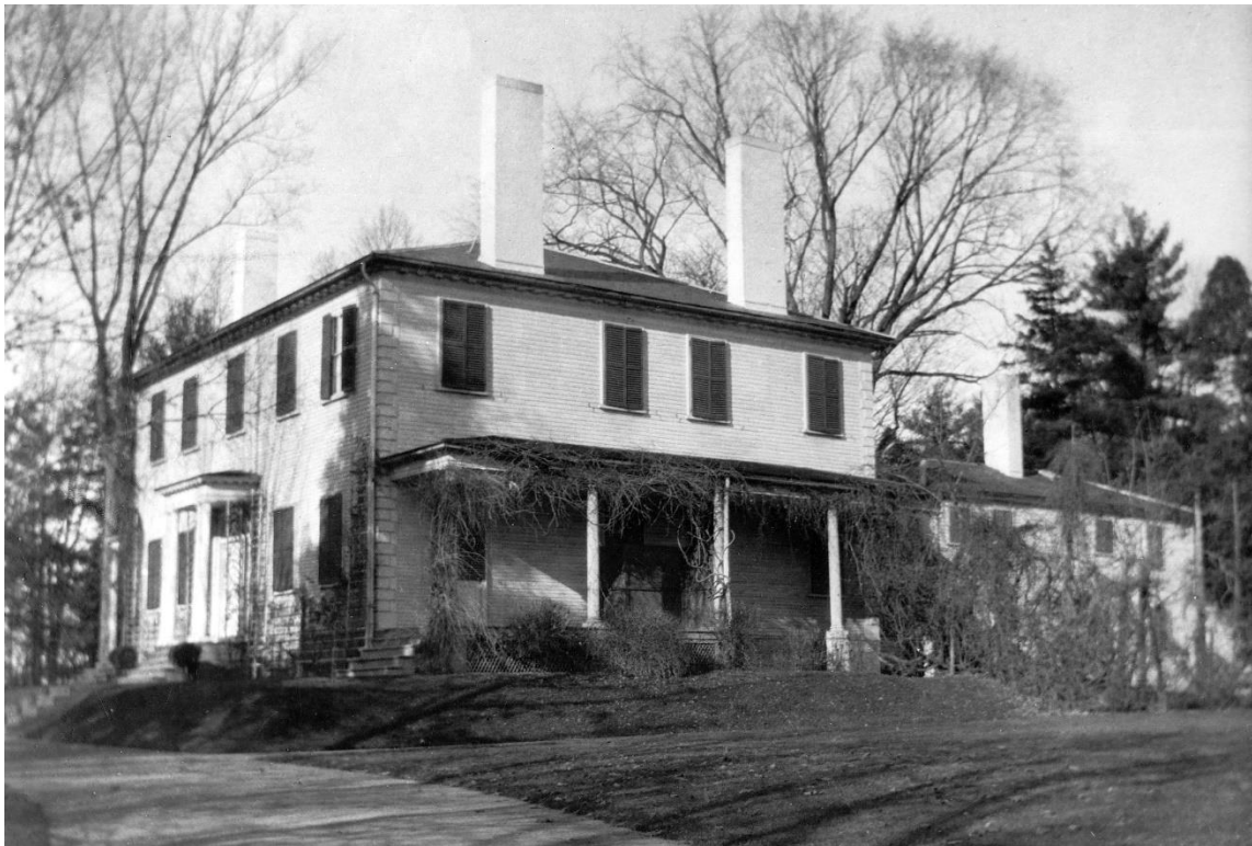
The Larches on its original site, with the Wyeth farmhouse attached at right.