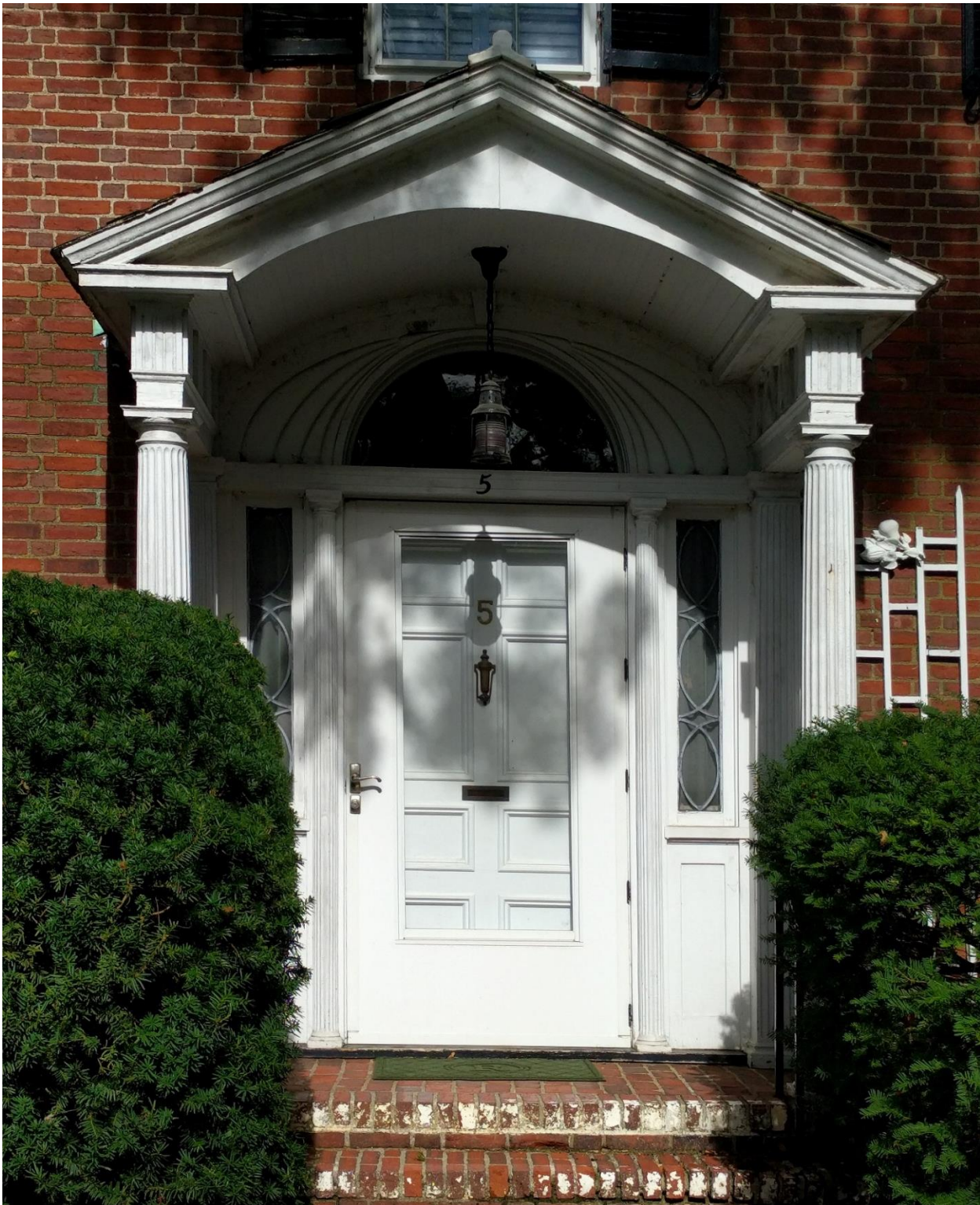
5 Fresh Pond Lane. Photo 2018.