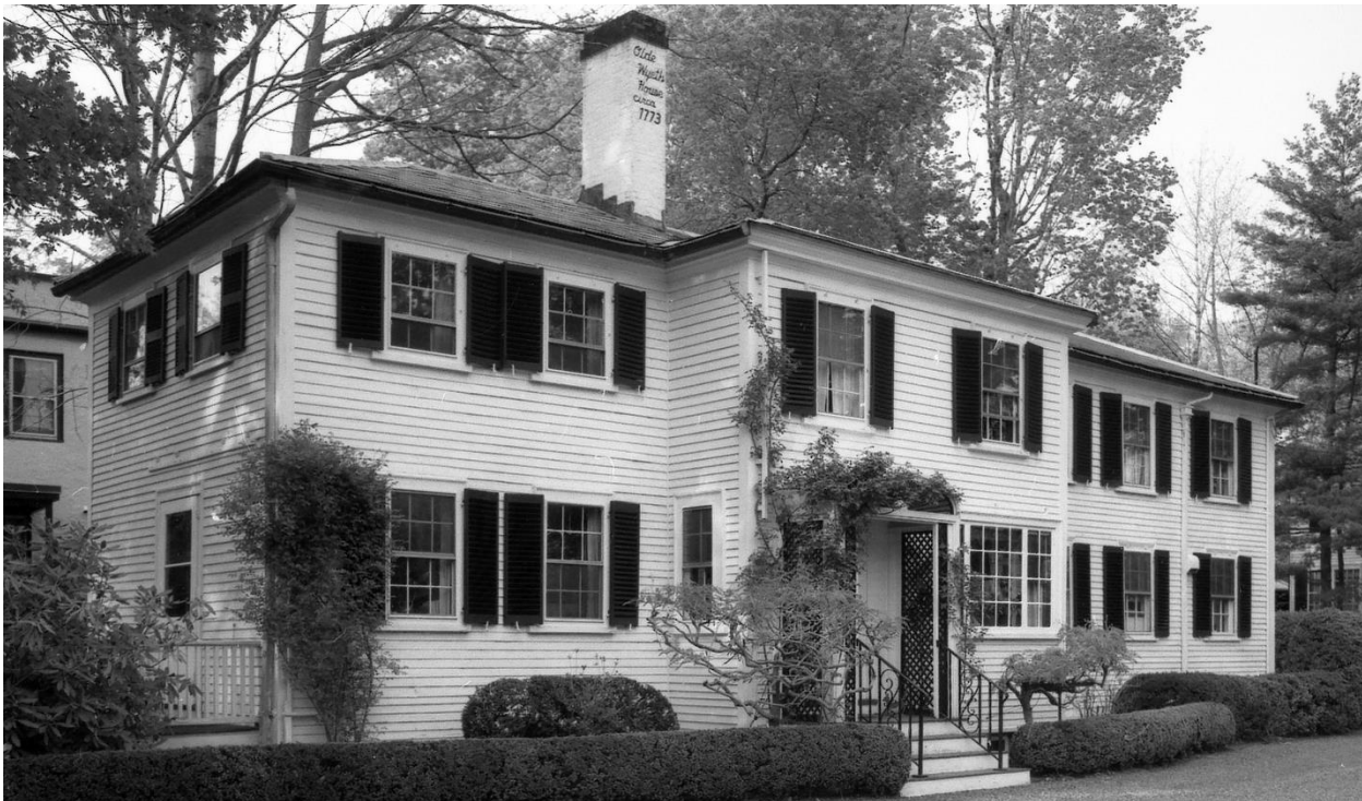
36 Larch Road. The west (left) elevation was once attached to "The Larches." Photo 1980.

Descriptions of the Wyeth farmhouse predating the move indicate that its south (now west) elevation was attached to the main house by a two-story connector about 12' long. As an ell, it contained the servant's rooms and two privies; the kitchen was in the cellar of the main house. The original central chimney was demolished during the move in 1915; Alexander Wadsworth Longfellow designed the renovation, which included a one-car garage addition to the east elevation.