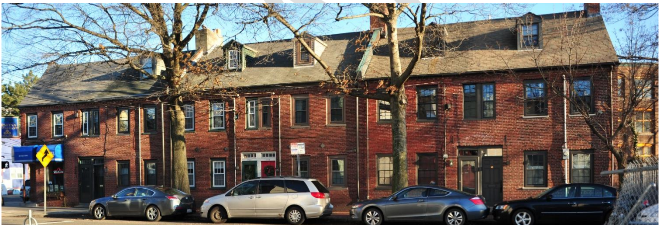
Bottle House Block, 204-214 Third Street (1827)

If adopted, the City Manager will appoint a commission comprised of East Cambridge residents and property owners to review applications for new construction, demolition, and alterations on properties within the district. Demolition and new construction would always be subject to review; decisions on alterations would be binding or non-binding based on the scope of work and whether the property is listed on the National Register of Historic Places (see map).