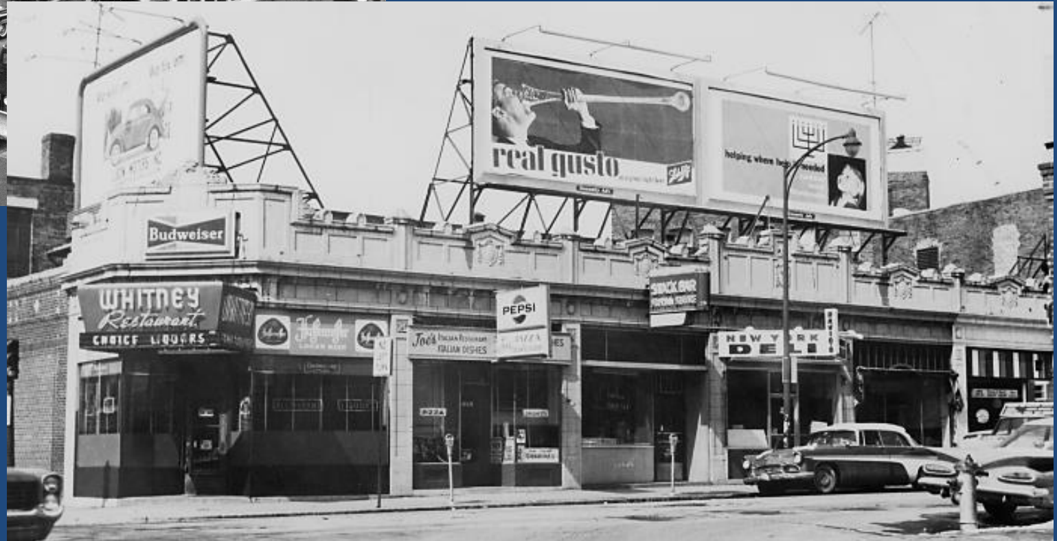
JFK Street ca. 1960