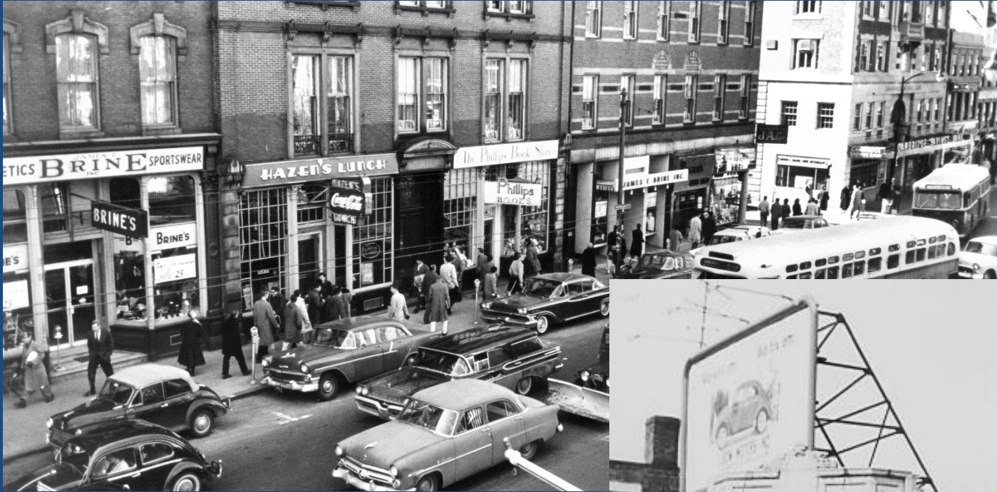
Mass. Ave. 1958