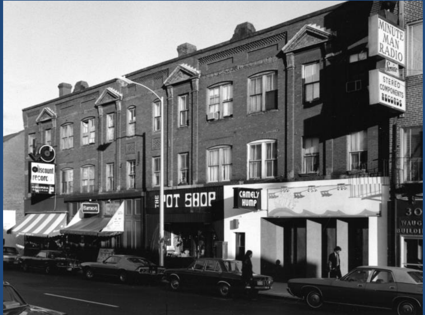
JFK Street in 1973