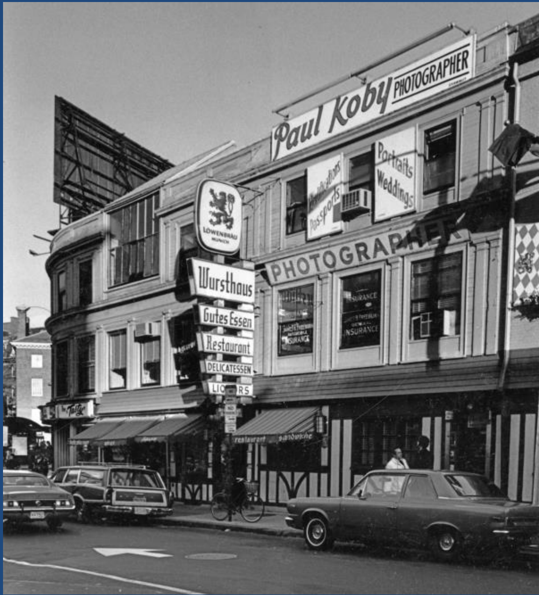
Read Block, JFK Street ca. 1968