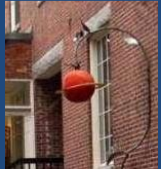
Veggie Planet's Tomato