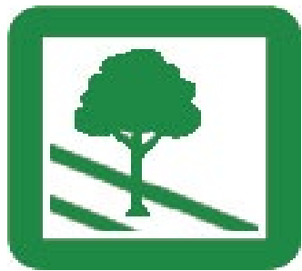
Flexi Pave [at trees]