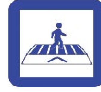
Raised Crosswalks [at side streets]