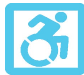
Curb Extensions & Ramps [for accessibility]