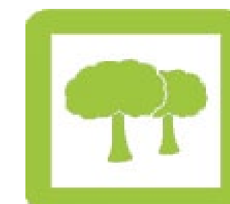
New Tree Plantings