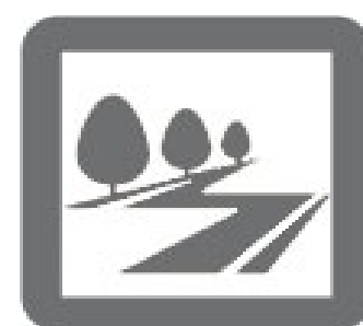
New Sidewalks [brick & concrete]