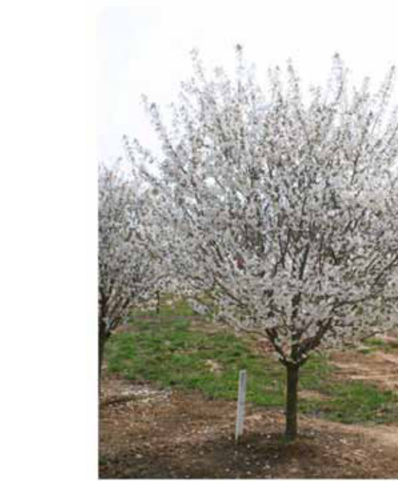
Snowgoose Cherry Prunus serrulata 'Snowgoose' PS Street Tree - Type II