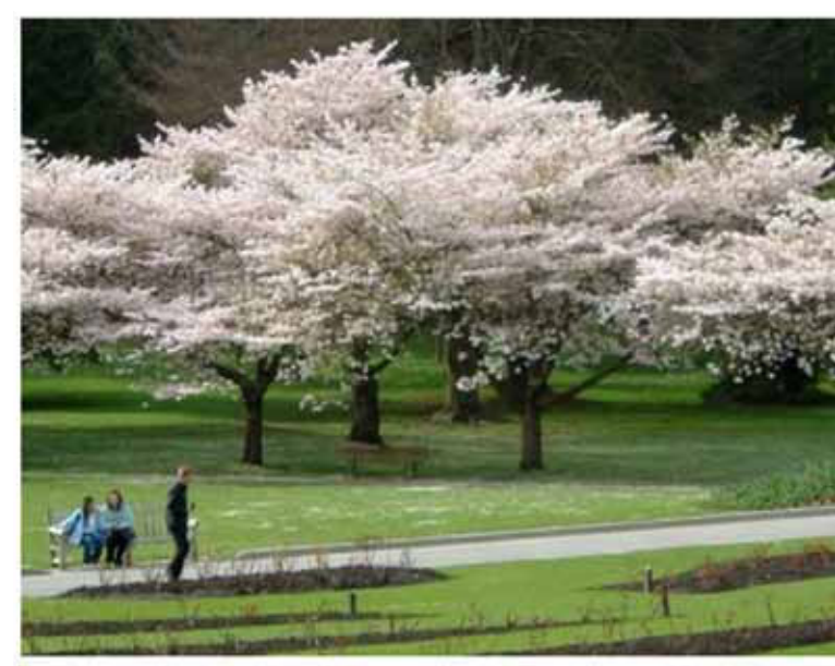
Akebono Cherry Prunus x yedoensis 'Akebono' PY Street Tree - Type II