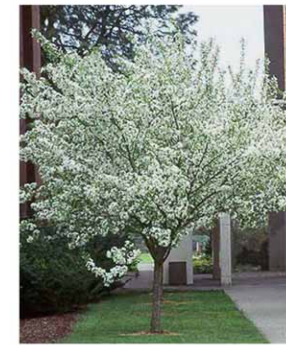
Snowdrift Crabapple Malus 'Snowdrift' MA Street Tree - Type II