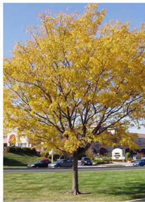
Honey Locust Gleditsia inaequalis GT Street Tree - Type I