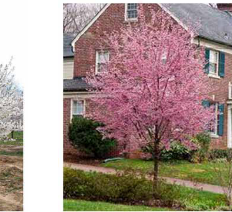
Okame Cherry Prunus x incam 'Okame' PX Street Tree - Type II