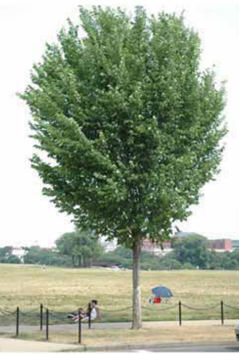
Valley Forge American Elm Ulmus americana 'Valley Forge' UA Street Tree - Type I