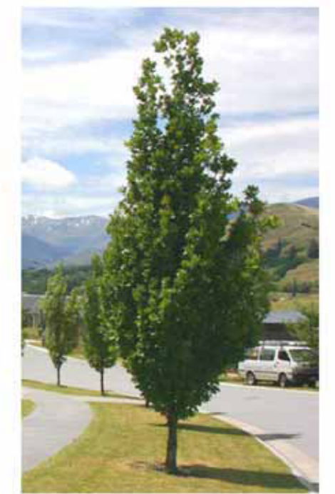
Columnar English Oak Quercus robur 'Fastigiata' QE Street Tree - Type I