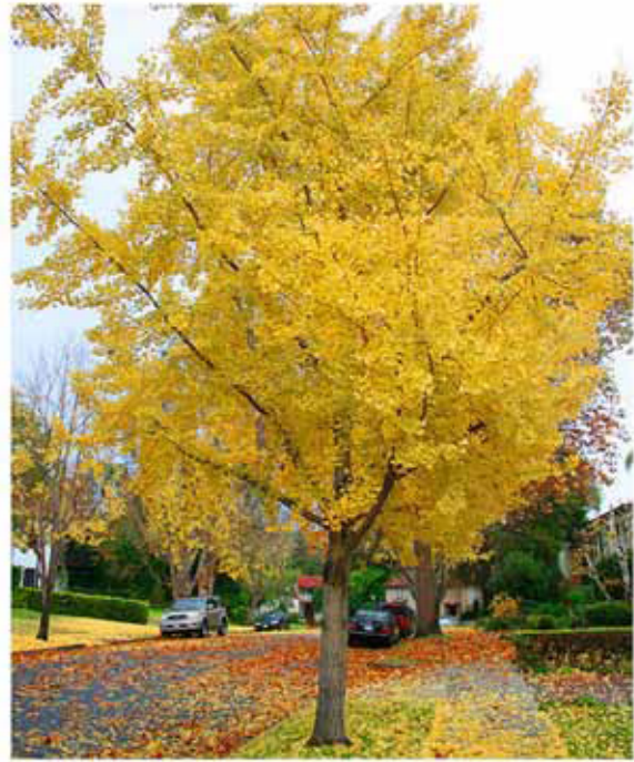
Ginkgo Ginkgo biloba GB Street Tree - Type I