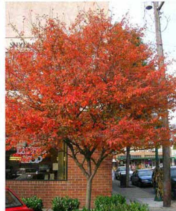
Downy Serviceberry Amelanchier arborea 'Autumn Brilliance' AA Street Tree - Type II

Ornamental trees; overhead utility wires present