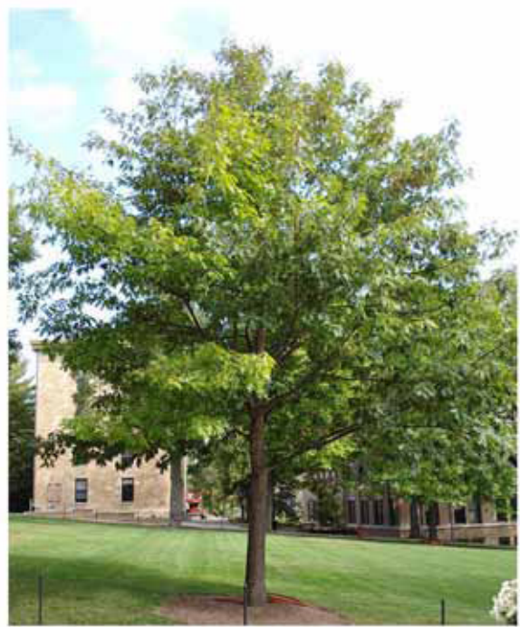
Red Oak Quercus rubra QR Street Tree - Type I