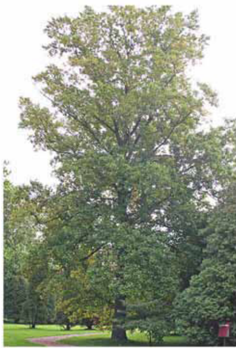
Tuliptree Liriodendron tulipifera LT Street Tree - Type I