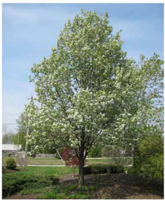
Pear Pyrus sp. PR Street Tree - Type I