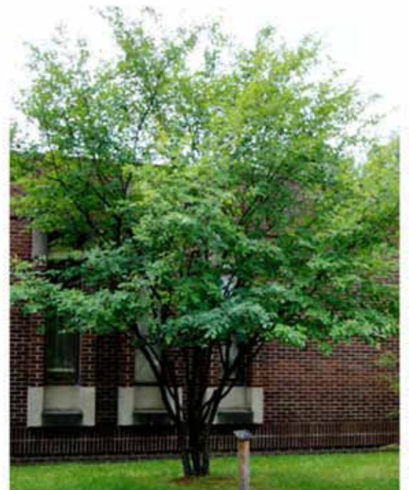
Apple Serviceberry Amelanchier grandifolia AG Street Tree - Type II