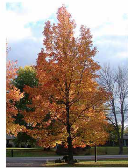
Sweetgum Liquidambar styraciflua LS Street Tree - Type I