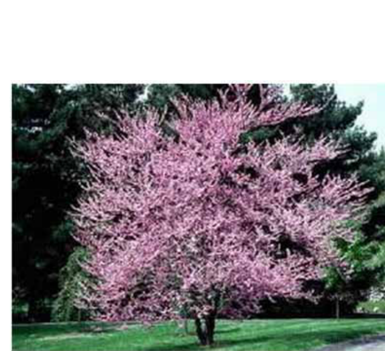
Eastern Redbud Cercis canadensis CC Street Tree - Type II