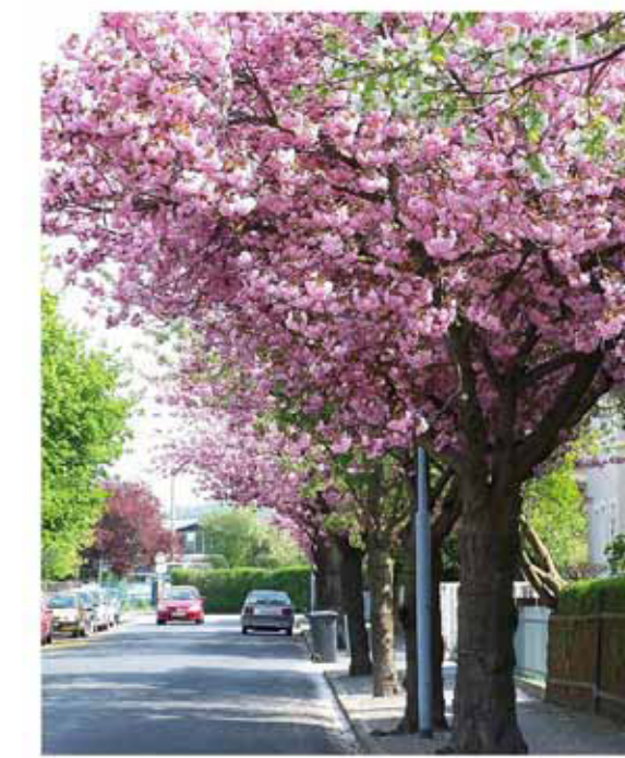
Kwanzan Cherry Prunus serrulata 'Kwanzan' PK Street Tree - Type II