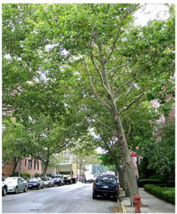
London Planetree Platanus x acerifolia PA Street Tree - Type I