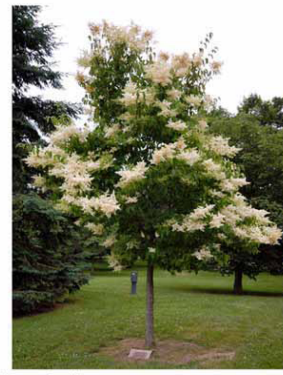
Japanese Tree Lilac Syringa reticulata SR Street Tree - Type II