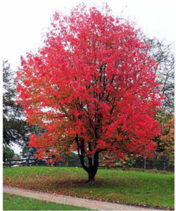
Red Maple Acer rubrum AR1 Street Tree - Type I

Shade trees; no overhead utility wires present