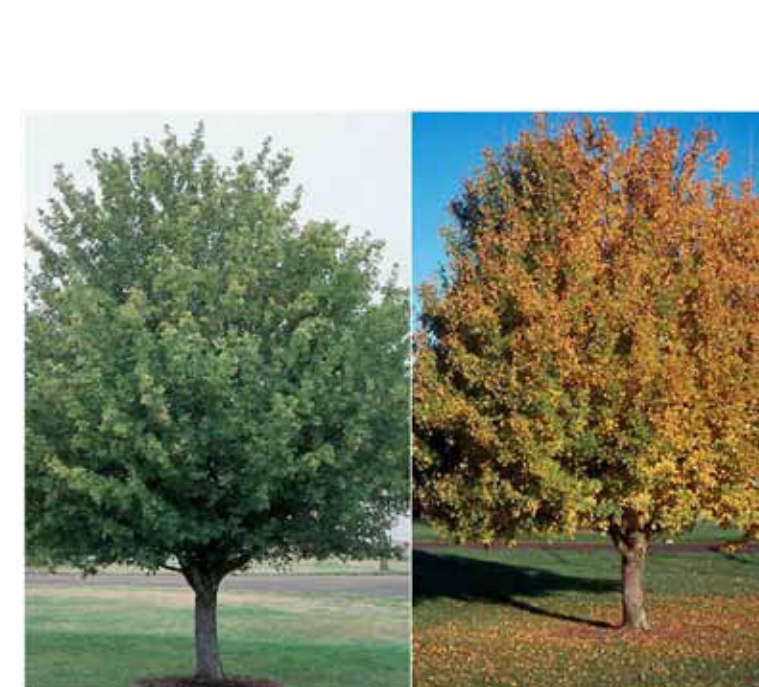
Hedge Maple Acer campestre AC Street Tree - Type II