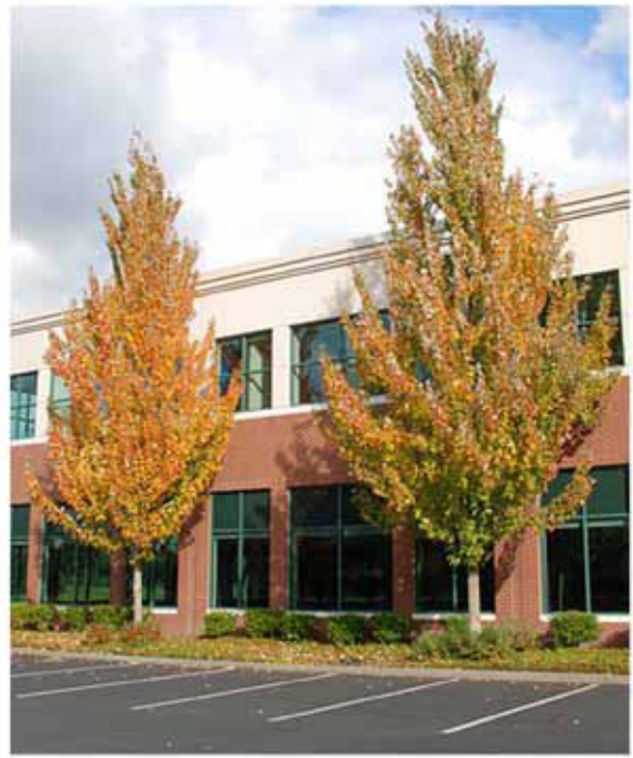
Armstrong Red Maple Acer rubrum 'Armstrong' AR2 Street Tree - Type I