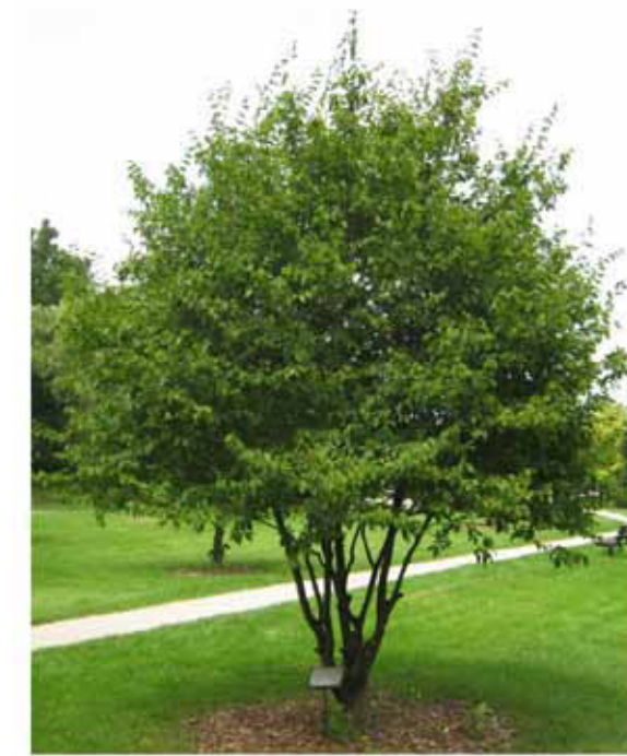
American Hornbeam Carpinus caroliniana CP Street Tree - Type II