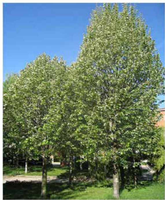
Silver Linden Tilia tomentosa TT Street Tree - Type I