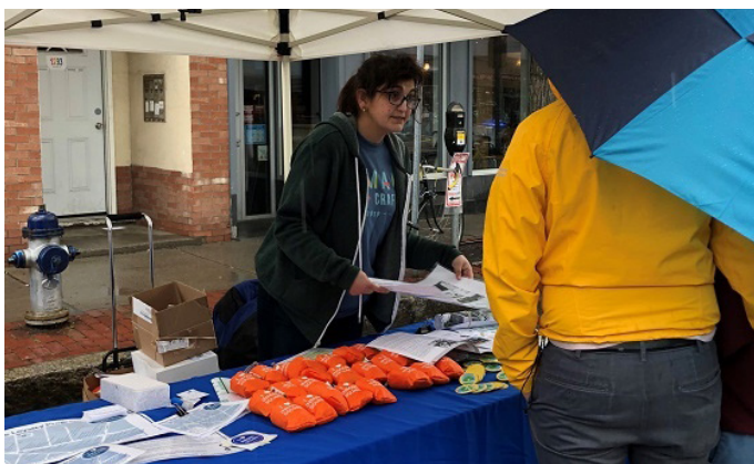
City Staff engage with the public at Inman Square Eats and Crafts in May 2019.

Updates and Notices: DPW is disseminating electronic and written communications throughout the duration of the project. These include periodic general “Updates” (such as this); and more specific “Notices” which alert the community to imminent operations in the field and related impacts to roadways, crosswalks, sidewalks, and parking. Updates and Notices are posted on the project website www.cambridgema.gov/theworks/inmansquare and are emailed to those on the Project contact list. Visit the website to be added to this contact list. In addition, hard-copies of Updates and Notices are distributed to residents and businesses as appropriate.