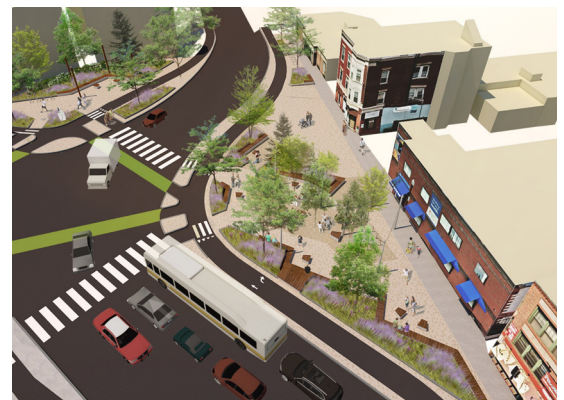
A "bird's-eye view" of Vellucci Plaza looking north to Hampshire Street after construction is complete.