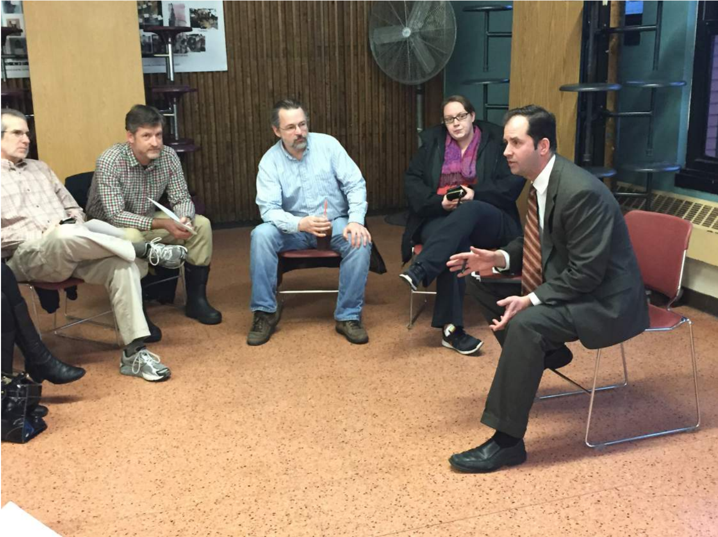
03/26/2015 KOCUSCC COMMUNITY MEETING #2