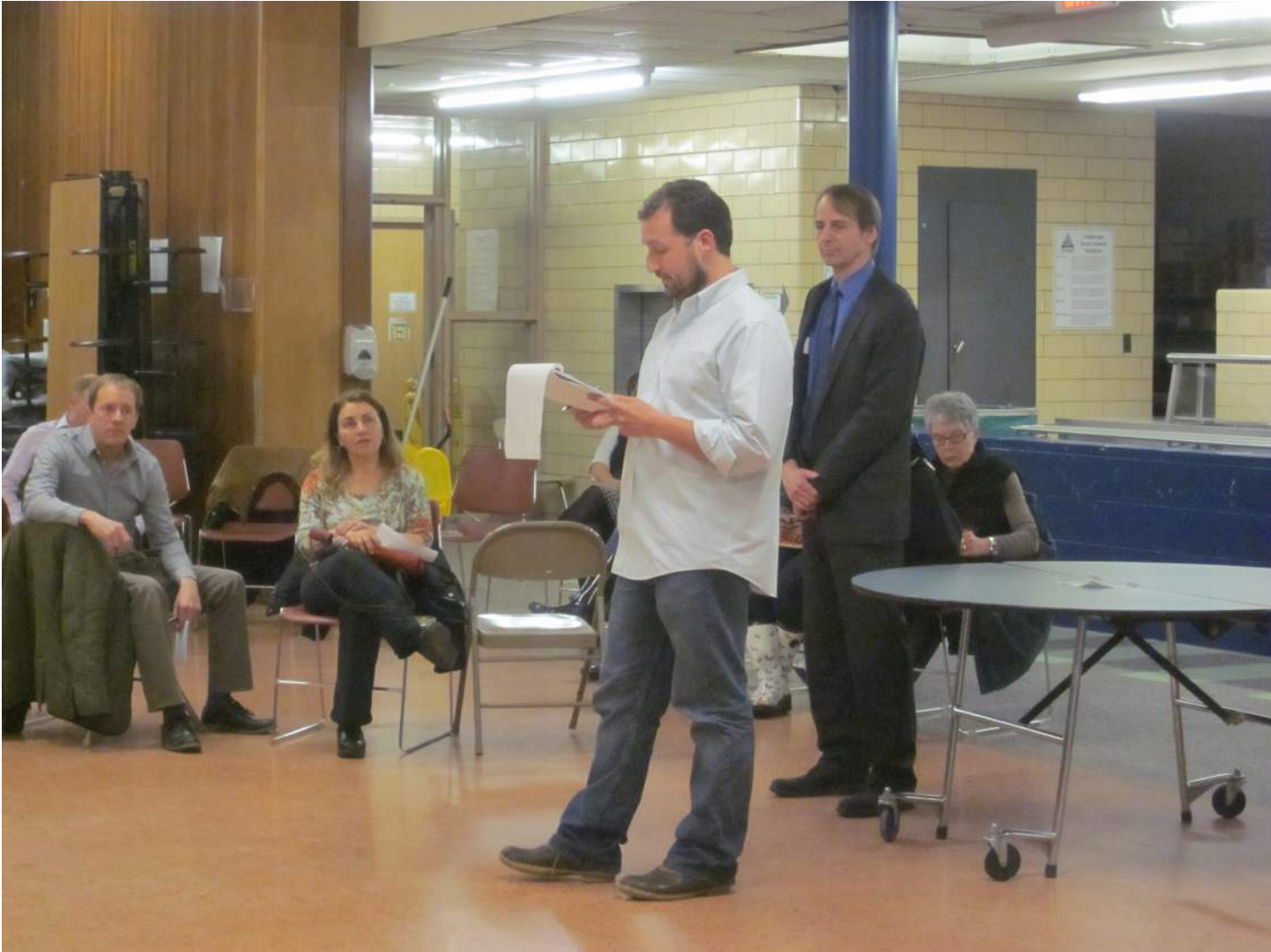
03/26/2015 KOCUSCC COMMUNITY MEETING #2