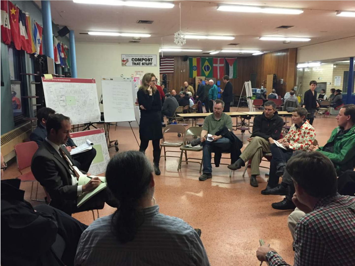
03/26/2015 KOCUSCC COMMUNITY MEETING #2