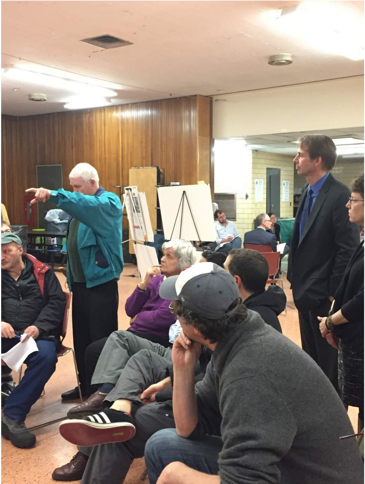
03/26/2015 KOCUSCC COMMUNITY MEETING #2