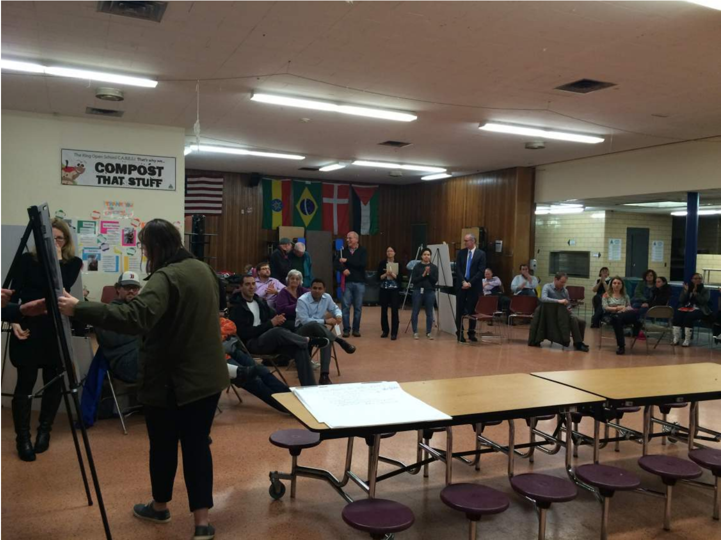
03/26/2015 KOCUSCC COMMUNITY MEETING #2