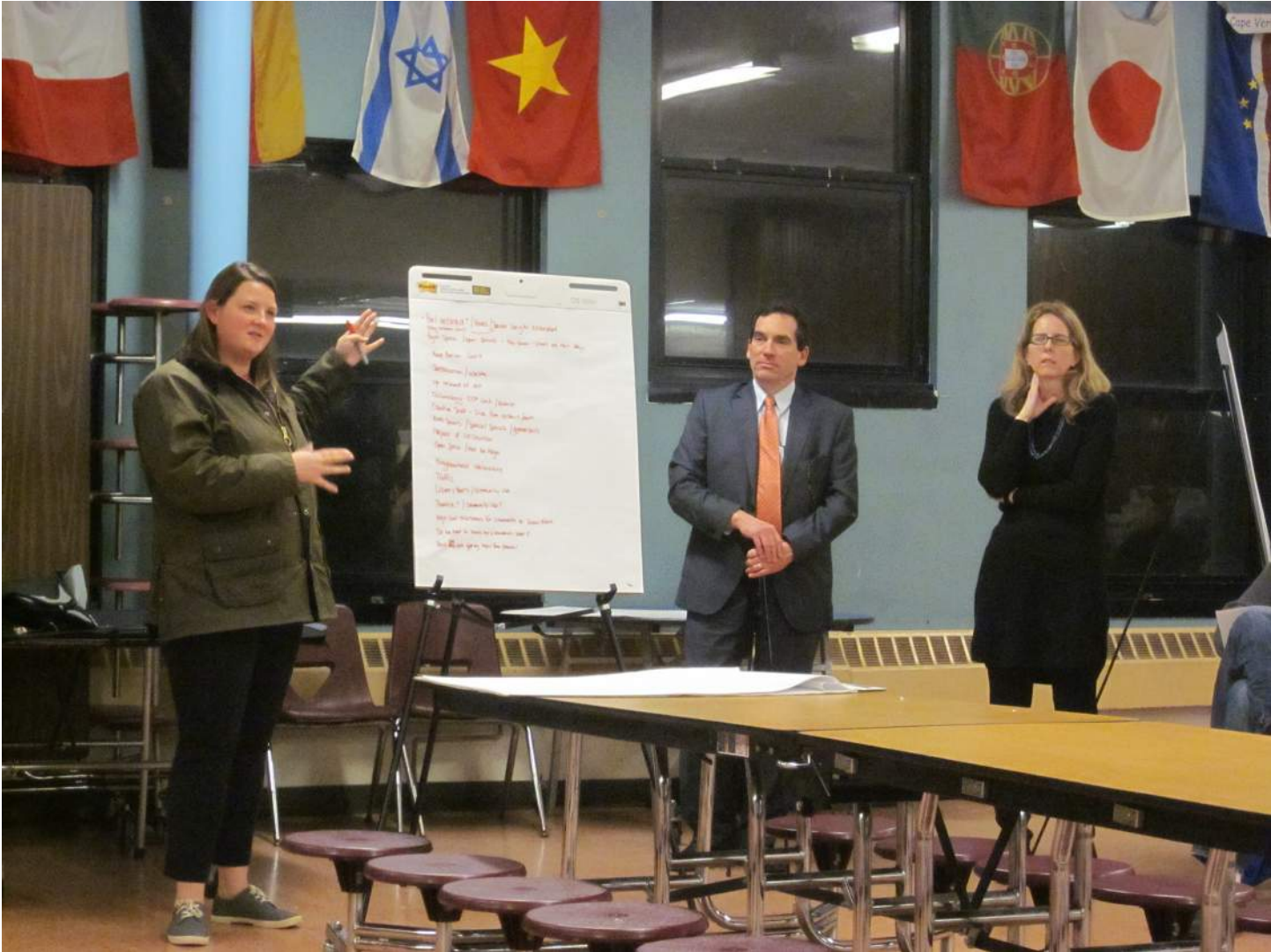
03/26/2015 KOCUSUSCC COMMUNITY MEETING #2