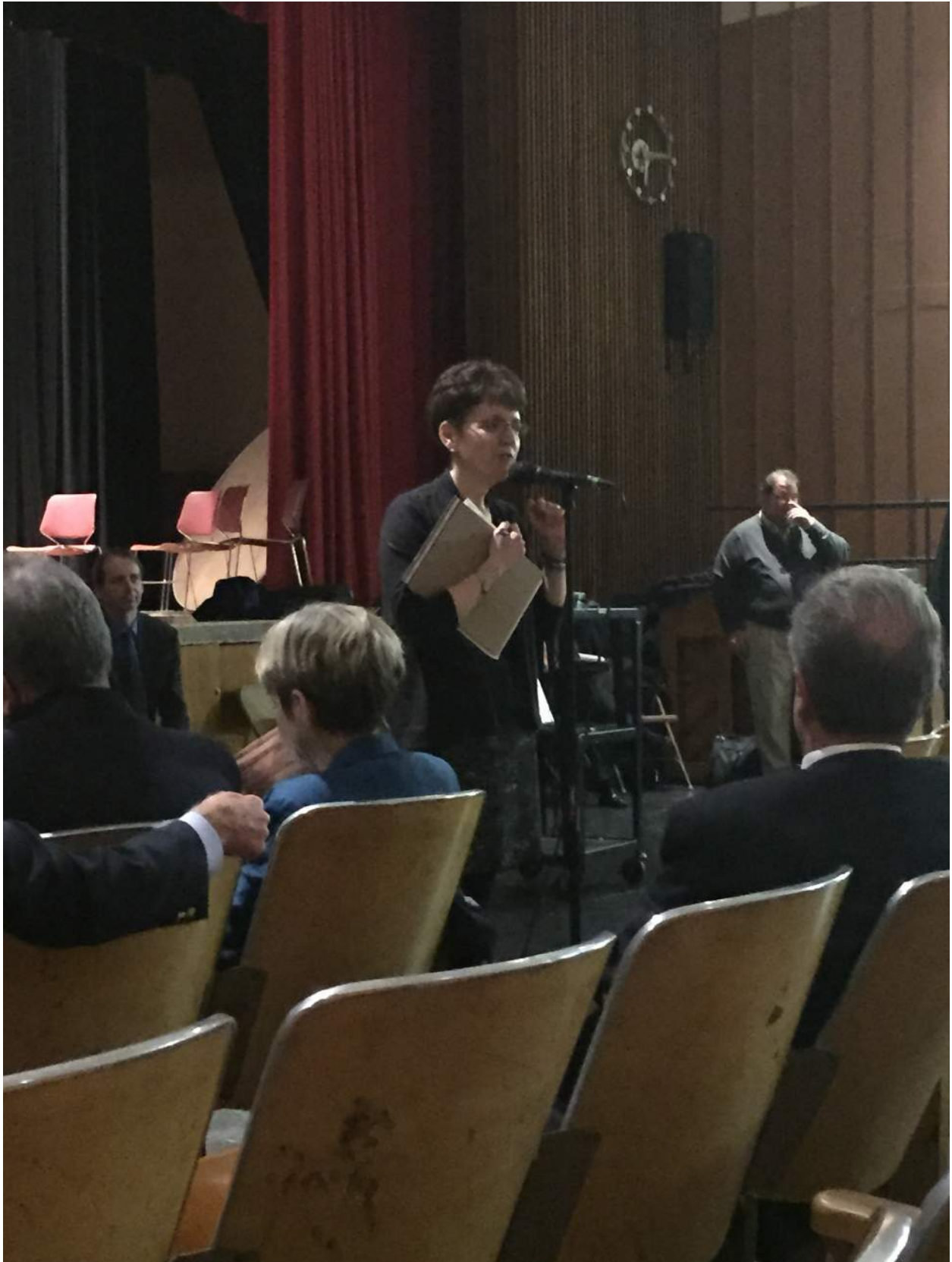
03/26/2015 KOCUSCC COMMUNITY MEETING #2