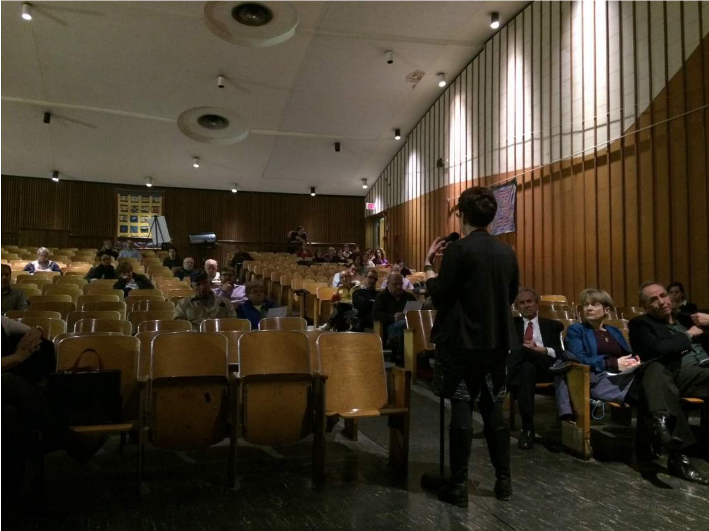
03/26/2015 KOCUSCC COMMUNITY MEETING #2