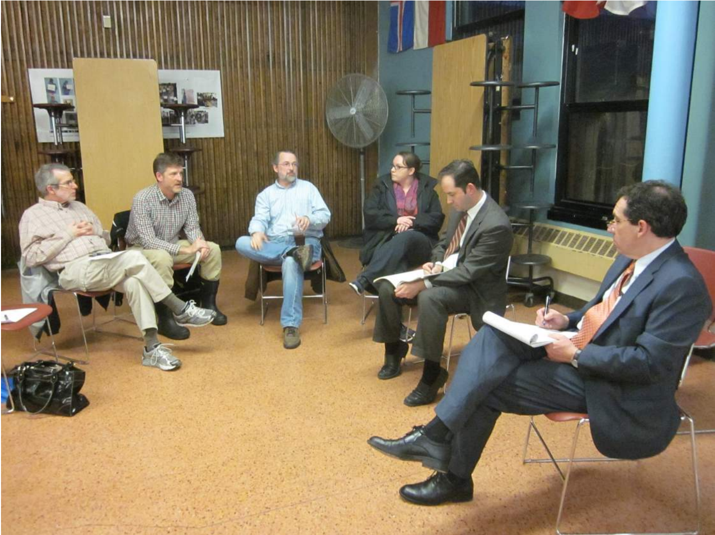
03/26/2015 KOCUSCC COMMUNITY MEETING #2