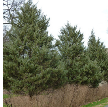
Burkii Eastern Redcedar