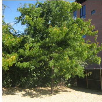
Honeylocust (to match)