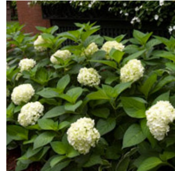
'Blushing Bride' Bigleaf Hydrangea