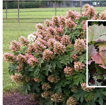
'Munchkin' Oakleaf Hydrangea