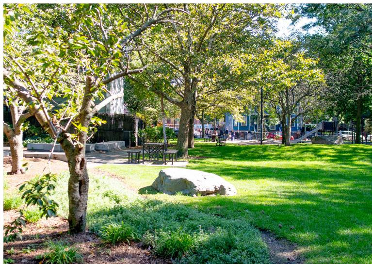
Clement Morgan Park