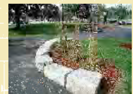
Sitting Boulders & Ornamental Grasses