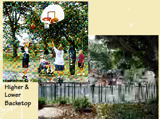
Multi Purpose Hard Surfaced Play Area

Ample play space for toddlers and older children have been retained while both passive and active water play have been added. There is a hard-surfaced play area with one full court and two half courts for shooting baskets, riding bikes, and hopscotch. The color of the play structures, fencing, kiosk and the shade arbor are muted to blend in with the historic residences of the surrounding neighborhood. All of the play structures and spaces have been upgraded to meet current federal playground safety standards and Americans with Disabilities Act access requirements.