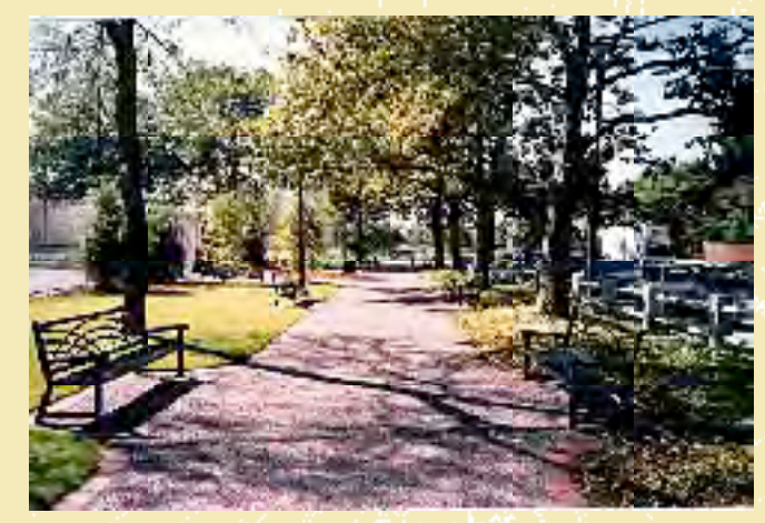
Wider Circular Path with Brick Edge & Garden Benches