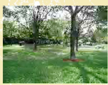
Open Space & Shade Trees