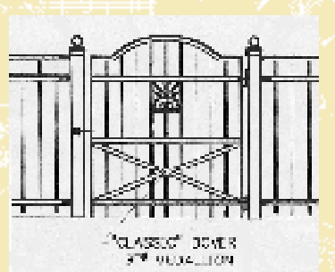
Entrance Gates with Decorative Panel and Medallion