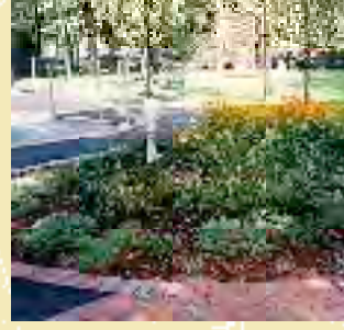
Raised Perennial Beds at Park Entrances