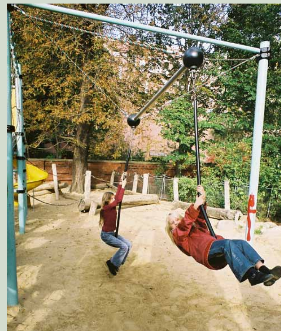
Lots of Challenging Physical Play Apparatus