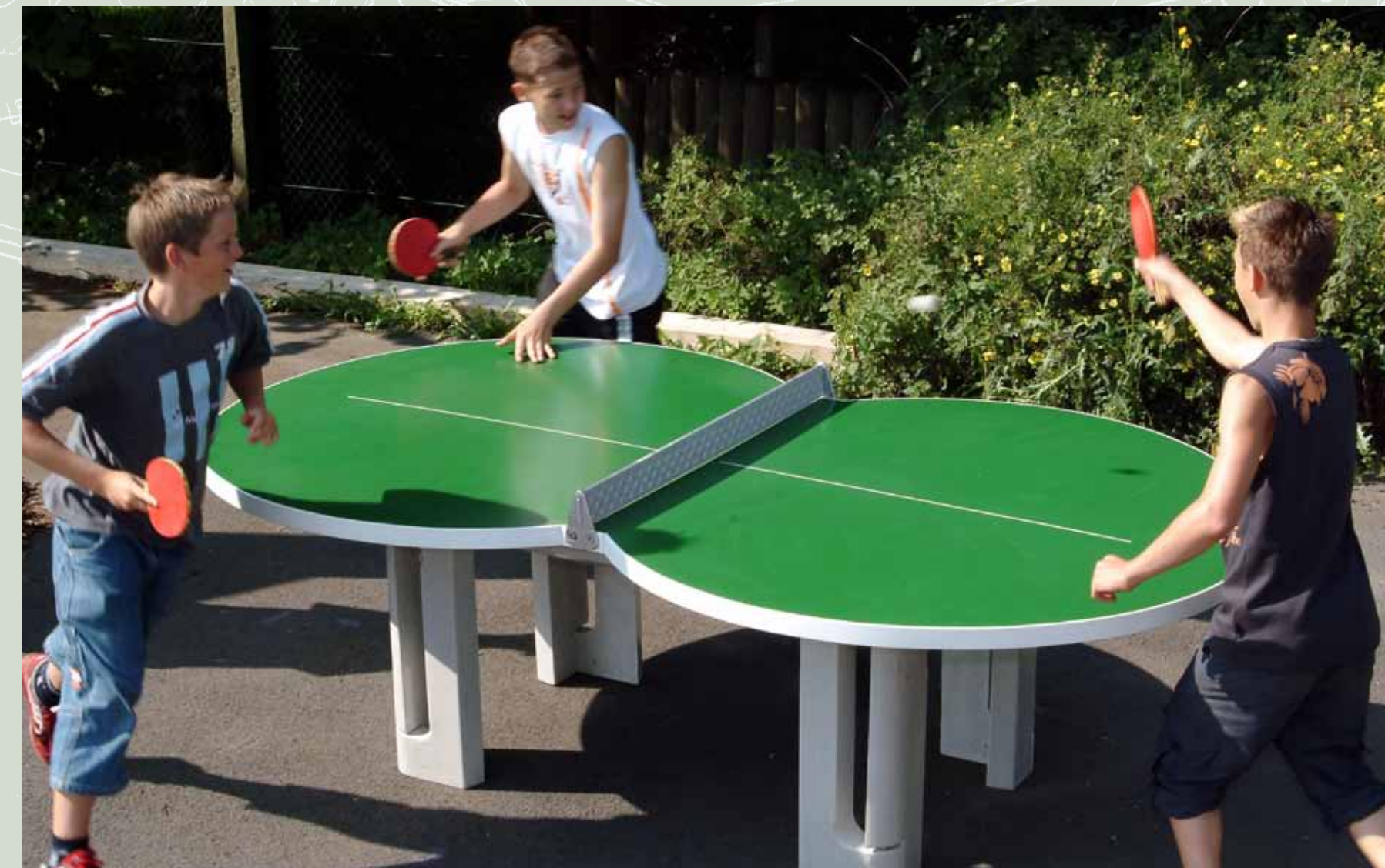
Outdoor Table Tennis