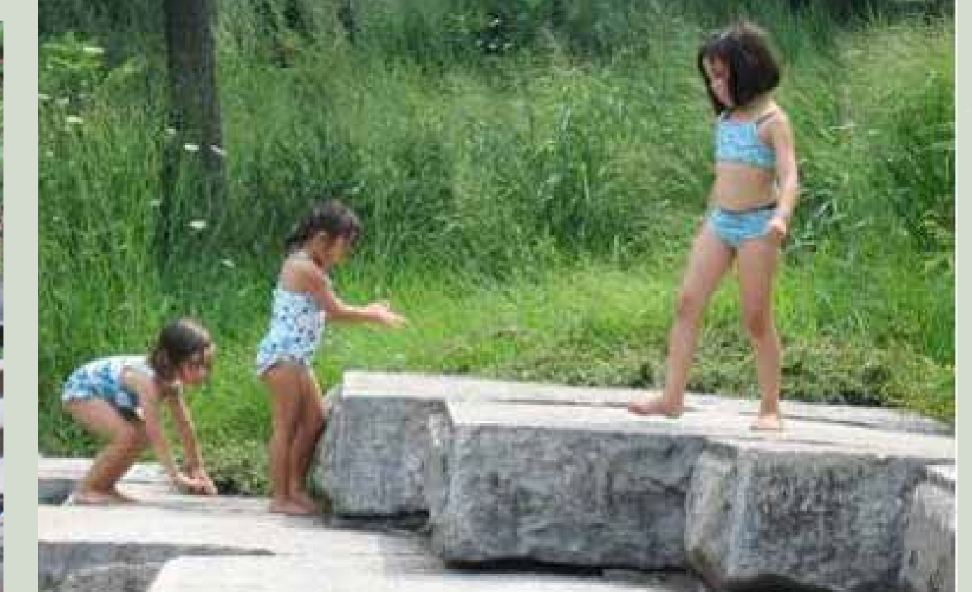
All the World's a Stage