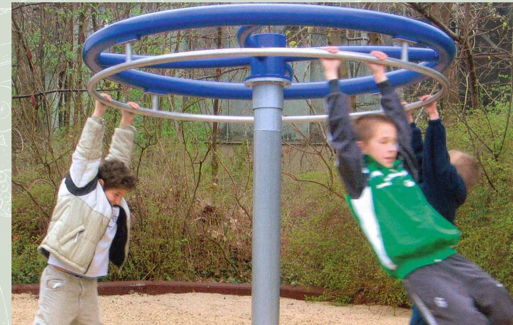
Fast and Furious Body Movement