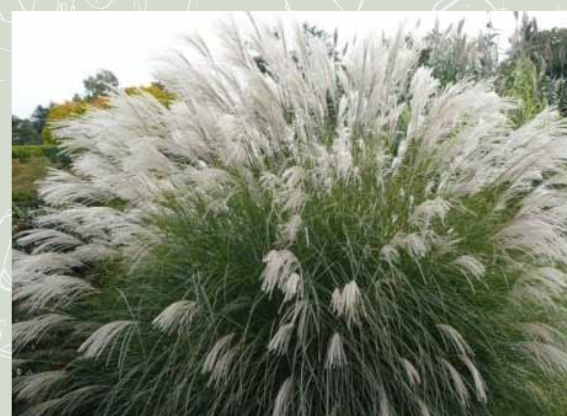
Kid Tolerant Plantings / Please Touch, Run Through and Play Tag