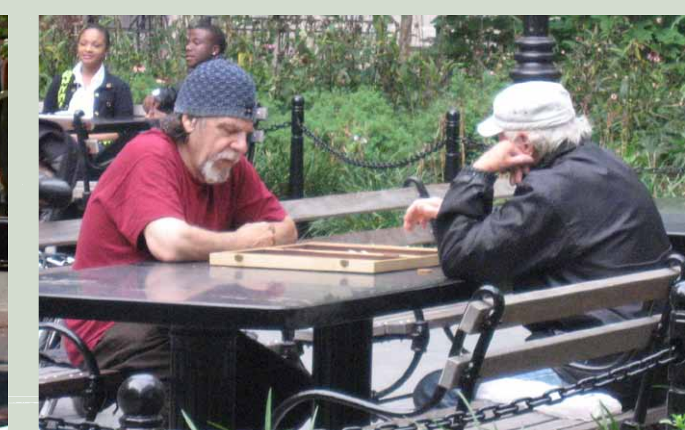
Large Group Table