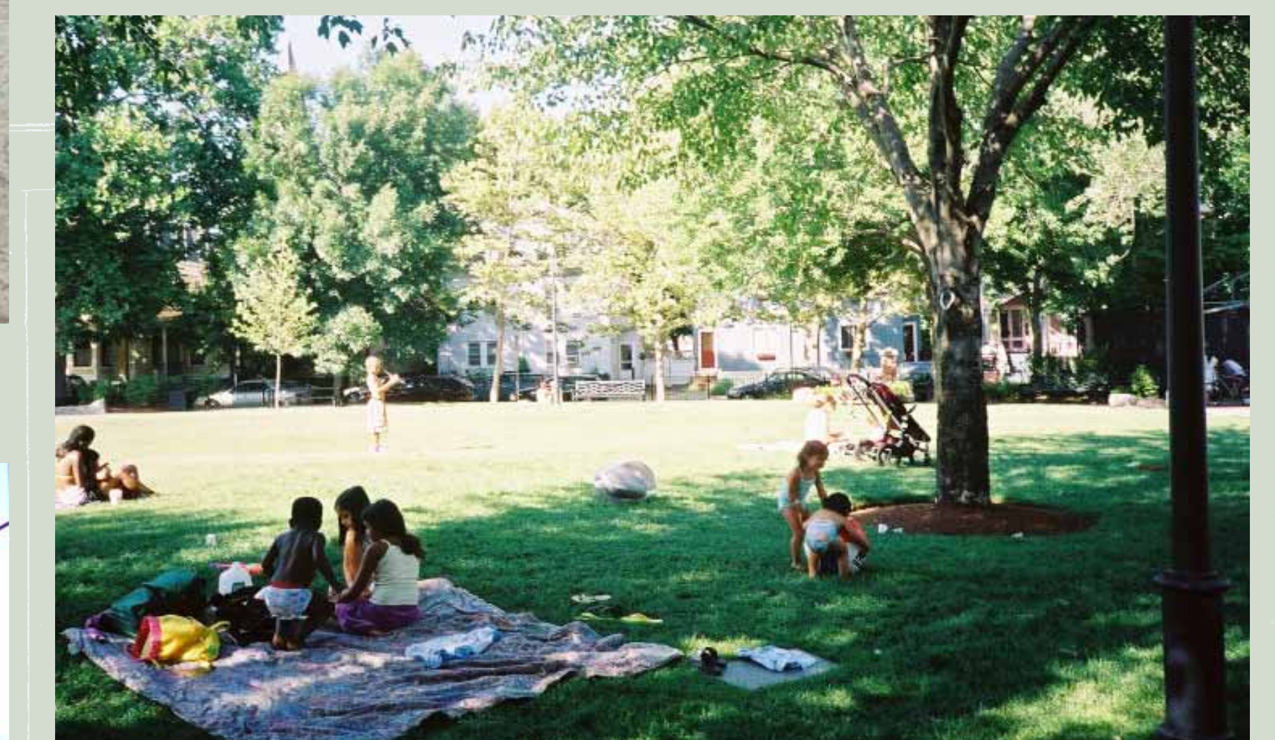
Picnic Dinner, Toss a Ball, Play an Instrument, Meditate