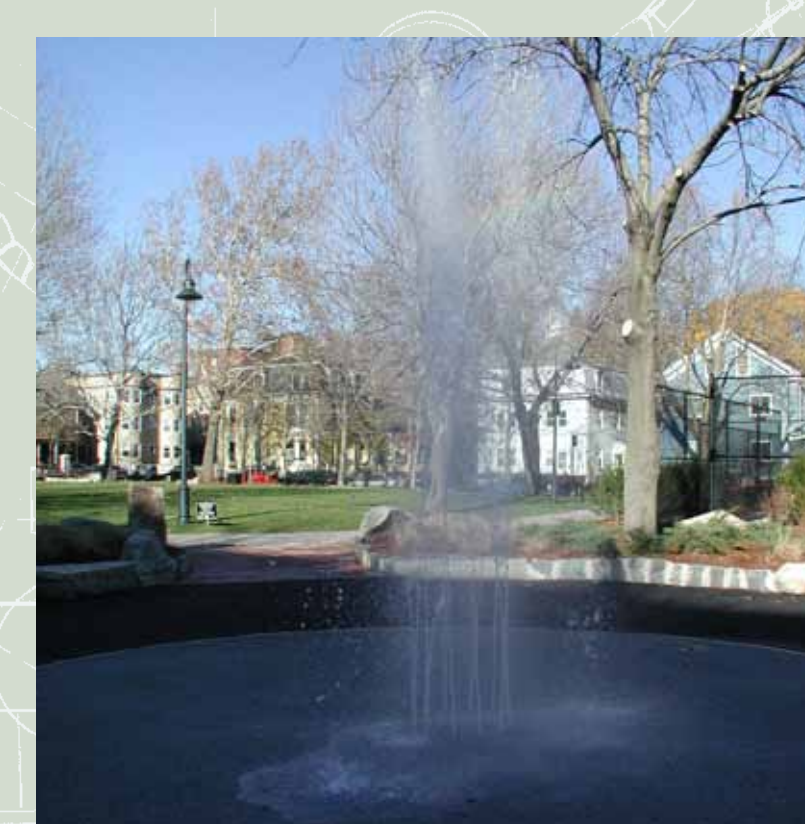
Larger Scale Water Play Jets