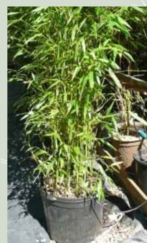
Bamboo/ Tough and Durable