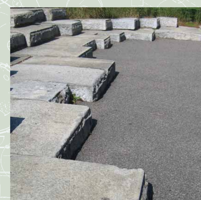
Raised Block Seating