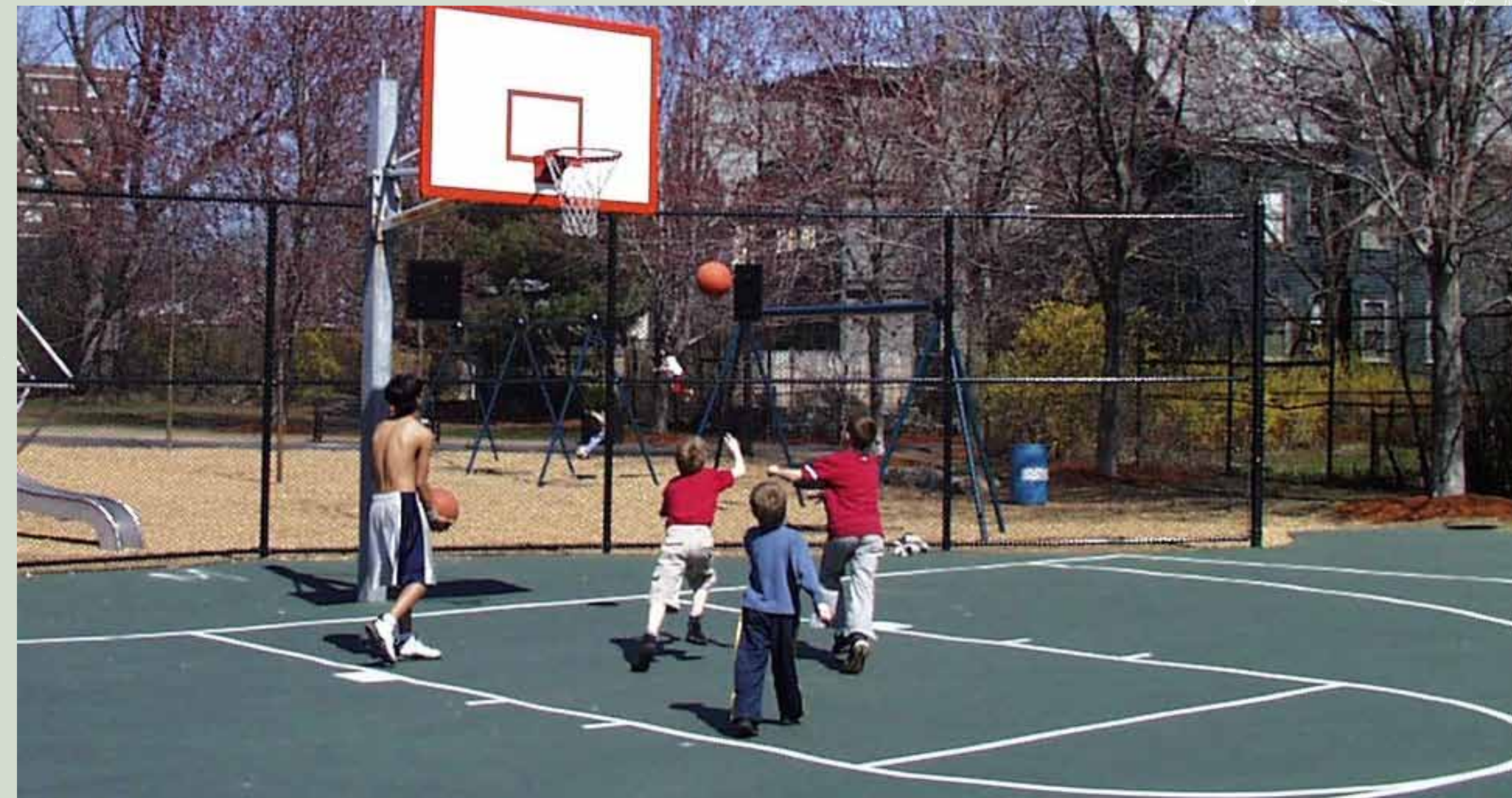
Multi-Use Court / Full and Half Basketball, Street Hockey Play