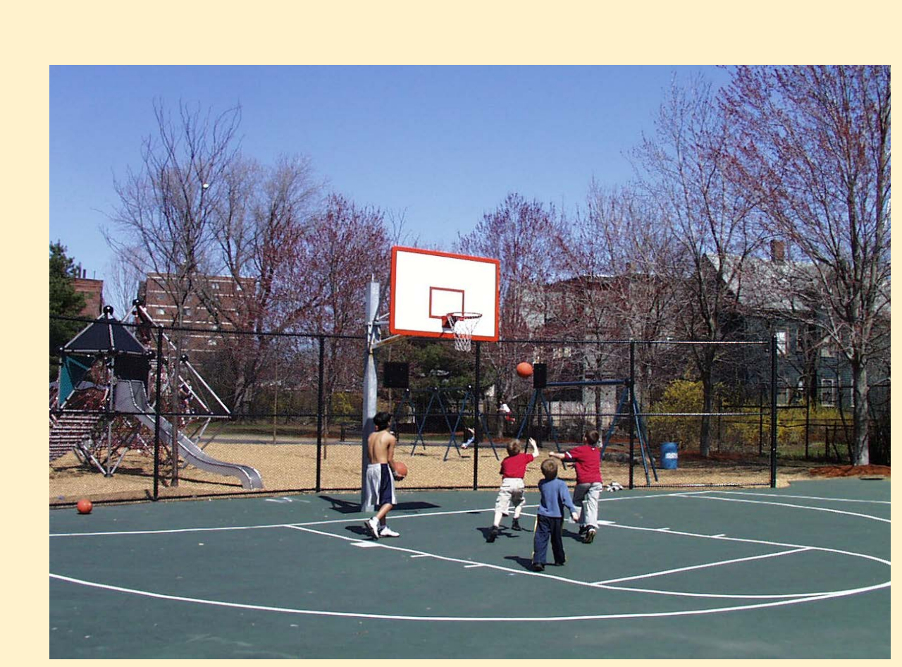
▲ HARD SURFACED PLAY AREA