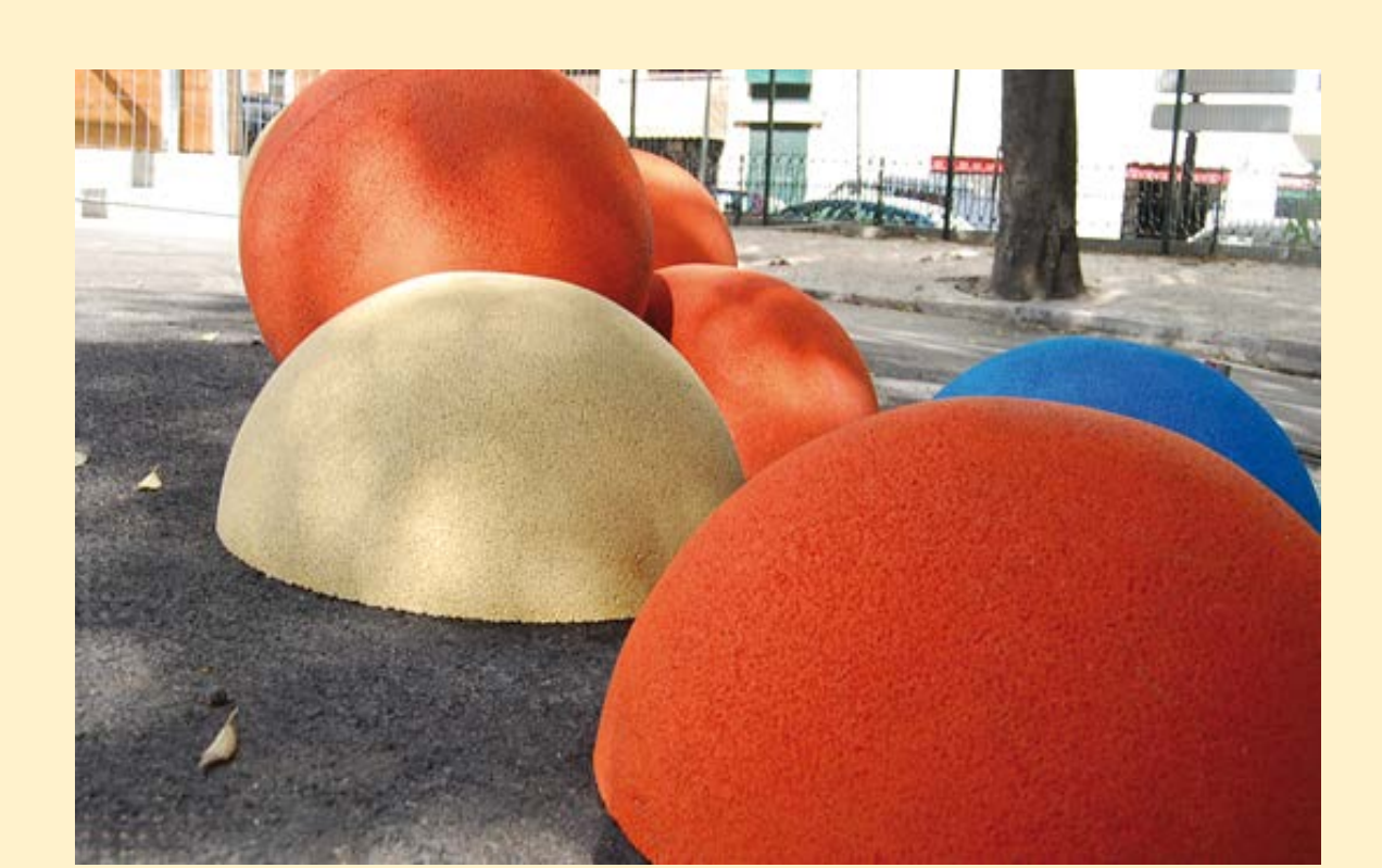
▲ NEW CLIMBER STRUCTURE