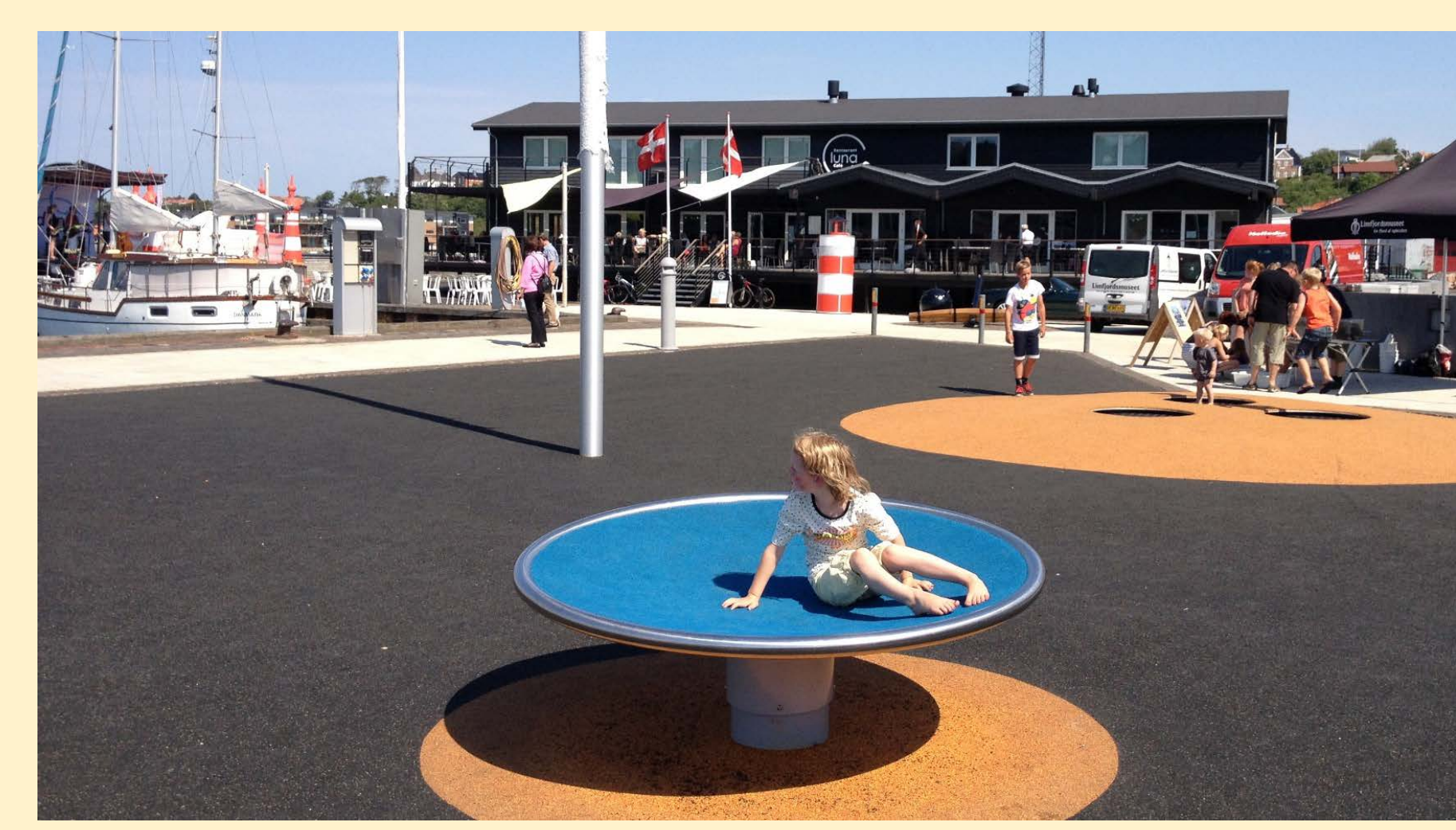
▲ "DISH" SPINNER